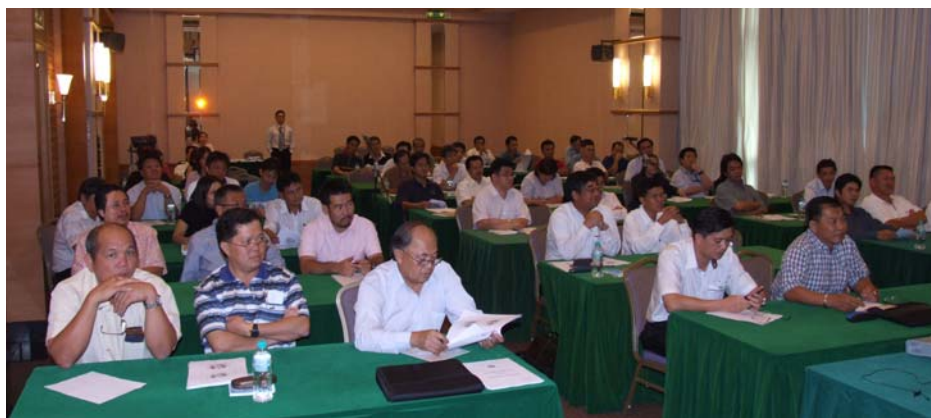
Picture: Participants at the briefing session

STA dengan kerjasama Majlis Pensijilan Kayu Malaysia (MTCC) memberi taklimat tentang syarat-syarat untuk Pensijilan Rantaian Jagaan (CoC) di bawah skim MTCC pada 21 September 2007 di Wisma STA, Kuching.