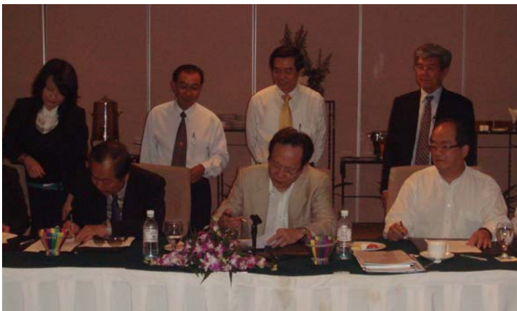
Left: Signing of the Joint Statement by STIA, TAS and STA