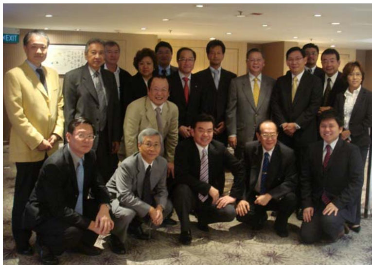
Left: One for the album, representatives from JLIA, JPMA, APKINDO, MPMA and STA

The next Meeting is proposed to be held in April 2010. ❁