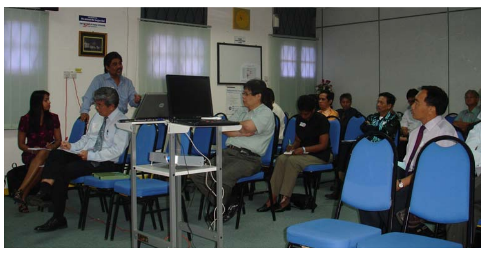
Discussing and explaining the roles and functions of the Regional Woking Group among the participants

At the meeting, participants sought clarifications on various issues related to certification and FSC. A representative from each chamber was elected to represent Sarawak at the national level.