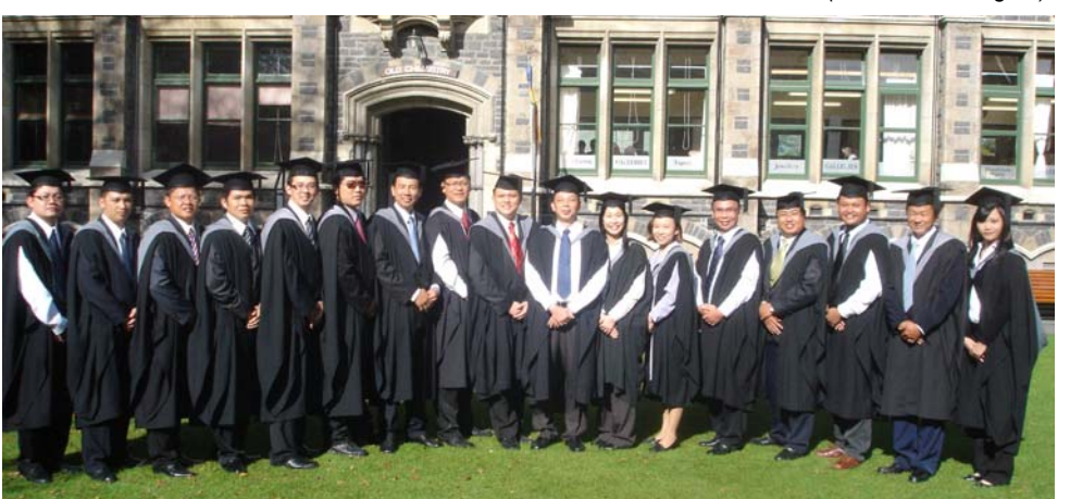
Above: The graduates in front of the Art Centre, Christchurch Below: The Graduation Ceremony at the Town Hall