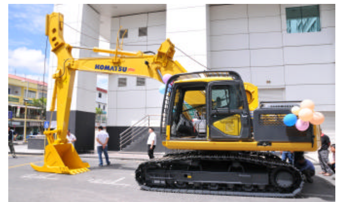
Above: Participants at the Seminar

briefed on Sustainable Forest Management Requirements Sarawak by Sarawak Forestry Corporation, Environmental Impact Assessment Requirements Forestry and Forestry Plantation Operation by the Natural Resources and Environmental Board and the various models of Swing Yarder and Log Yarder and a tracking system by Komatsu. A PC200-7 Komatsu Swing Yarder was on show near the seminar venue for the viewing of participants.