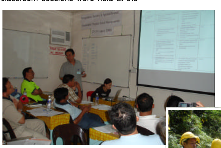
presentation by the students

Kursus ini meliputi aktiviti dalam dan luar kelas. Sesi dalam kelas telah dijalankan di kem induk manakala sesi luar kelas pula diadakan di beberapa blok unit pengurusan hutan.