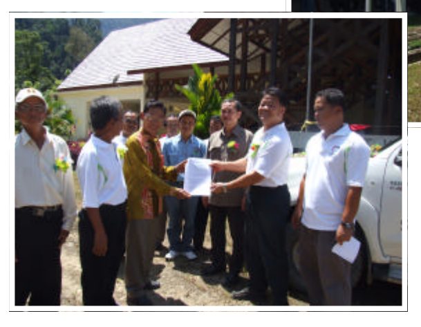
Left: Handling over ceremony