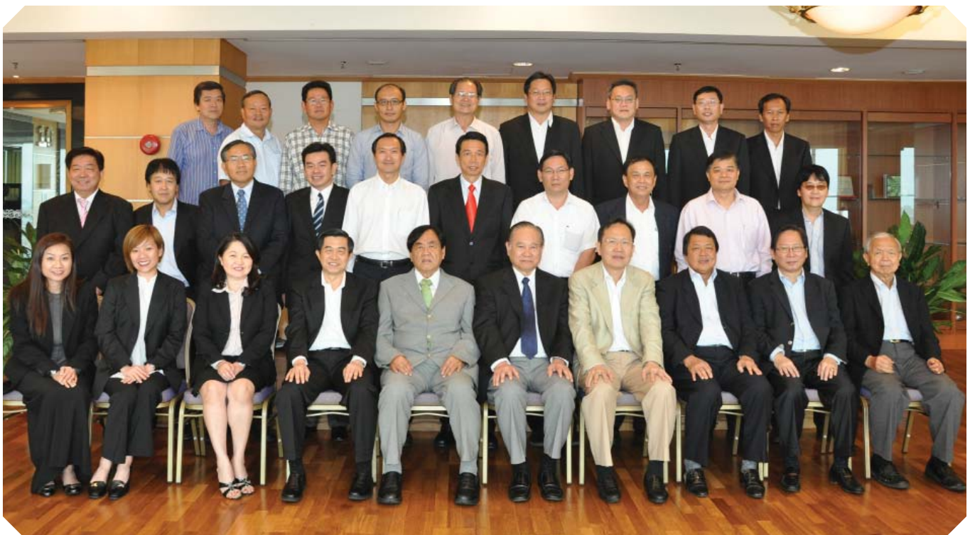
Photo: STA Council Members for years 2010 and 2011

The Meeting approved five (5) new applications for Membership and eighteen (18) applications for the conversion of Associate Membership to Membership. The Meeting also endorsed the cancellation of twenty-one (21) members who failed to renew their membership.