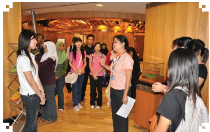
Photo: Students at the Centre

The visit ended with a tour of STA Exhibition Centre. The group had an informative session while exploring what the Exhibition Centre has to offer.