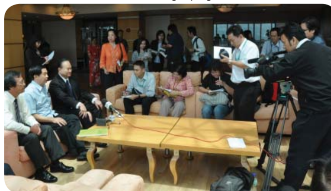
Photo: Press Conference after the Meeting

Panel Semakan Semula Cukai (TRP) telah mengadakan lawatan sambil sesi dialog ke Wisma STA, Kuching pada 3 Ogos 2010.