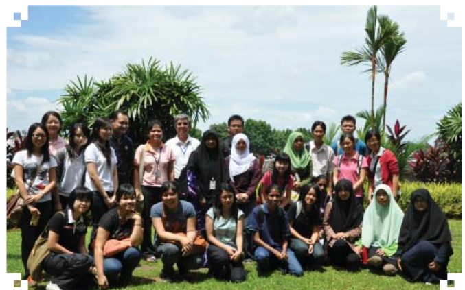
Photo: Group photo