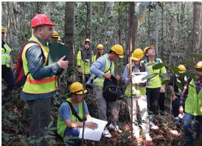
Photo: Briefing to all students and participants of the Course before working in group in different plots assigned