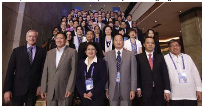
Photo: Photo Courtesy from APEC 2015 on the APEC delegates at the Joint Meeting of the EGILAT and ACTWG

The Joint Meeting also agreed that APEC Economies should nurture and sustain good governance, economic development and prosperity by working together to fight corruption and ensure transparency in trading legal timber.