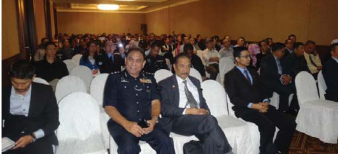
Photo: Briefing in Kuching

The Forest Department Sarawak (FDS) in collaboration with the Sarawak State Attorney-General's Chambers (SAG) organised a series of Roadshow on Forests Ordinance 2015 from 18 to 21 August 2015 in three (3) zones statewide, i.e. Southern Zone at the Hilton Hotel in Kuching, Central Zone at RH Hotel in Sibu and Northern Zone at Imperial Hotel in Miri respectively.