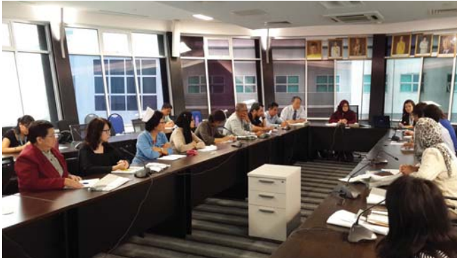
Photo: Dialogue session in progress

The Sarawak State Health Department organised a Dialogue Session for timber operators in Sarawak with Sick-Bay/ Clinic facilities on 25 August 2015 at Petra Jaya, Kuching. Approximately twenty (20) representatives mainly managers, registered medical assistants, registered nurses and representatives from Sarawak Timber Association (STA) member companies as well as staff members of STA Secretariat attended the Dialogue.