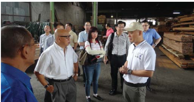
Photo: Mill visit to Kayusar Sdn Bhd

The twenty seven (27) participants comprising TEAM delegation, representatives from STA member companies