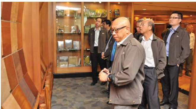
Photo: Tour of STA Exhibition Centre