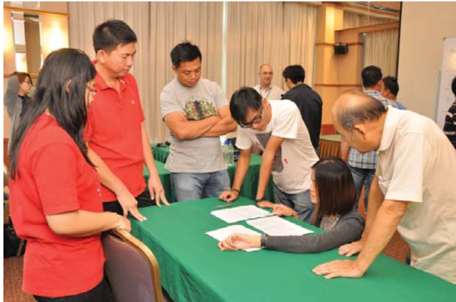
Photo: Re-analysing trees >10cm based on the data provided in the tutorial sessions

The next subject, “Wood Processing and Planning” is scheduled to be held outside Kuching i.e. Bintulu/Sibu from 10 to 16 October 2015.