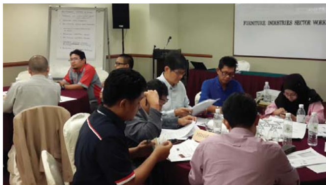
Photo: Workshop in progress

The Academy of Sciences Malaysia (ASM) organised the Mega Science Agenda – Malaysia 2050 Consultative Workshop for the Furniture Industry Sector on 11 August 2015 at the Merdeka Palace Hotel, Kuching. The Workshop was attended by approximately thirty (30) stakeholders representing the policy makers, industry players, scientific community as well as professional bodies.