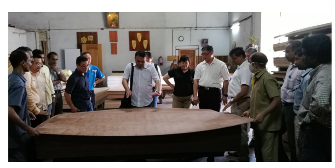
Photo: The delegates admiring the fancy veneer at Jacsons Veneers & Panels PVT. LTD.