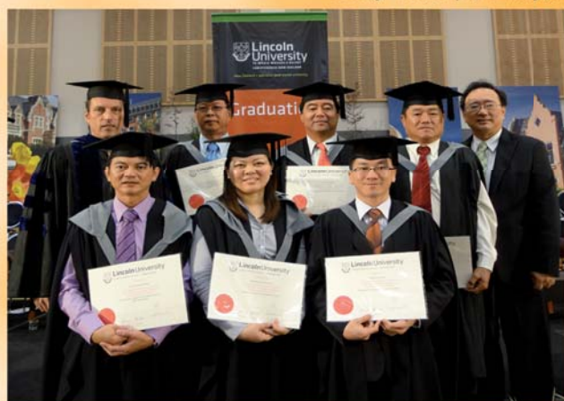
Lincoln University Postgraduate Diploma Graduation Ceremony, 6 May, New Zealand