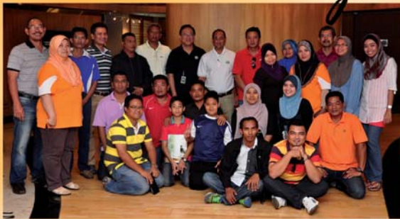
Visit by Forest Department Negeri Sembilan, 12 November