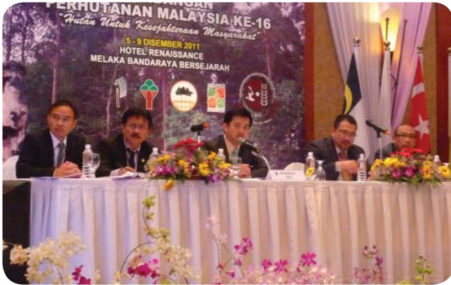
Photo: Conference in progress

The Forestry Department Peninsular Malaysia in cooperation with the State Government of Malacca, the Ministry of Natural Resources and Environment, Sabah Forestry Department, Sarawak Forest Department and Sarawak Forestry Corporation organised the 16 th Malaysian Forestry Conference in Malacca from 5 to 9 December 2011 with the theme "Forests for Community Livelihood". This triennial Conference was attended by participants from Peninsular Malaysia, Sabah and Sarawak.