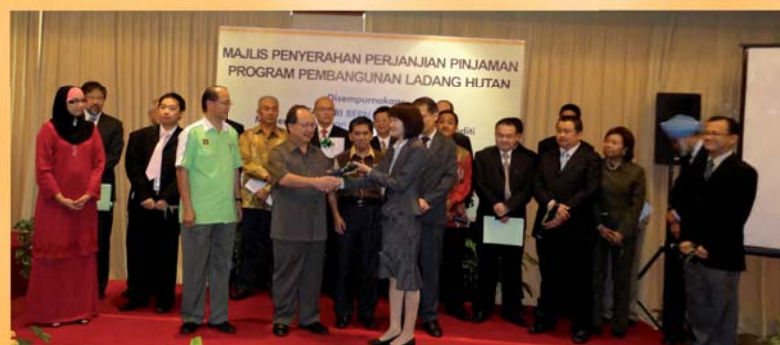
The Malaysian Timber Industry Board's Forest Plantation Division Loan Agreement and Book Launching, 29 June, Kota Kinabalu