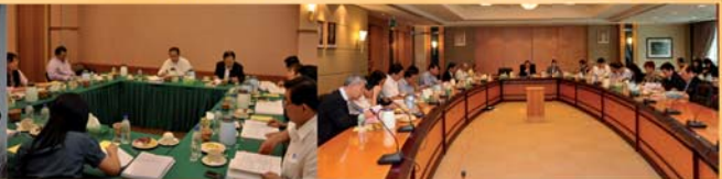
Furniture and Other Wood Working Committee Meeting