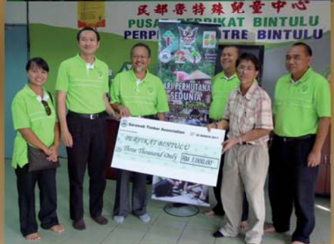
World Forestry Day, 22 March, Bintulu