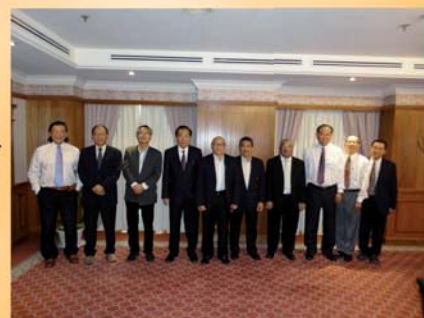
Malaysian Timber Association Annual General Meeting, 27 June, Kuala Lumpur