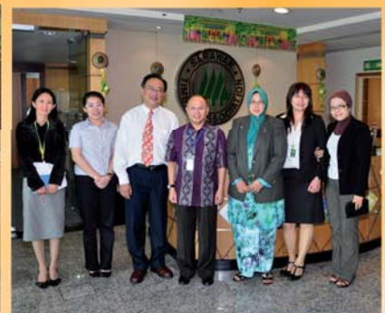
Discussion with STIDC on Proposed Amendment of the Sarawak Timber Industry (Registration) Regulations, 2008, 22 September, Wisma STA