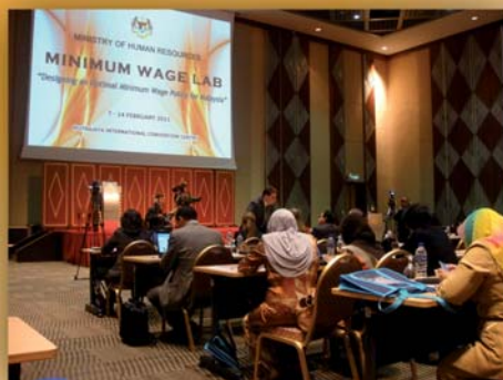
Minimum Wage Lab, 7 February, Putrajaya International Convention Centre, Kuala Lumpur