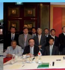
Tri-Nation Meeting In