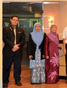
Visit by the Director of Timber Industry