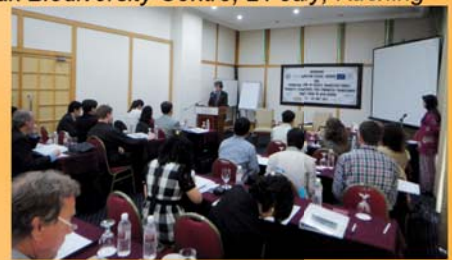
Timber Tracking Workshop, 26 to 28 July, Kuala Lumpur