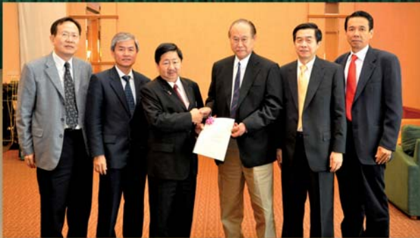
Tax Incentives Dialogue on Forest Plantation Development, 23 March, Wisma STA