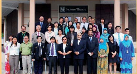
Consultative Meeting by the State Planning Unit, the State Attorney General Chamber and the Sarawak Biodiversity Centre, 21 July, Kuching