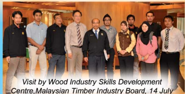
Visit by Wood Industry Skills Development Centre, Malaysian Timber Industry Board, 14 July