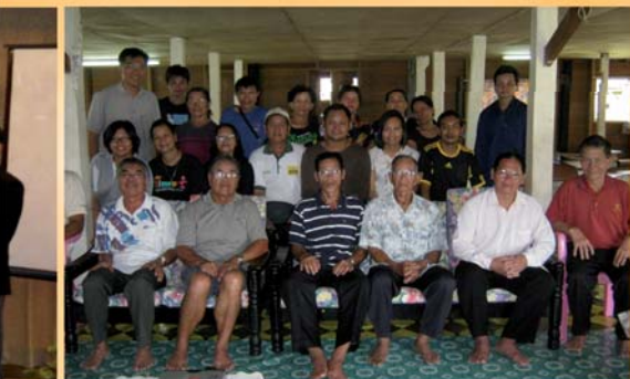
Conflict Resolution Guidelines for Sustainable Forest Management, 25 to 30 June, Long Lellang