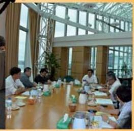
Panel Products Committee Meeting