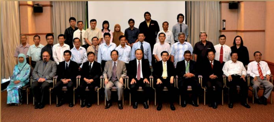
Financial Contributions to the Private Chinese Secondary Schools, 25 January, Wisma STA