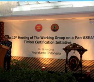
10th Pan ASEAN Timber Certification, 25 to 27 May, Yogyakarta Indonesia