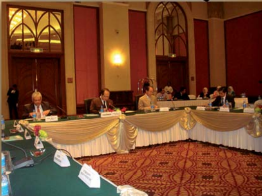
Malaysian Timber Industry Board Dialogue, 24 January, Kuala Lumpur