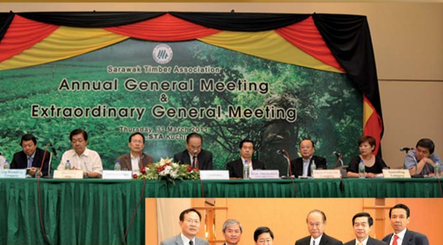
Meeting and Extraordinary 31 March, Wisma STA