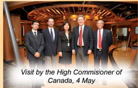
Visit by the High Commissioner of Canada, 4 May