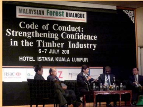
Malaysian Forestry Dialogue Code of Conduct: Strengthening Confidence in the Timber Industry, 6 to 7 July 2011, Hotel Istana, Kuala Lumpur