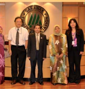
Director-General of Malaysian Timber Industry Board, 6 September