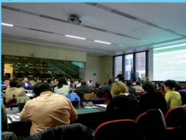
Integration of Domestic Timber Markets in FLEGT/VPA and REDD+, 17 January, Brussels, Belgium