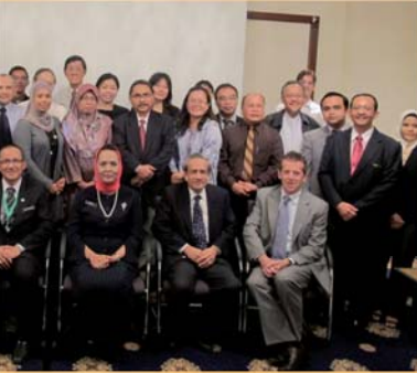
Meeting of Stakeholder Consultation, June, Kuala Lumpur