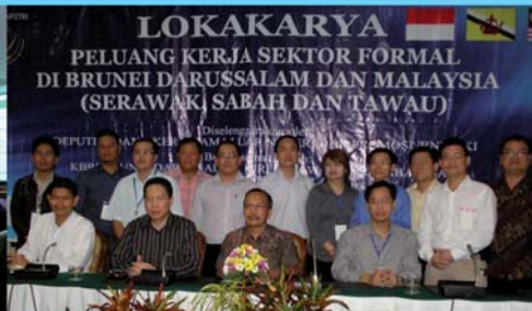
Recruitment of Indonesian General Workers, Malaysian Timber Council Business Visit, 22 to 25 March, Yogyakarta, Indonesia