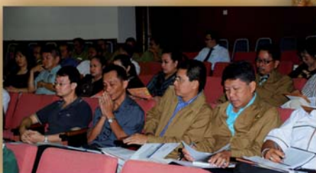
Sarawak Timber Industry Development Industry Update, 23 February, Wisma Sumer Alam, Kuching