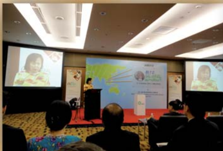
Briefing on the Malaysian Timber Council Global Wood Mart, 4 April, Kuala Lumpur