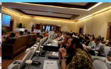
International Conference on Forest Tenure, Governance and Enterprise, 11 to 15 July, Lombok Indonesia