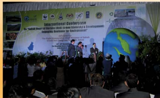
International Conference on "Sabah Heart of Borneo (HoB) Green Economy & Development: Engaging Business for Environment", 15 to 18 November, Kota Kinabalu