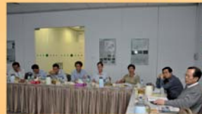
Labour and Industrial Law Committee Meeting