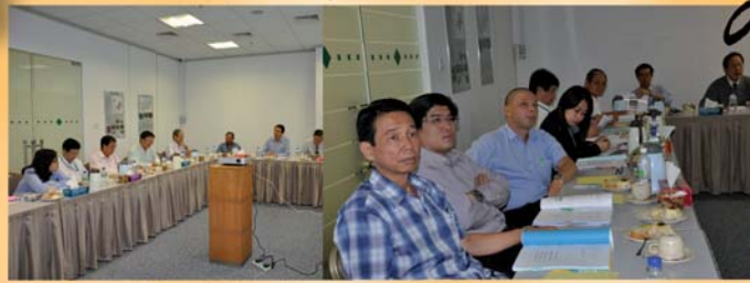
Forest Plantation Committee Meeting