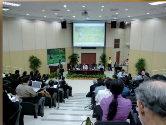
The International Conference on the law on customary lands, 25 January, Kuala Lumpur