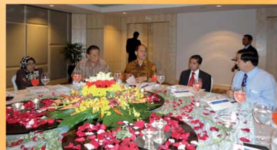
Financial Study on Tax Incentives for Forest Plantation Development, 28 June, Kuala Lumpur