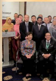
Meeting on Mapping 15 June