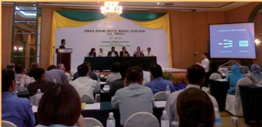
Session with the Industry on the Benefits of Certificate of Origin, 27 June, Kuching