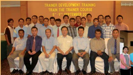
STAT Trainer Development Training Train-the-Trainer Course, 5 to 9 September, Bintulu