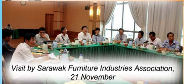
Visit by Sarawak Furniture Industries Association, 21 November