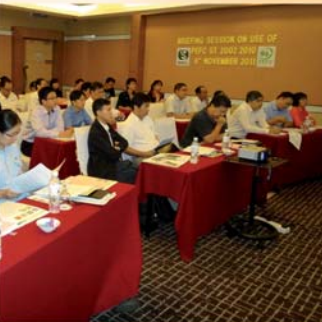
Left: Briefing Session on the use of PEFC ST 2002 2010, 8 November, Bintulu