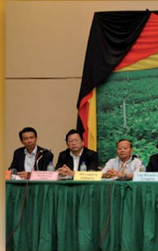
STA Annual General Meeting General Meeting, 31 M