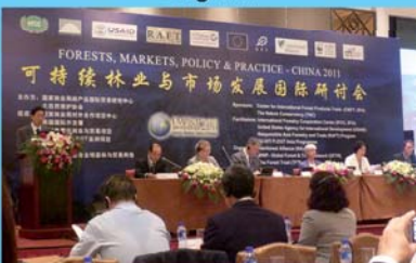
4 th Annual International Conference and Workshop on 'Forests, Markets, Policy and Practice', 22 to 23 June, Shanghai, China