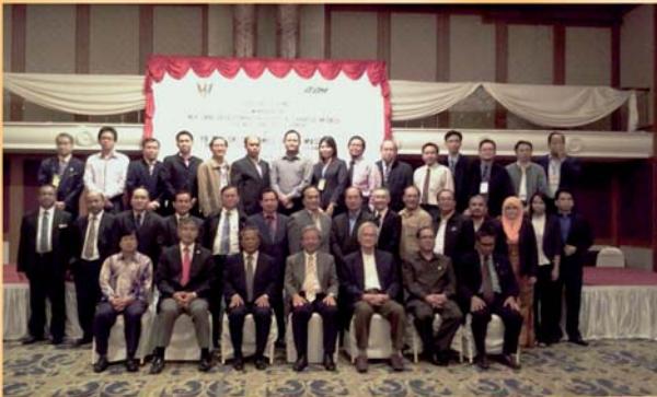
Workshop on Native Customary Rights, 3 to 7 October, Kuching