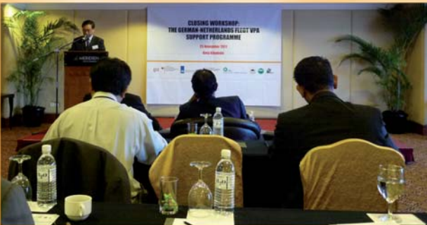
Closing Workshop: The German-Netherlands FLEGT VPA Support Programme, 25 November, Kota Kinabalu