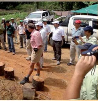
Left: Daiken Sarawak Sdn Bhd Field Visit, 6 to 7 October, Tubau, Bintulu