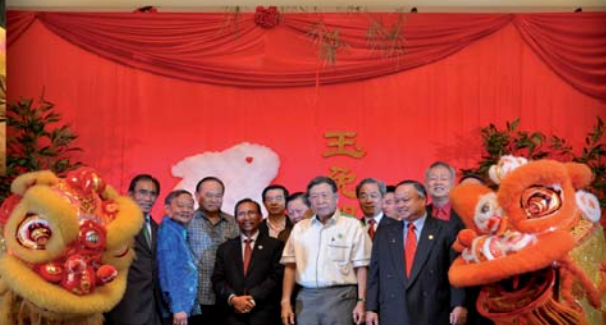
STA Open Office, 16 February