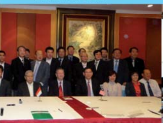
Meeting, 25 October, Jakarta, Indonesia