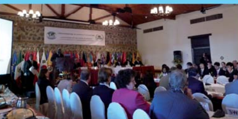
47th International Tropical Timber Council, 14 to 19 November, Guatemala