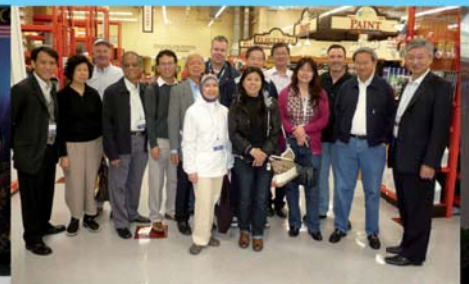
9 to 20 April, USA