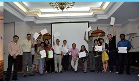
Advanced Mediation Course for Natural Resource Conflict Management Practitioners, 24 to 27 May, Bali Indonesia