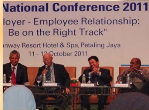
MEF National Conference 2011, 11 to 12 October, Petaling Jaya