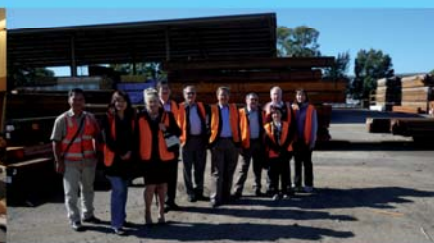
Malaysian Timber Council Business Visit, 24 to 31 July, Australia