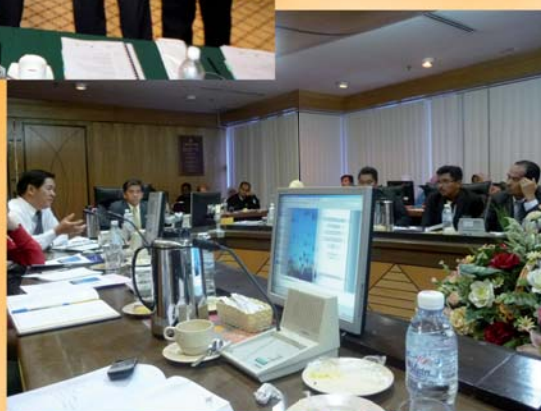
Malaysian Timber Industry Board Industry Lead Body Concept, 3 May, Kuala Lumpur