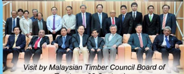
Visit by Malaysian Timber Council Board of Trustees, 22 September