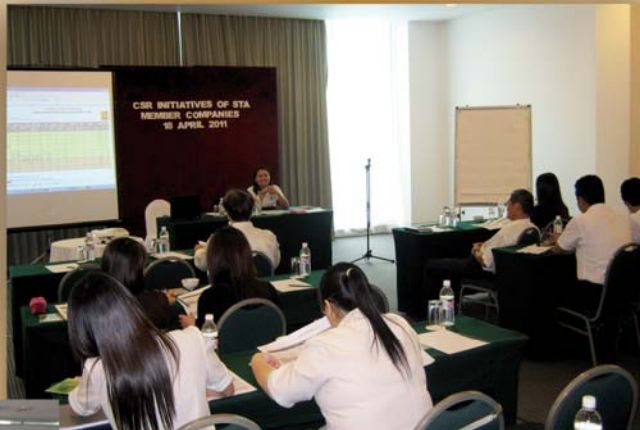
Above: Roadshow on CSR Initiatives of STA Members in Sibul, Miri and Bintulu, 18 to 25 April