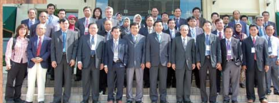
Left: Participants from the Asia-Europe Meeting (ASEM) Conference on "Forest, Forest Governance and Forest Products Trade: Scenarios and Challenges for Europe and Asia" held from 4 to 5 May 2010 in Phnom Penh, Cambodia