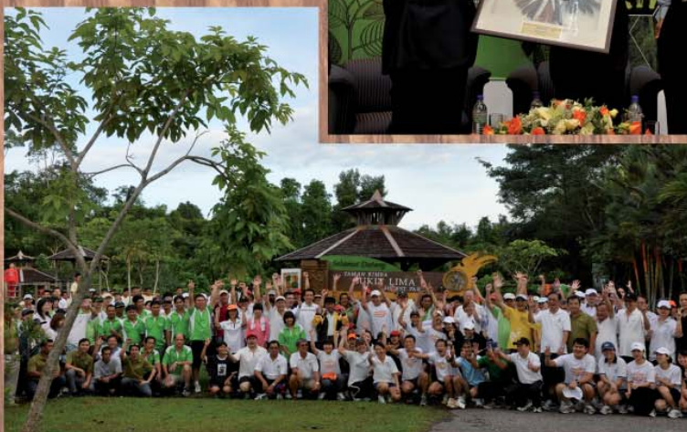
Above: STA organised an event at Bukit Lima Forest Park on 26 September 2010 to mark the completion of repair work to the plank walkway which costs RM366,000. The event was attended by 300 people.