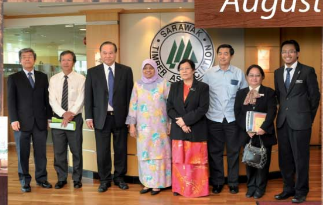
Above: Dialogue session between the Tax Review Panel (TRP) and STA held on 3 August 2010 at Wisma STA.