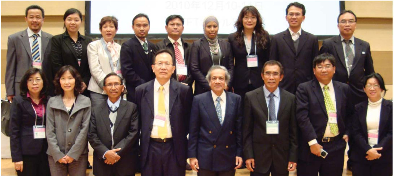
Photo: Malaysian delegation to the International Symposium on Legality Verified Wood 2010

The International Symposium on Legality Verified Wood 2010 cum poster presentation, with a theme “Activities in Japan to tackling Illegal Logging Issues”, was jointly organised by the Japan Federation of Wood Industry Associations (JFWIA) and the Japan Lumber Inspection & Research Association (JLIRA) from 10 to 11 December 2010 in Tokyo, Japan. It was sponsored by the Forestry Agency of Japan and the Ministry of the Environment of Japan.