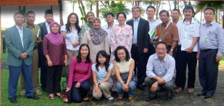
Above: Participants at the Inter Agency Working Group Meeting, comprising senior officers from Sarawak Timber Industry Development Corporation (STIDC), Forest Department Sarawak, (FDS), Sarawak Forestry Corporation (SFC), Harwood Timber Sdn Bhd and STA which was held on 28 June 2010 at the Damai Beach Resort