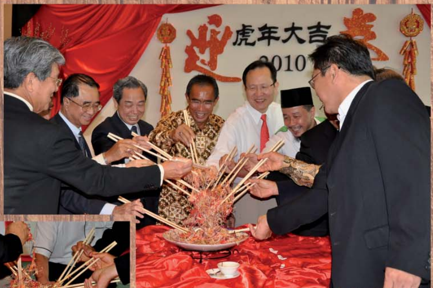
Left : The symbolic tossing of "Yee Sang" during STA Chinese New Year Open House on 23 February 2010 at Wisma STA