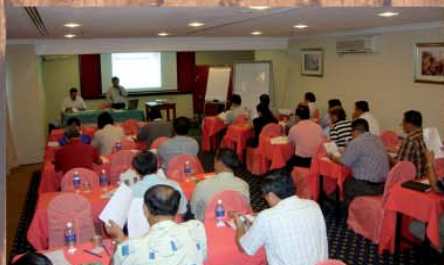
Right: The STA Hill Logging Committee Meeting held on 3 May 2010 in Kuching