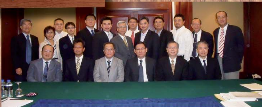
Above: The Tri-Nations Meeting was held for the twelfth time in Kuala Lumpur on 24 September 2010