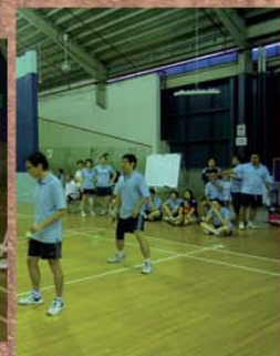
Above : Badminton Competition held on 6 November 2010