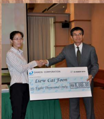
Above: Cheque Presentation Ceremony to Private Chinese Secondary Schools, presentation of STA and Daiken Scholarships on 25 March 2010 at Wisma STA