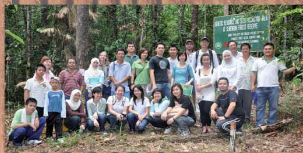
Above: Visit to the Indigenous Tree Plantation Semenggoh Forest Reserve (Landeh), Kuching on 22 May 2010