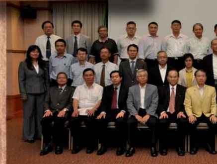
Above : Meeting between Japan Lumber Association (JLIA) and STA held on 30 July 2010 at