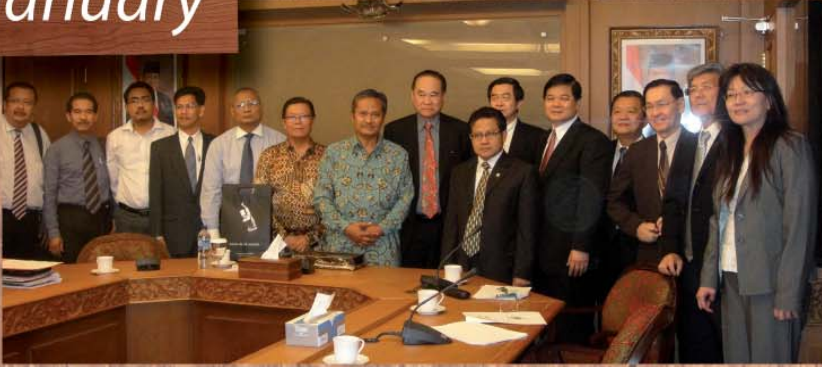
Left: A delegation led by Pemasca Datuk Wong Kie Yik, Chairman of STA with Yang Terhormat Bapak Muhaimin Iskandar, the Minister of Transmigration and Manpower of the Republic of Indonesia on 20 January 2010 in Jakarta