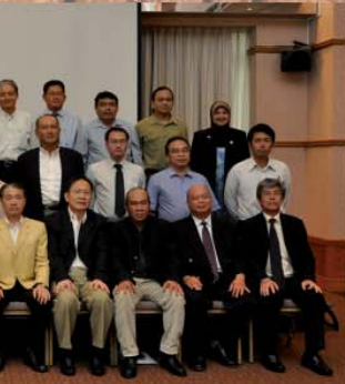
Number Importers' Association 2010 at Wisma STA