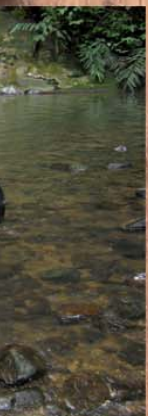
from Left) from ly tour to the r 2010 to gain