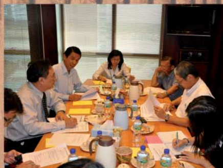
Left: The STA Forest Plantation Committee Meeting held on 3 May 2010 in Kuching