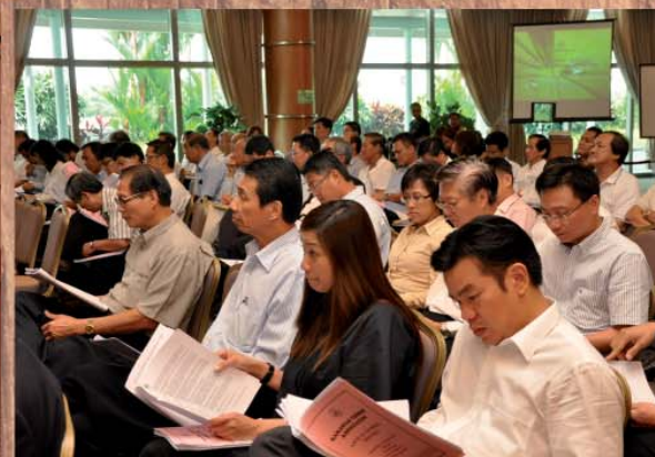
Above: STA Members, observers and invited guests at the Annual General Meeting (AGM)