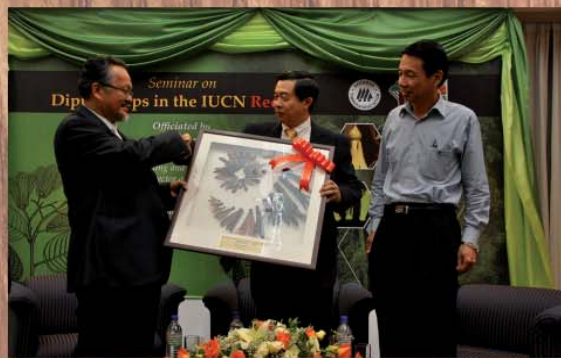
Left: Seminar on Dipterocarps in the IUCN Red List 2010 was held on 23 September 2010 at Wisma STA