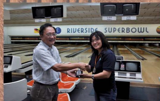
Above: Champions of the Bowling Competition held on 19 November 2010