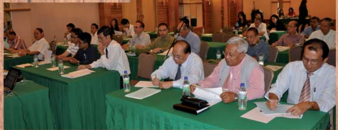
Right : Briefing by the Malaysian Timber Certification Council (MTCC) on the Requirements of the Malaysian Criteria and Indicators for Forest Management Certification (Forest Plantations) [MC&I (Forest Plantations)] organised by STA from 25 to 26 January 2010 at Wisma STA