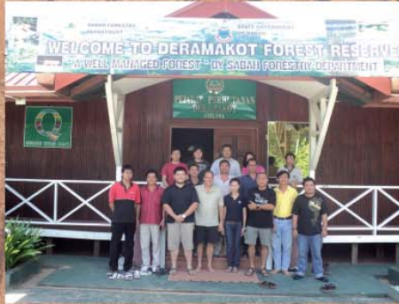
Below: Study visit by Postgraduate Diploma students to Deramakot Forest Reserve in Sandakan, Sabah from 8 to 13 August 2010