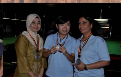
Above: Winners of the Pool and Dart Competition held on 26 November 2010