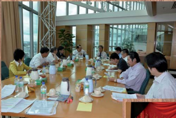
Right : The STA Panel Products Committee Meeting held on 3 February 2010 at Wisma STA