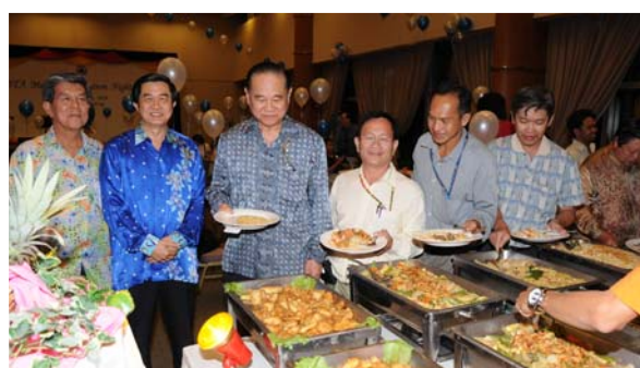
Right: STA Council Members with members of the media during the STA Media Appreciation Night on 23 May