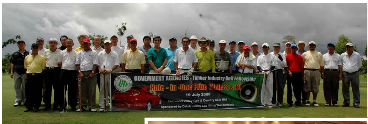
Above: Participants at the Government Agencies Timber Industry Golf Fellowship, jointly organised by STA and the Sarawak Timber Industry Development Corporation at the Eastwood Valley Golf and Country Club in Miri on 19 July