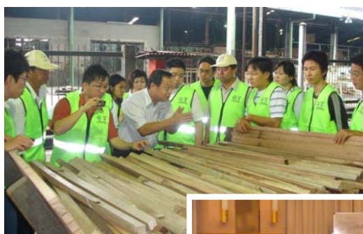
Left: Visit to one of the local mills in Kuching