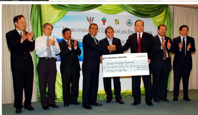
Above: Presentation of cheque to the Sarawak Forestry Corporation on 18 June for the project entitled "Viability Assessment of Indigenous Tree Species and Propagation Techniques for Planted Forest Development in Sarawak"