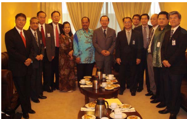
Below: Meeting of STA Office-Bearers and Certification Committee Members with Yang Berhormat Datuk Peter Chin, the Minister of Plantation Industries and Commodities on 21 August at the Parliament House, Kuala Lumpur