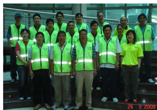
Above: Students from the second intake of the Postgraduate Diploma in Applied Science had their Orientation from 8 to 12 September