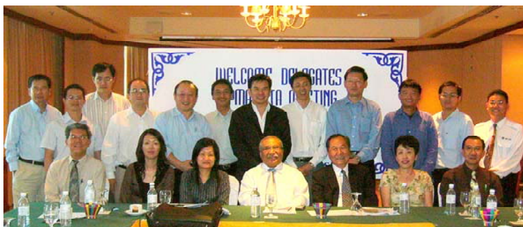
Left: The Malaysian Panel-Products Manufacturers' Association and STA had a meeting with the Sabah Plywood Manufacturers and Sabah Timber Industries Association on 12 May in Kota Kinabalu, Sabah