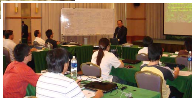
Right: Lecture in session

Mulai 26 Disember 2008, Sarawak Forestry Corporation dan Pejabat Wilayah Kuching telah berpindah ke pejabat barunya di alamat berikut. Walaubagaimanapun, alamat-alamat untuk Pejabat Wilayah di Sibul, Bintulu dan Miri tidak berubah.