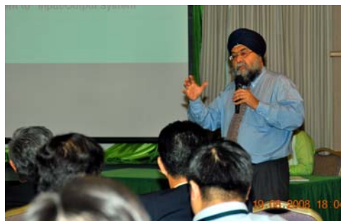
Left: Members of the STA Moulding Category met on 27 August