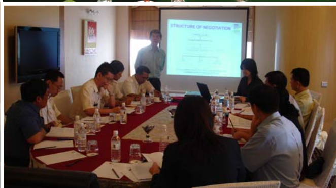
Above: Some of the Members at the briefing in Sibu