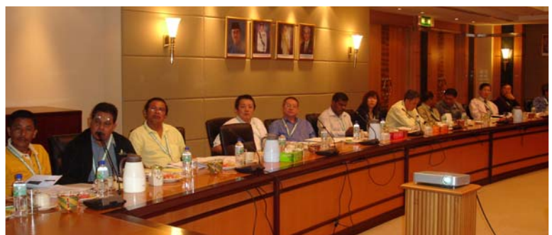
Right: Members from the Peninsular Malaysia timber industry led by the Malaysian Timber Council visited STA on 4 August