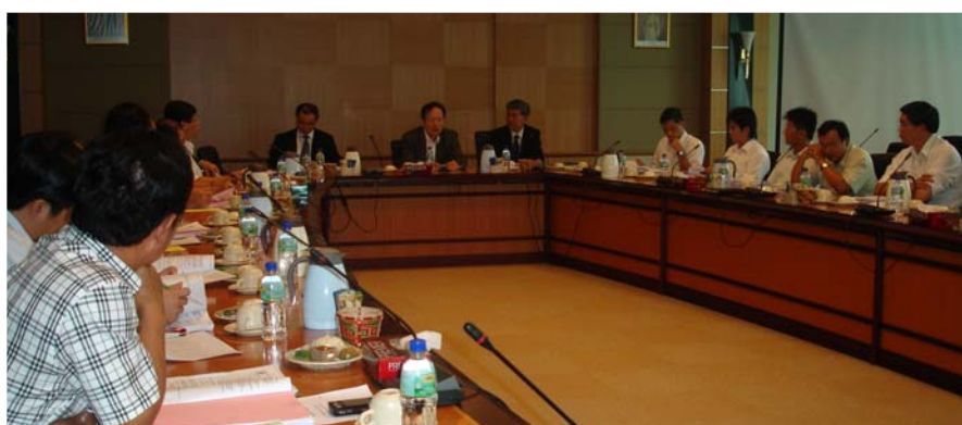
Right: The STA Certification Committee met on 7 March, 14 May, 14 November and 18 November. Some of the issues discussed were the Malaysian-EU FLEGT-VPA, forest management certification, High Conservation Value Forest, Forest Stewardship (Malaysia) Sdn Bhd and incentives for Members