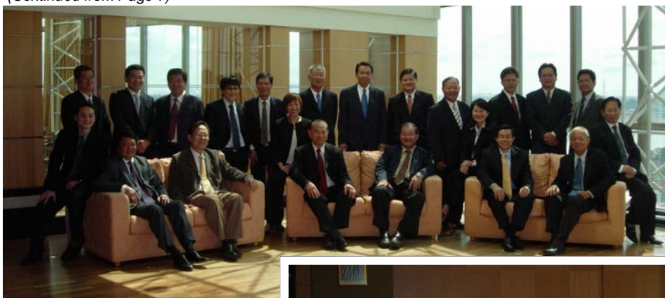
Left: The STA Council Members elected on 31 March for the years 2008 and 2009. The Council met on 1 February, 30 April, 29 August and 24 November