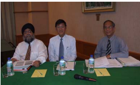
Above: The Malaysian Timber Association Executive Committee met on 30 June. The Annual General Meeting was also held on the same day