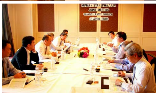
Right: The Joint Meeting between the Japan Lumber Importers' Association, the Japan Plywood Manufacturers' Association, the Malaysian Panel-Products Manufacturers' Association and STA held on 21 April in Bangkok, Thailand. They met again on 11 November in Jakarta, Indonesia