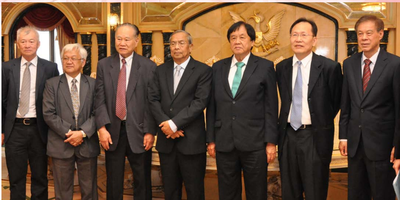
28 May, Courtesy Call to the Chief Minister of Sarawak by the Permanent Council Members of STA