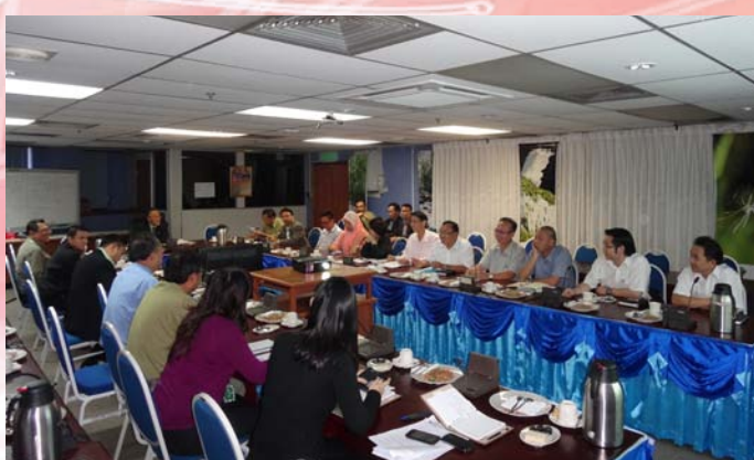
17 March, Briefing on Sustainable Forest Management and Certification in Heart of Borneo