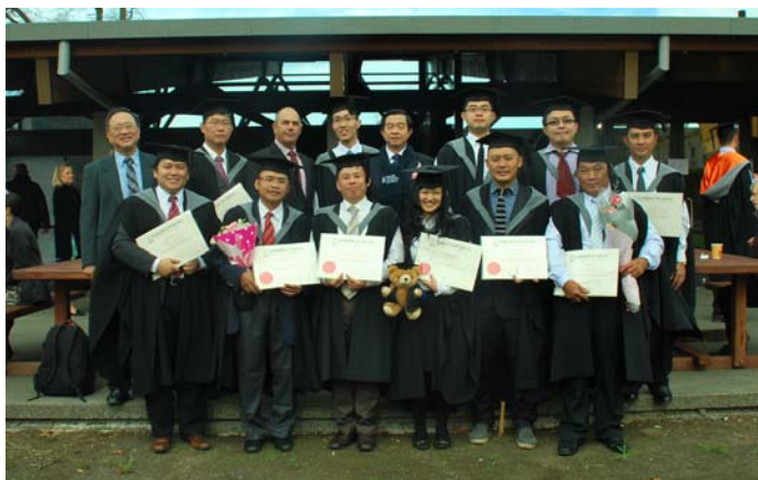
2 May, PGDip Graduation in Christchurch, New Zealand