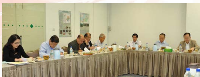
12 August, STA Board of Honorary Advisers Meeting No 2/2014