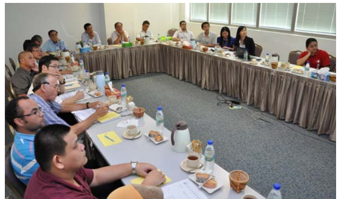
Photo: Meeting in progress

The Meeting was also informed on the progress of two research projects funded by STA i.e. Cadambatree Project by Universiti Malaysia Sarawak (UNIMAS) and the Acacia mangium study by Sarawak Forestry Corporation (SFC). The Progress Reports for both studies were circulated during the meeting for members' information. The Meeting