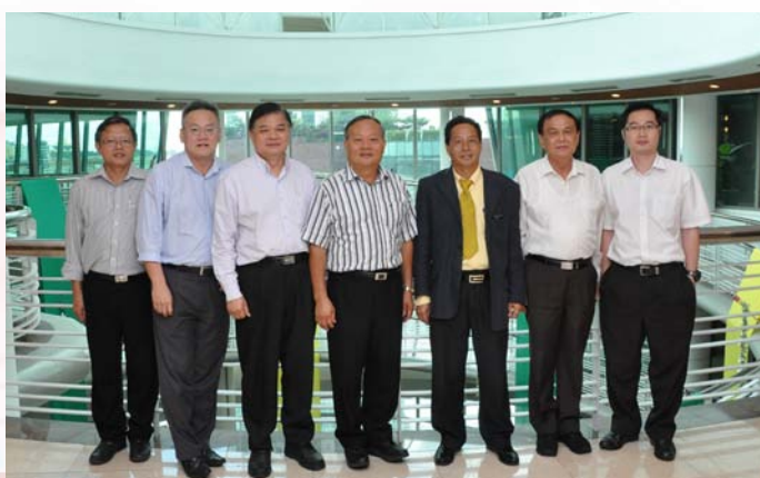
14 August, Members attending the STA Hill Logging Category and Committee Meeting