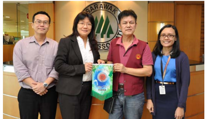
20 January, Financial Contribution to Pertubuhan Ibubapa Kanak Kanak Keperluan Istimewa Sarawak (PIBAKAT)