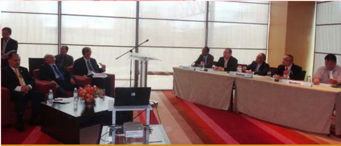
1 April, Capacity Building Workshop on Forest Watch Initiative in Sarawak