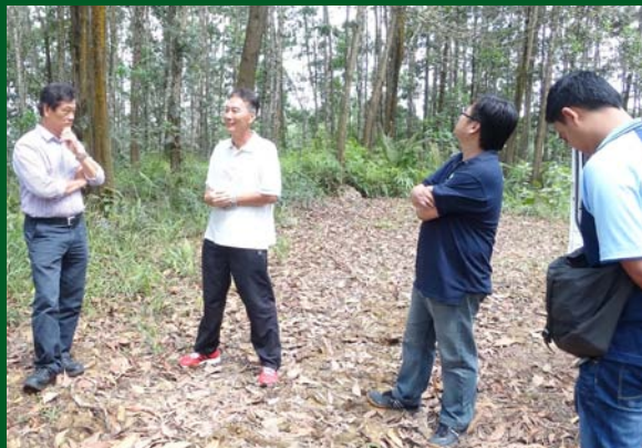
2-5 September, Visit to Members' Plantations