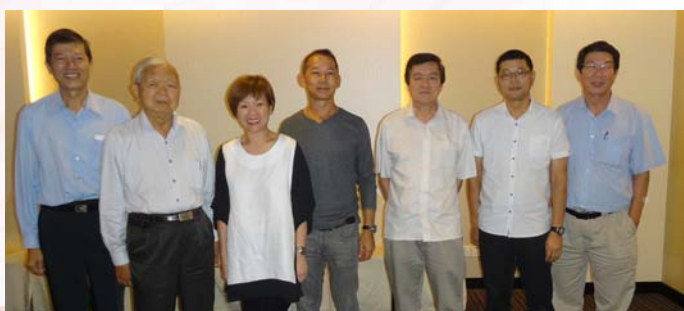
21 November, Members attending the STA Sawmilling Category Meeting