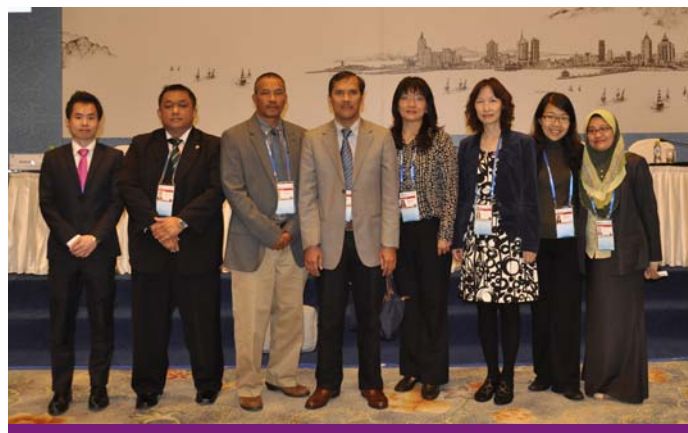
6-9 May, 5 th APEC Experts Group on Illegal Logging and Associated Trade Meeting in Qingdao, China