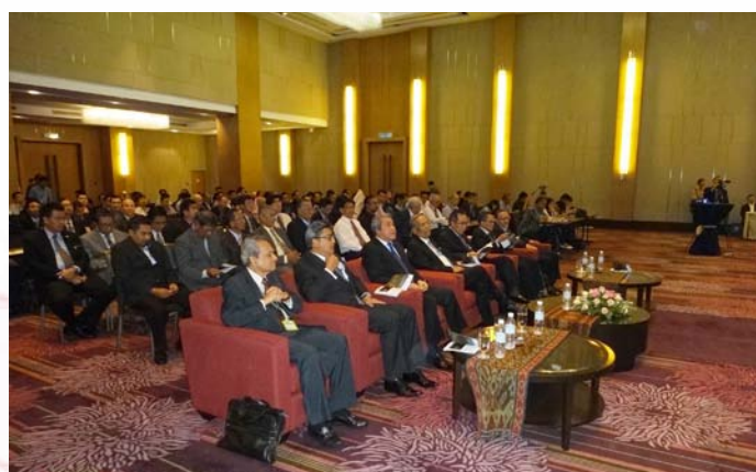
20-21 August, Seminar on Forest Management Certification