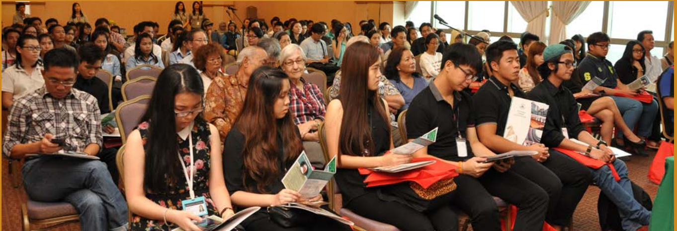
18 October, STA Tea Talk