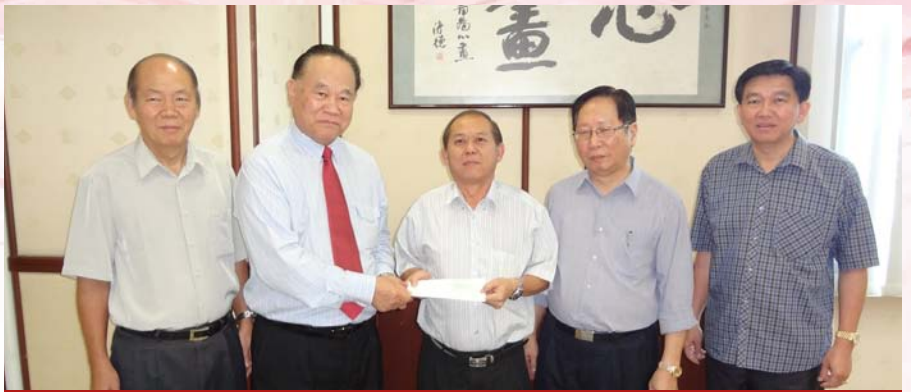
11 January, Presentation of Financial Contributions to the representative of 14 Private Chinese Schools, Sibü