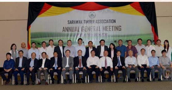
28 March, Group photo of Council members for year 2014-2015