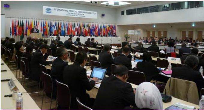
3-8 November, 50 th Session of the International Tropical Timber Council, Yokohama, Japan