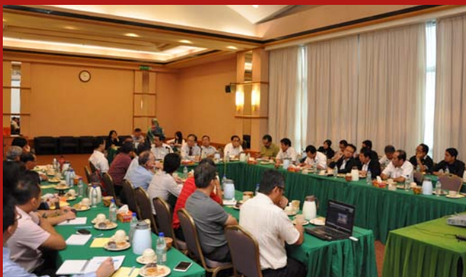
22 January, Dialogue between STA Forest Plantation Members and Harwood Timber Sdn Bhd