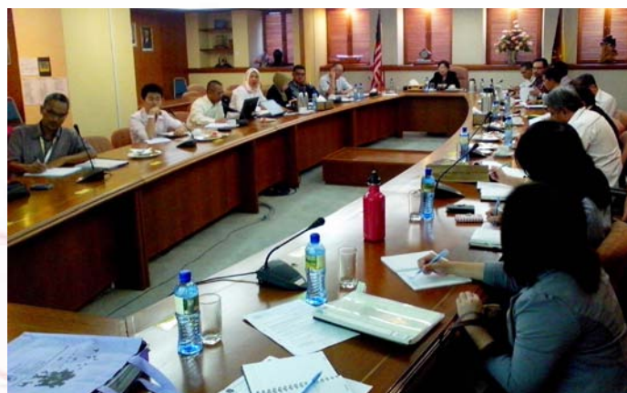
29 May, Inter-Agency Committee Meeting