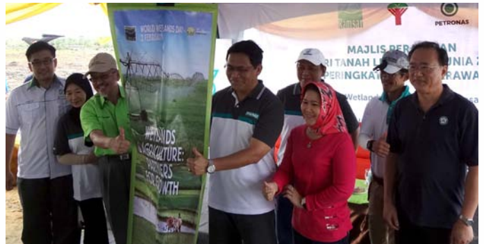
22 February, World Wetlands Day 2014 at Kuching Wetlands National Park