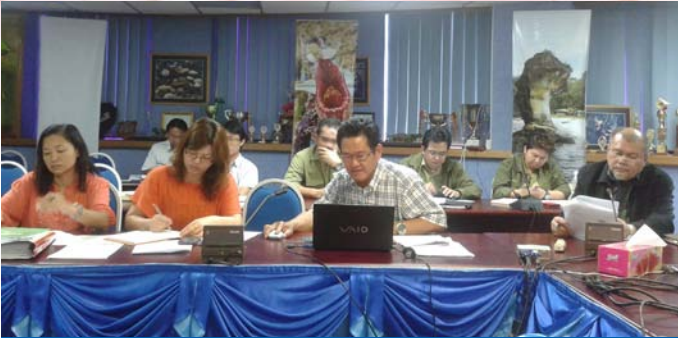
5 February, ASDU IRCM MoU Stakeholders Meeting