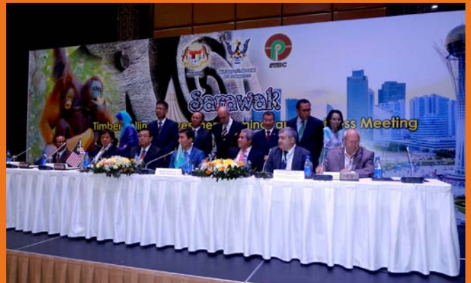
9-15 June, Sarawak Timber Selling and Investment Mission to Kazakhstan