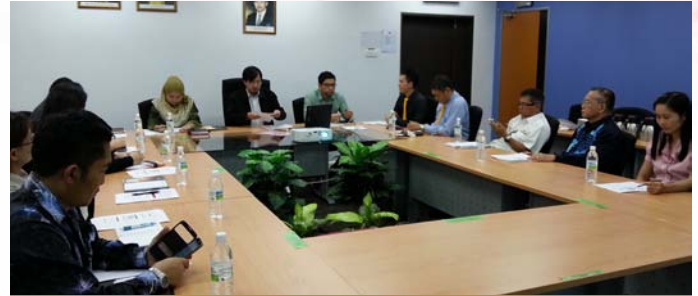
17 April, Asean Economic Community Briefing