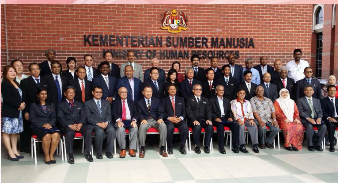
24 July, National Labour Advisory Council No 1/2014 Meeting