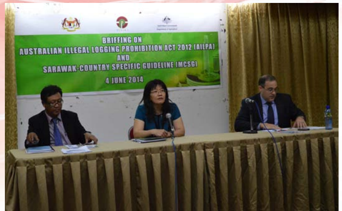
4 June, Sarawak Country Specific Guideline Briefing