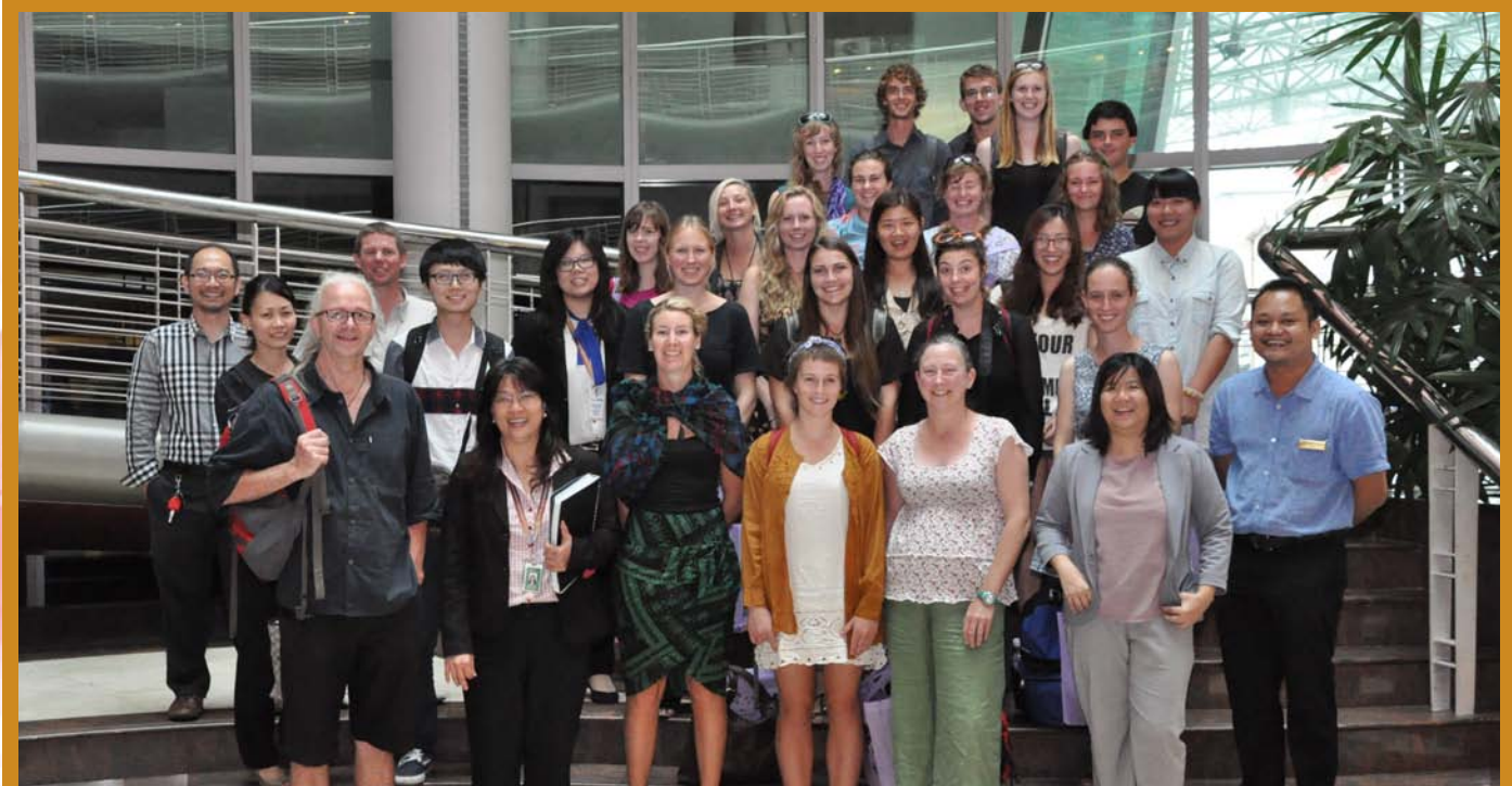
25 April, Lincoln University Landscape Architecture Student Visit