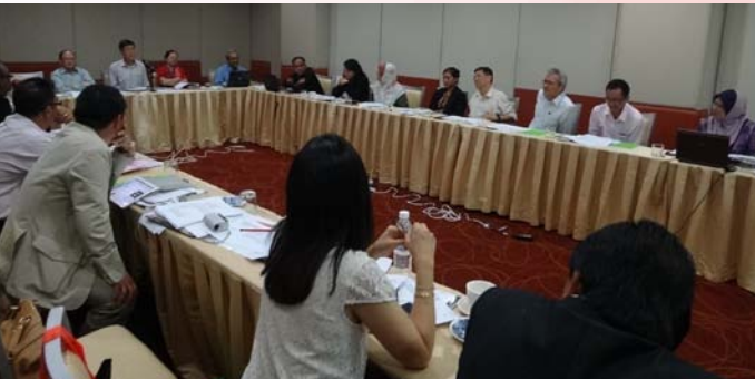
12-13 February, SRC for the Review of MC&I (Forest Plantation)