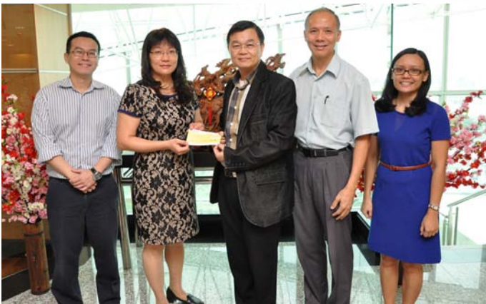
21 January, Financial Contribution to Yayasan LaSallian Kuching