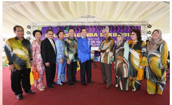
24 January, Cheque Presentation to DBKU