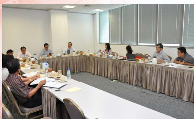
21 March, STA Forest Plantation Committee Meeting No 1/2014