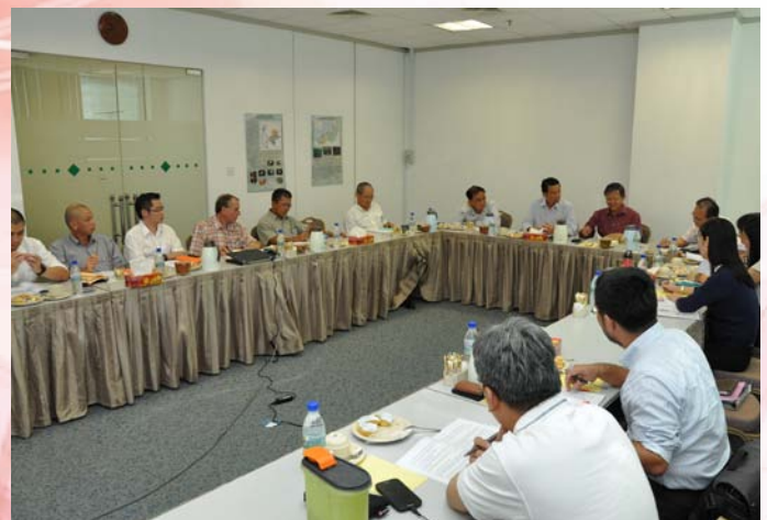
22 July, STA Forest Plantation Committee Meeting No 3/2014