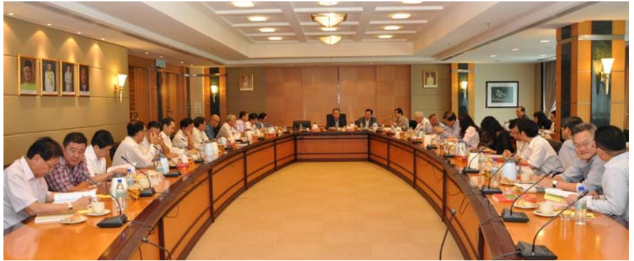
Photo: Meeting in progress