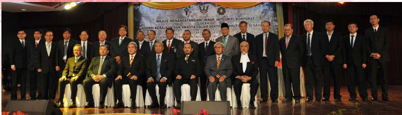
17 November, Corporate Integrity Pledge Signing Ceremony at DUN Sarawak