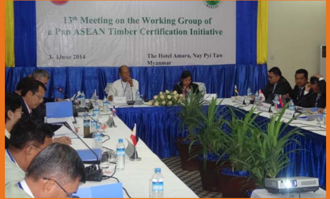
3-4 June, 13 th Meeting of the Working Group of a Pan ASEAN Timber Certification Initiative