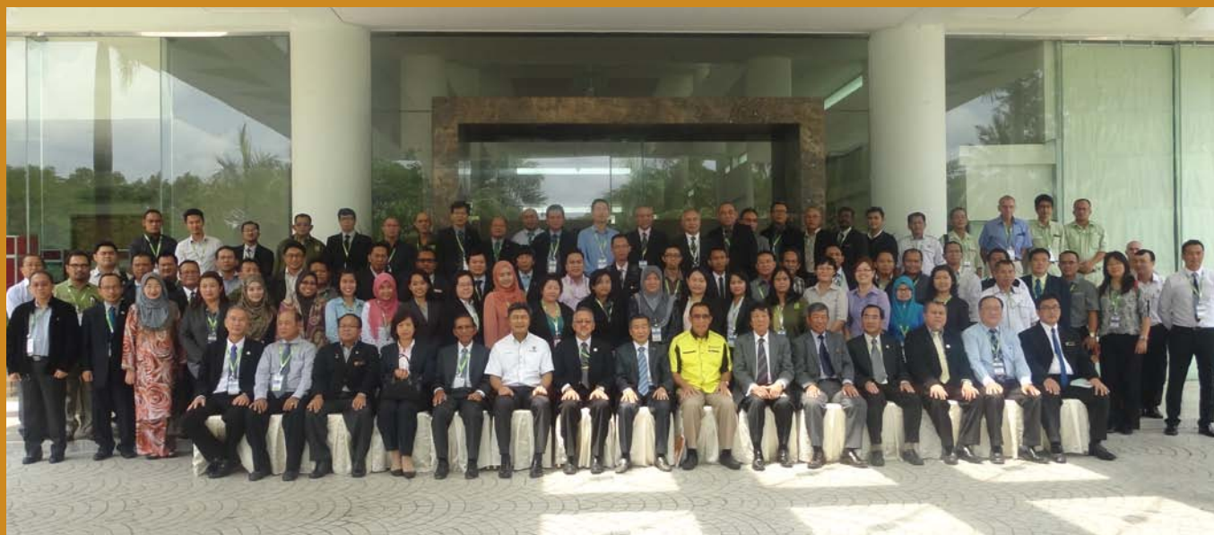
13-15 October, Regional Conference on Planted Forests