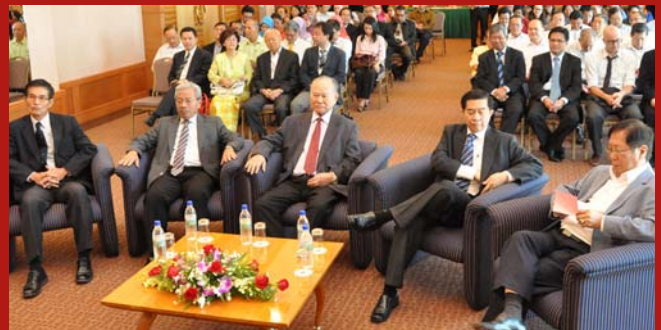
1 July, Financial Contribution for Education, Research, Scholarships and Signing of Memorandum of Understanding