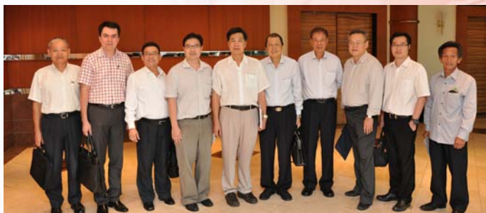
17 November, Members attending the STA Log Marketing Category Meeting