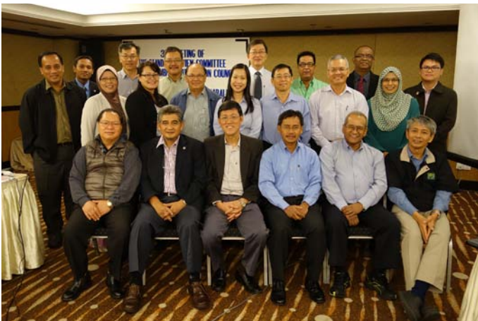
7-9 July, 3 rd Standard Review Committee Meeting in Kota Kinabalu