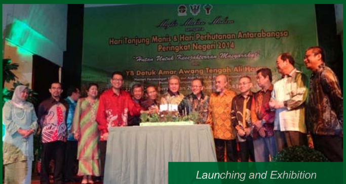
Launching and Exhibition