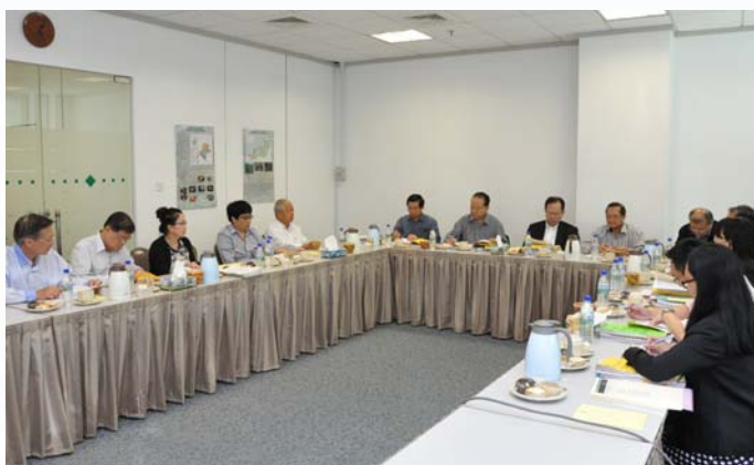
11 March, STA Board of Honorary Advisers Meeting No 1/2014