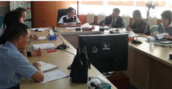
19 February, Meeting with NREB