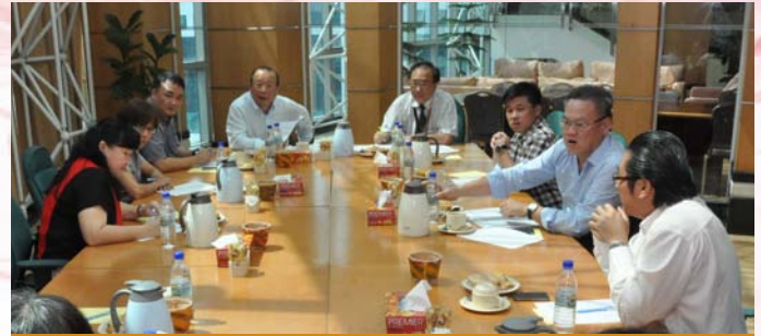
14 April, STA Panel Products Category and Committee Meeting