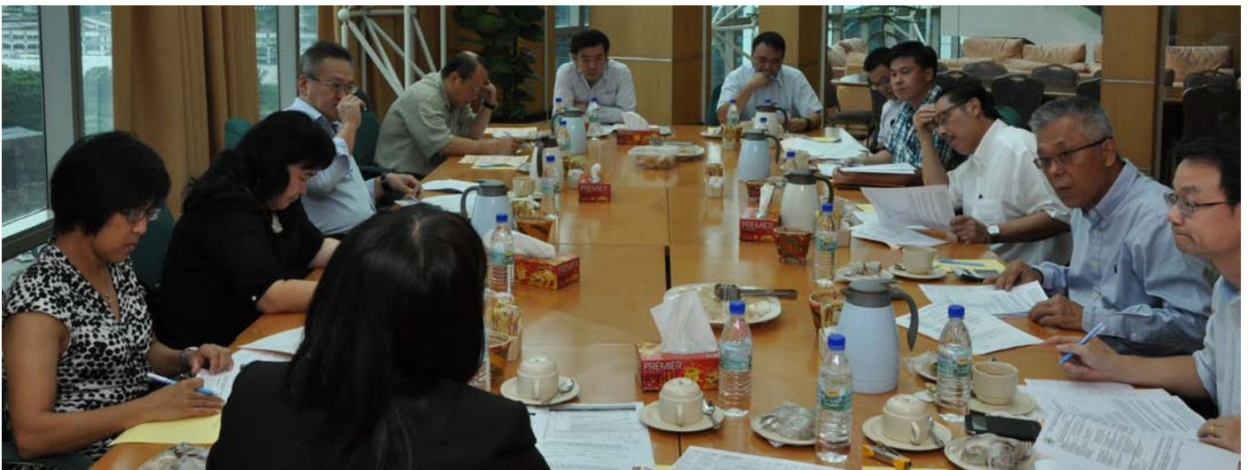
22 October, STA Panel Products Committee Meeting No 2/2014