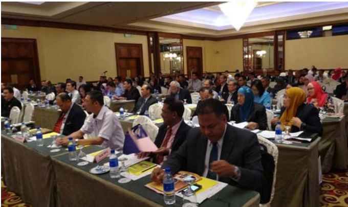
10-11 January, Workshop on 11 th Malaysia Plan, KL