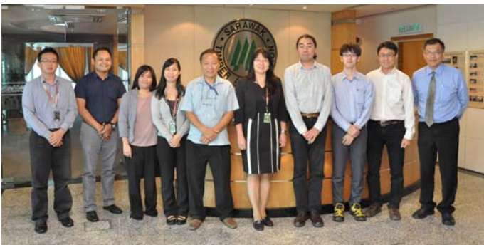
29 April, Visit by WWF Japan and Malaysia