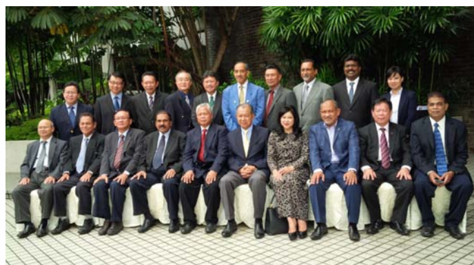
13 August, Malaysian Employers Federation Annual General Meeting