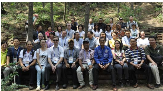
4-9 August, 6 th Meeting of the APEC Experts Group on Illegal Logging and Associated Trade, Beijing, China