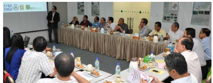
Photo: Briefing in progress