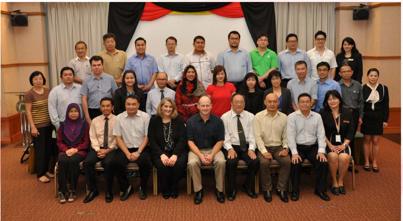
13 November, International Wood Products Association Briefing to STA Members