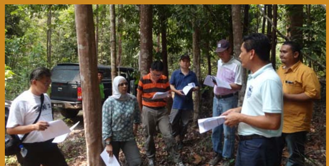
29-31 October, 4 th Standard Review Committee Meeting