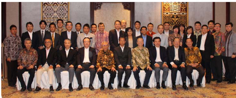
19 September, 17 th Tri-Nations Meeting of JLIA / JPMA / APKINDO / STA / MPMA, Jakarta, Indonesia