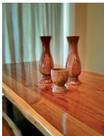
Craft and Furniture made from planted Acacia mangium