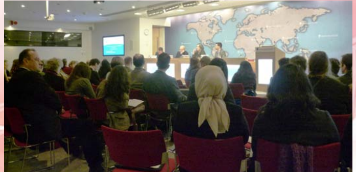
6-7 February, Chatham House Update, London, England