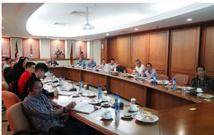
9 May, Briefing by MATRADE on Doing Business in Kazakhstan