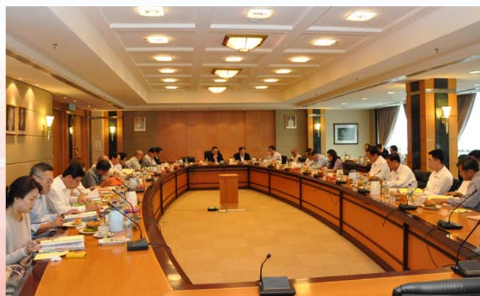
12 March, STA Council Meeting No 1/2014