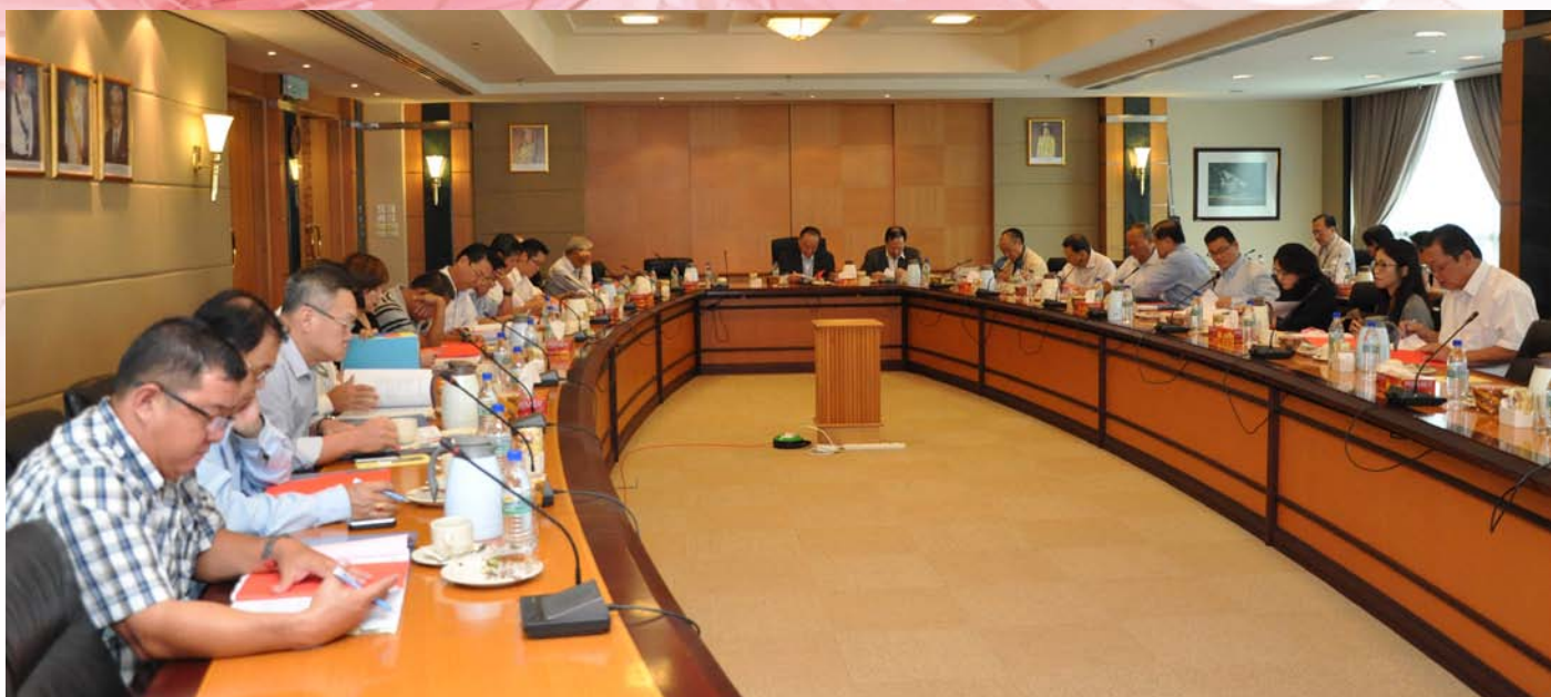
15 August, STA Council Meeting No 3/2014