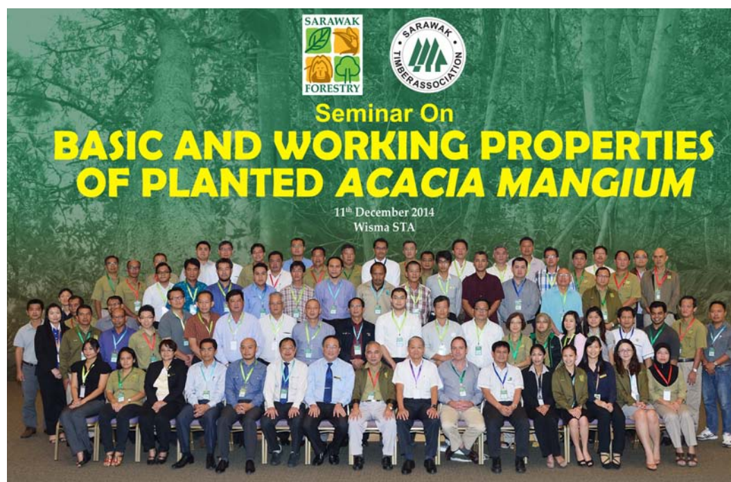
Photo: Participants of the Seminar

He also mentioned that the planted forest project places much emphasis on the planting of A. mangium to ensure