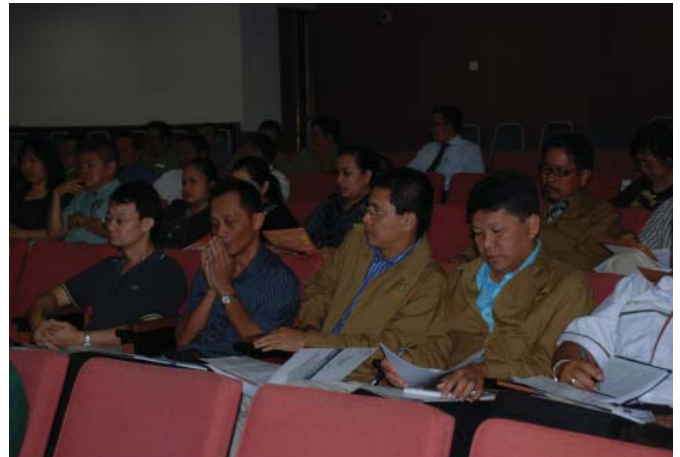
Photo: Briefing in progress

The speaker presented the guidelines on procedures for application of import permit for logs and timber products and the issue of phytosanitary certificates.