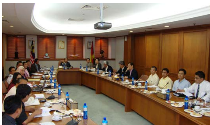
Left : Meeting in progress

该会议在详细商讨和合作的理念下决定一项临时措施，即所有受影响的本会会员可在现有的停泊处负载木桐。