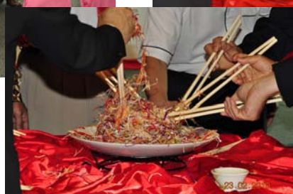
Above and Left : A symbolic tossing of 'Yee Sang' performed by STA and invited guests