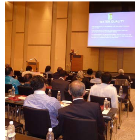
Above : Roundtable Discussion in progress

They shared their experiences on the issues of water resources/supply in their respective areas and how logging and plantation activities affect the water quality.