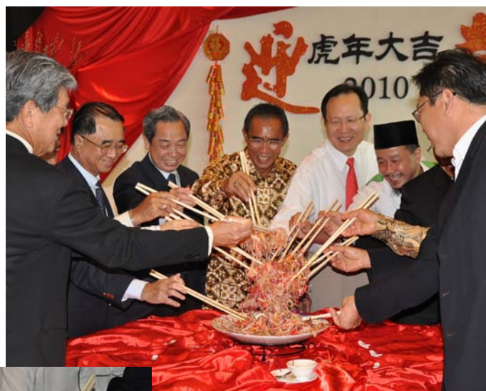
Above : Welcoming address by the Chief Executive Officer of STA followed by tossing of 'Yee Sang'