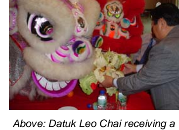
flowered cabbage from the lions as a sign of good fortune for the new year

Around 300 guests from the various government agencies and the attended private sector this gathering. They were entertained by a lion dance and music performance by a Chinese traditional orchestra.