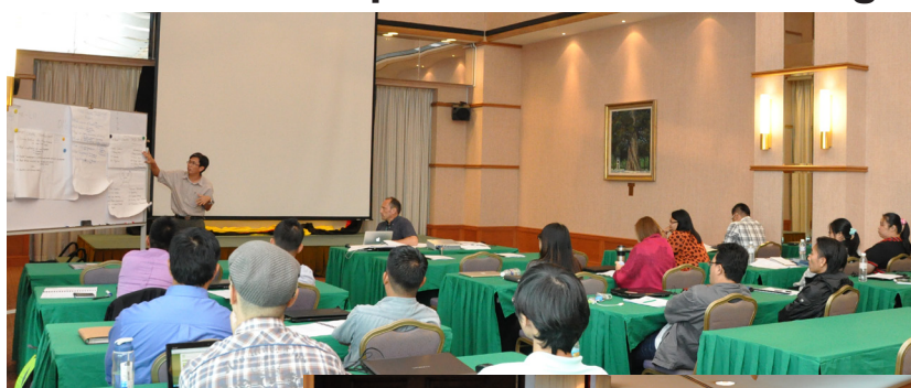
Photo: (Top) Orientation in class and students visiting STA Exhibition Centre