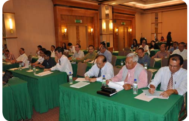
Right : Participants at the briefing

During these two days, participants were brought through the 10 Principles, 55 Criteria and 106 Indicators in the MC&I (Forest Plantations).