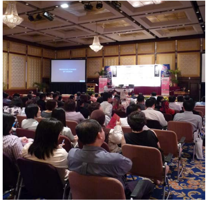
Above : Symposium in progress at PWTC