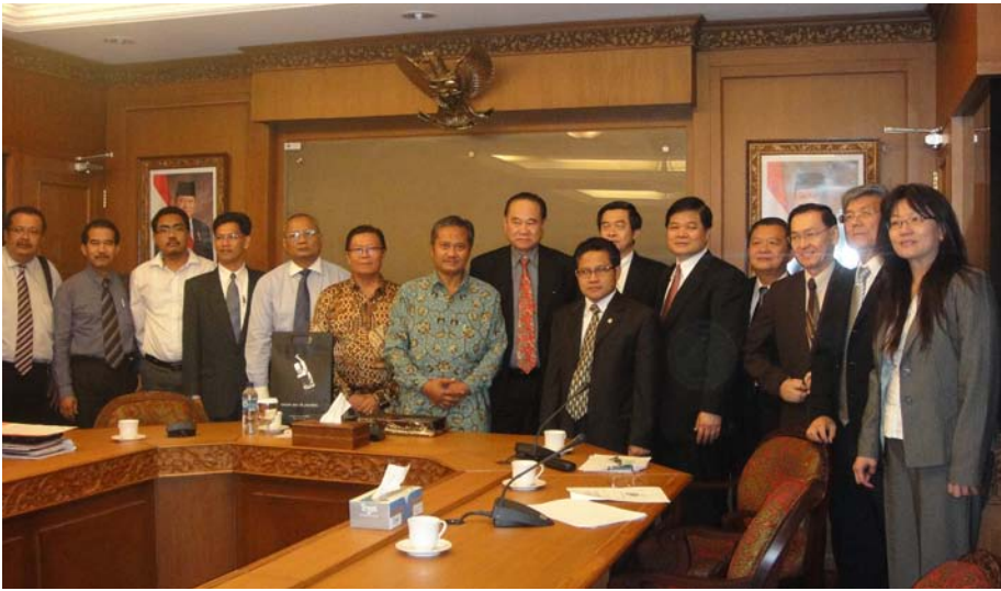
Left: Group photo of the delegation with the Minister (ninth from left)

The Chairman of the Sarawak Timber Association (STA), Datuk Wong Kie Yik, led a delegation of eight to meet Yang Terhormat Bapak Muhaimin Iskandar, the Minister of Transmigration and Manpower of the Republic of Indonesia on 20 January 2010 in Jakarta.