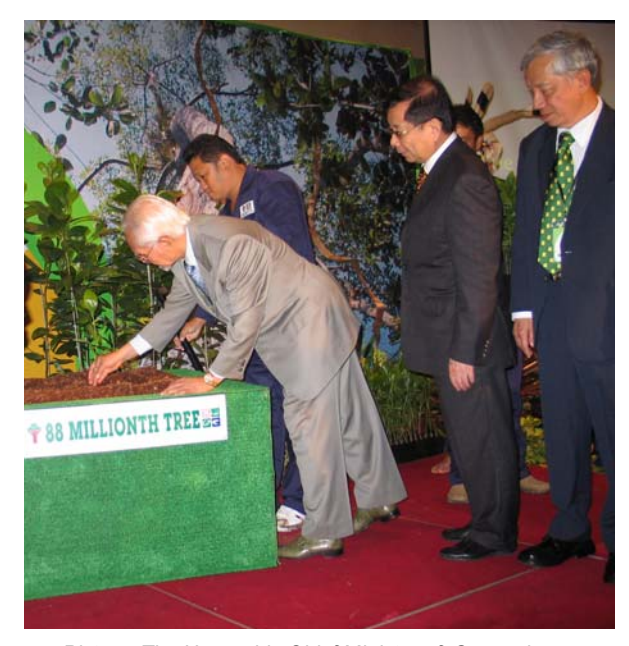
Picture: The Honorable Chief Minister of Sarawak planting the 88 millionth tree

The book on "People of the Planted Forest" presents pertinent information about the Planted Forest Zone (PFZ), and offers readers a look at the people living therein. The book also presents information on plantation of Acacia mangium in the PFZ, Community Development Programmes (CDP) within the PFZ