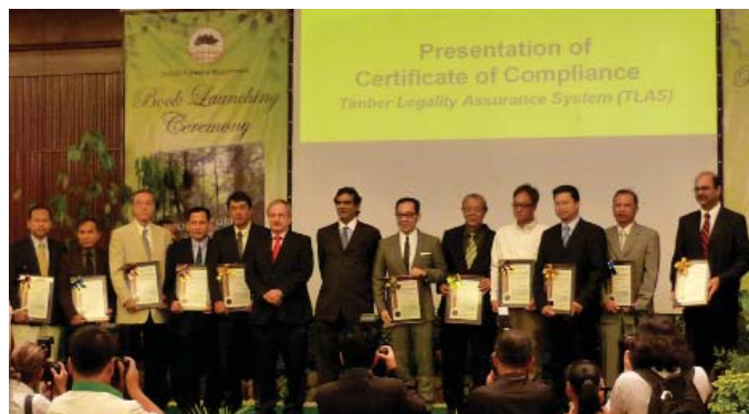
Photo: Thirteen (13) successful Sustainable Forest Management License Agreement (SFMLA) holders

In conjunction with the book launching ceremony, the SFD presented Compliance Certificates to thirteen (13) successful Sustainable Forest Management License Agreement (SFMLA) holders, for having fully complied with the critical criteria and passed the Malaysian Timber Legality Assurance System (TLAS).