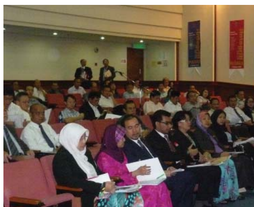
Photo: Briefing in progress

砂拉越木材工业发展机构(STIDC)于2011年7月12日举办常年木材工业进展讲座会。这主要是告知和汇报有关木材工业所面对的课题。