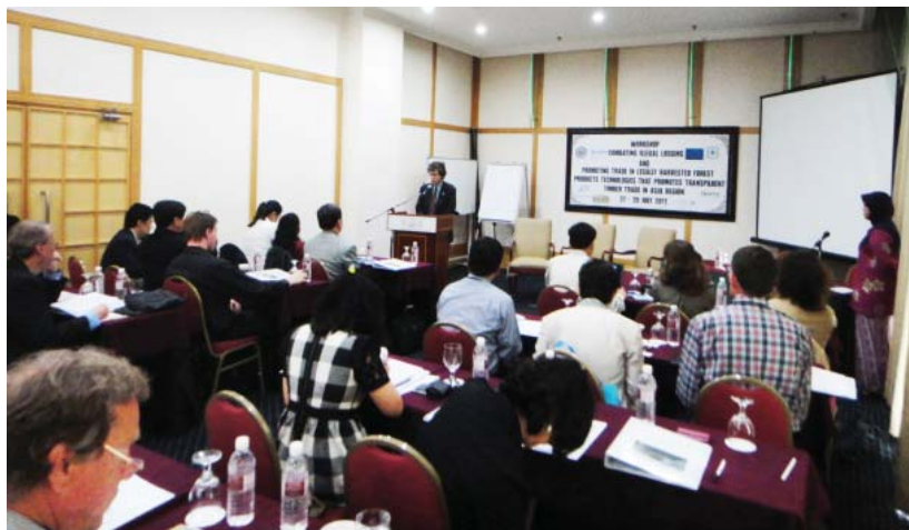
Photo: Participants at the Workshop

The Combating Illegal Logging and Promoting Legal Trade in Legally Harvested Forest Products: Workshop on Technology that Promotes Transparent Timber Trade in Asia Region was held from 27 to 29 July 2011 in Kuala Lumpur. The Workshop was hosted by Forest Department Peninsular Malaysia, Ministry of Environment and Natural Resources and organised by TRAFFIC, in partnership with Forest Research Institute Malaysia and the Nature Conservancy, RAFT with the funding support from the US Forest Service and USAID. The Workshop was attended by forest product suppliers and traders, private sectors, Government officers, donors, NGOs and researchers.