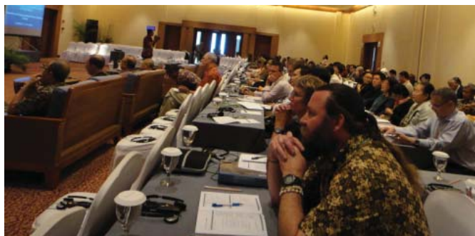
Photo: Participants at the Conference

The International Conference on Forest Tenure, Governance and Enterprise: Experiences and Opportunities for Asia in a Changing Context was held at the Santosa Villas and Resort, Lombok, Indonesia. The conference was organised by the Ministry of Forestry of Indonesia, the International Tropical Timber Organization (ITTO) and the Rights and Resources Initiative (RRI), with the support of twenty (20) other organisations.