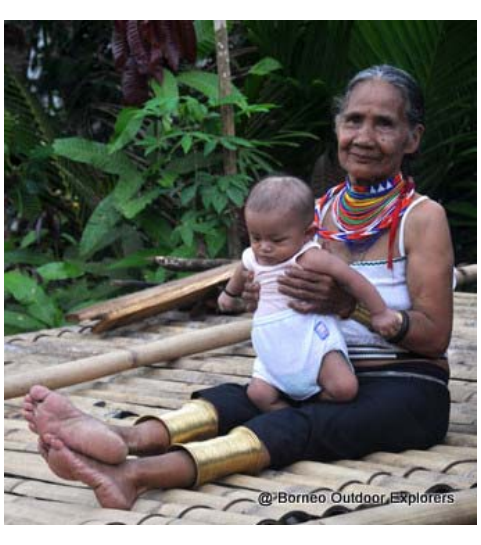
One of the ladies at Kampung Semban who wear brass rings around their ankles and wrists

interesting natural locations in and around Kuching that are rarely known even to locals.