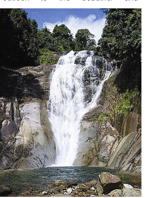
View of the highest waterfall in Southern Sarawak, Jangkar Waterfall

Mr. Bryan and Mr. David being avid nature lovers, share a common interest in outdoor activities such as hiking, camping and discovering hidden attractions (i.e. waterfalls and villages) in rural areas. They have an appreciation for the nature and believe in the preservation of local cultures. Thus, this talk provided an outlook to the beautiful