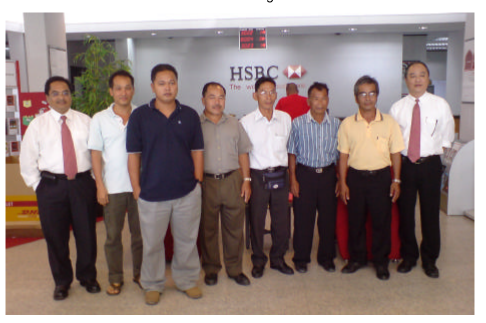
Picture: Community representatives at the opening of an AMC account at an international bank

The pickup truck will complete its chain-of-custody to the Anap Muput Community at Bukit Kana in August 2008.