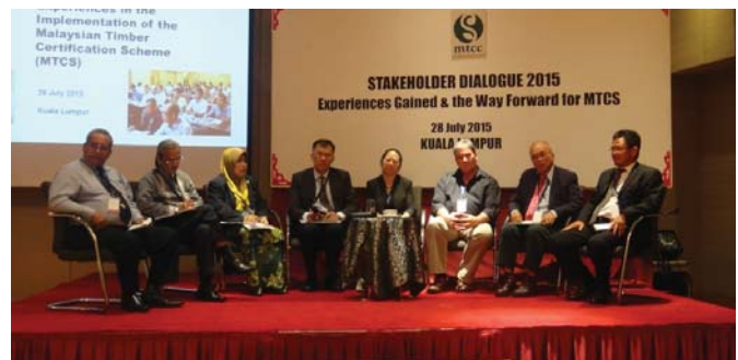
Photo: Panelists representing the various stakeholder interests