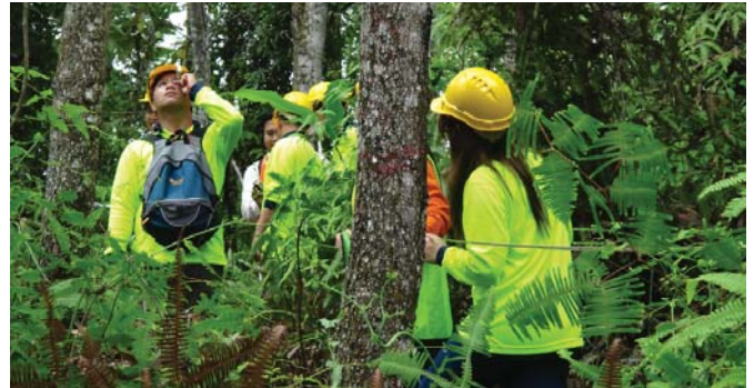
Photo: Student trying out the clinometer to measure angles and the height of tree during the inventory plot exercise assigned

Students and participants of the Course had the opportunity to measure a tree's height and diameter at breast height (DBH) in an assigned plantation plot. This exercise was done in a twelve-year old A. mangium permanent sample plot (PSP) which required them to work out the height of the tree assigned to them using trygonometry.