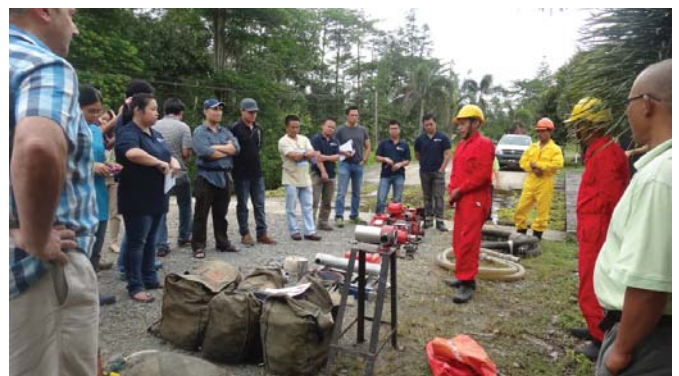
Photo: Demonstration on fire protection by the Fire Protection Team

A demonstration on fire fighting was also given by the Fire Protection Team from Grand Perfect Sdn Bhd where students and participants of the Course were taught how to use the equipment, standard gesture in operation as well as technique in fire fighting.