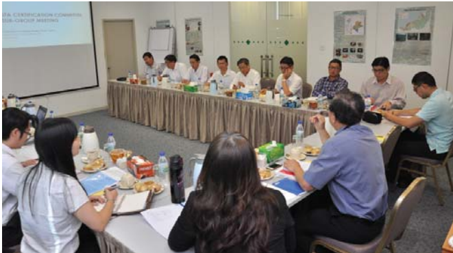
Photo: Meeting in progress

The STA Certification Committee Sub-Group Meeting No 1/2015 was held on 22 July 2015 at Wisma STA, Kuching. The Meeting was attended by representatives from member companies whose Chief Executive Officers and Managing Directors had signed the Corporate Integrity Pledge (CIP) on 17 November 2014 at the Sarawak Legislative Assembly Complex, Kuching.