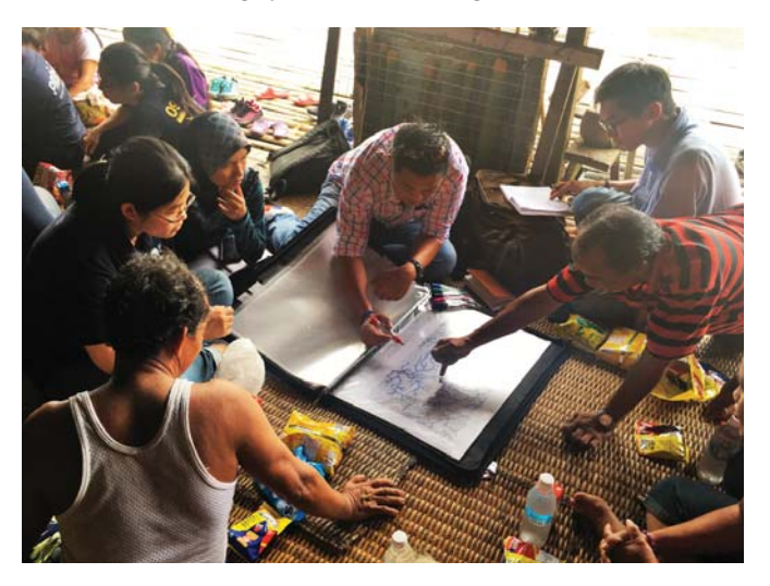
Photo: Interview session with the villagers in Kampung Simuti. Also SysPad is seen to be used during the session

Subjek "Komuniti dan Industri Hutan" untuk Kohort Ke-4 Kursus Diploma Lepasan Ijazah dalam Sains Gunaan (Pengurusan Mampan Hutan Tropika/ Pengurusan Mampan Hutan Ladang Tropika) telah dijalankan dari 16 hingga 22 Julai 2016 di Wisma STA, Kuching. Kursus ini telah dihadiri oleh 16 pelajar pasca siswazah dan 3 peserta yang mengikuti subjek ini secara pembelajaran sepanjang hayat iaitu mengambil subjek tunggal sahaja.