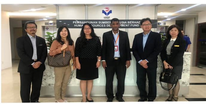
Group photo with interim Chairman (4th from left)

Meeting took note HRDF's strategic initiatives map with the vision of "Every Malaysian employees trained". Representatives from timber associations highlighted that there will be differences in the training needs within the timber industry and requested for a proper study to be conducted to identify correct training needs for the timber industry based on the three (3) regions in Malaysia, i.e. Peninsular Malaysia, Sabah and Sarawak.