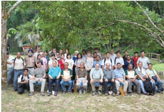
Photo: The field visit

Majlis Pensijilan Kayu Malaysia (MTCC) dan Majlis untuk Program Pengesahan Skim Pensijilan Hutan (PEFC) mengajurkan bersama-sama dialog pemegang saham di Hotel Corus, Kuala Lumpur pada 16 – 18 Jun 2010 yang memberikan tumpuan pada pembangunan inisiatif-inisiatif pensijilan hutan di rantau Asia Pasifik dan semakan syarat-syarat PEFC untuk sistem pensijilan hutan.