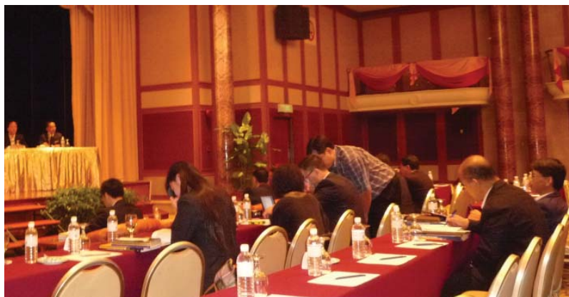
Photo: Briefing in progress

In 2009, a total of 100 Malaysian companies participated in the 6 th CAEXPO under the industry clusters such as Food and Beverages, General Products by Small and Medium Enterprises (SMEs), Malaysia Brands and Government Agencies. Malaysia's participation in the expo recorded a total sale of RM204.5 million.