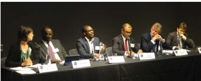
Photo: Panel Members for the discussion on the Next Steps for FLEGT

The 26 th Illegal Logging Update and Stakeholder Consultation Meeting was held from 16 to 17 June 2016 at the Crystal, Royal Victoria Docks, London. The Meeting addressed a range of issues focused on the discussions towards the trading of legal timber, including the interactions between Forest Law Enforcement, Governance and Trade (FLEGT), sustainable development and climate change. It was attended by about 200 participants from civil society, industry and governments globally.