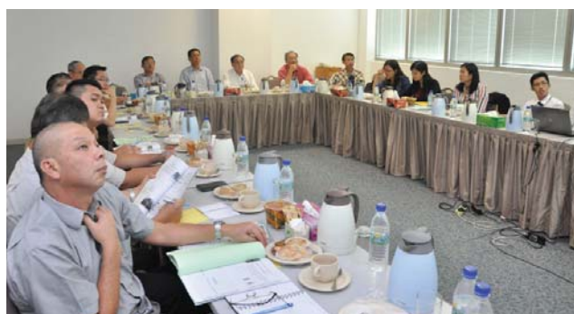
Photo: Meeting in progress

The Meeting invited the researchers from Swinburne University of Technology Sarawak Campus (SUTS) and Universiti Malaysia Sarawak (UNIMAS) to brief the members on the progress of the STA funded R&D Projects. The two (2) papers presented are: