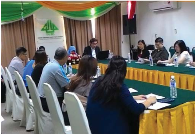
Photo: Meeting in progress

A meeting was organised by the Malaysian Employers Federation (MEF) on 15 June 2016 at Dewan Usahawan Bumiputera Sarawak in Kuching. Approximately twenty four (24) participants attended the Meeting.