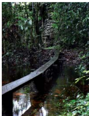
Plank walk, Bukit Sarang, Bintulu