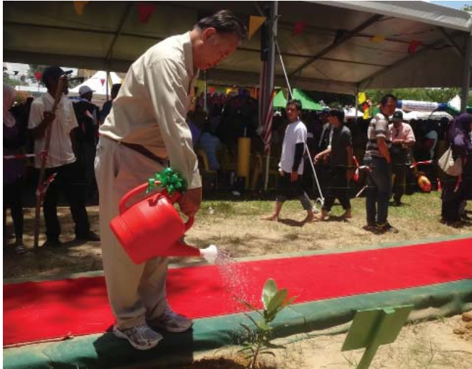
Photo: Pemanca Datuk Wong Kie Yik planted a tree on behalf of STA during the tree planting ceremony