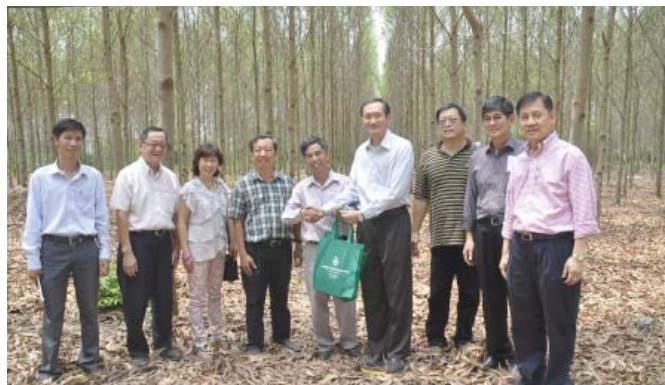
Photo: Visit to the Planted Forest Station of the Forest Science Institute of South Vietnam