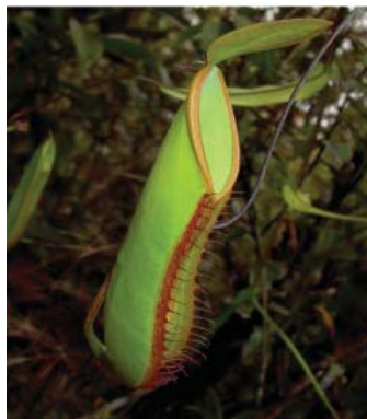
Nepenthes tentaculata Habitat: Mossy montane forests