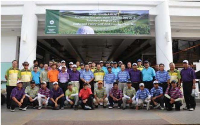
Photo: Golf Tournament in Miri