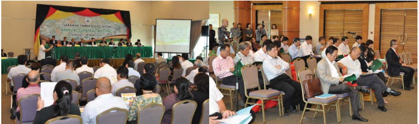
Photo: Annual General Meeting in progress