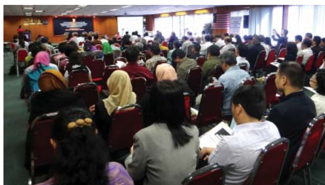
Photo: Consultation in progress