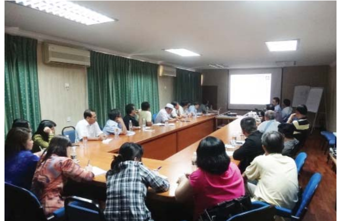
Photo: Briefing in progress