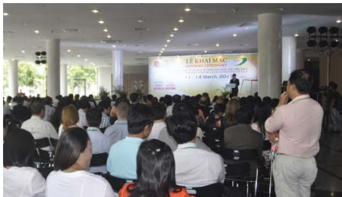
Photo: VIFA 2013 Opening Ceremony