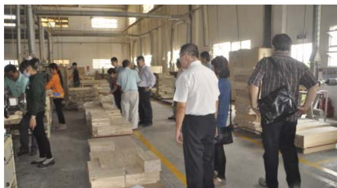
Photo: Visit to Furniture Mill of RK Resources