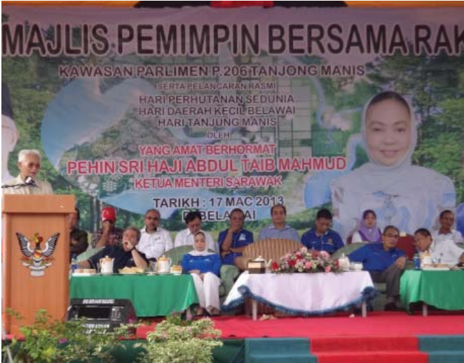
Photo: Launching of World Forestry Day, Tanjung Manis Day and Belawai Day