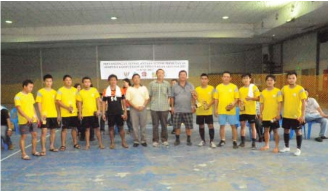
Photo: STA Futsal team was represented by the staff members from WTK group of companies