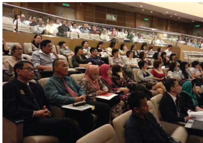
Photo: Briefing in progress