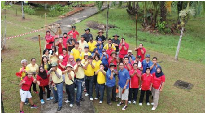
Photo: Blowpipe Tournament in Kuching