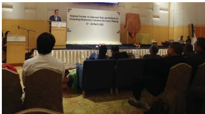
Photo: Seminar in progress

Forest Research Institute Malaysia (FRIM), United Nations Development Programme-Global Environment Facility (UNDP-GEF) and International Tropical Timber Organization (ITTO) hosted the Regional Seminar on Improved Tools and Methods for Integrating Biodiversity Conservation into Forest Planning on 27 and 28 March 2012 in Kuala Lumpur. The CBioD Project is a five (5) year project that aims at producing an improved tool set that will assist forest managers to include biodiversity concerns while planning forestry activities.