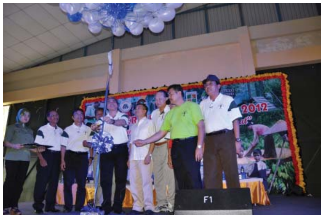
Photo: Launching of the World Forestry Day 2012