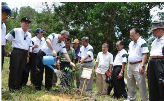
Tree planting ceremony