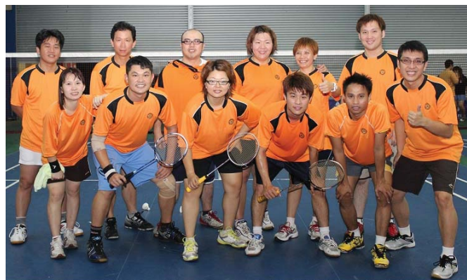
Photo: Badminton Tournament, 10 and 11 March 2012, Sib - organised by the Harwood Timber Sdn Bhd (HTSB)