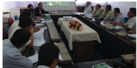
Photo: Briefing in Bintulu

The planting progress, target as well as issues pertaining to LPF were reported by each licensee during the meetings. Among the issues and challenges encountered in planting reported by LPF holders are land issues i.e. NCR claim; labour issues i.e. shortage of workers, shortage of machineries; lack of financial support and assistance; land rent issues i.e. redundant charges for land rent; R&D related issues i.e. tree improvement programme, establishment of Seed Production Area; and pest and disease control.