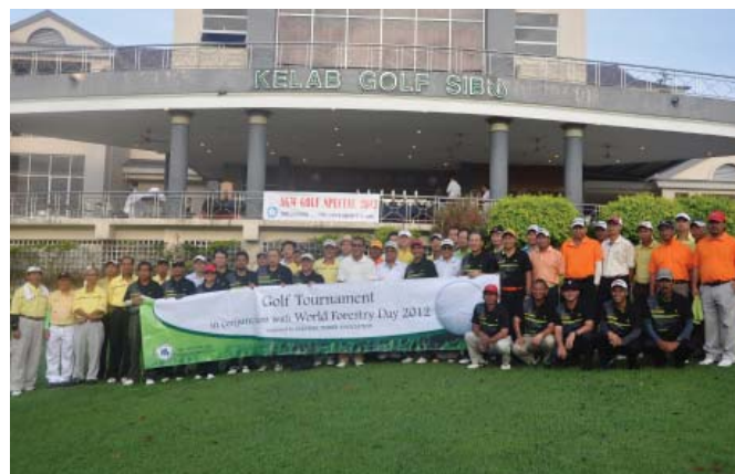
Photo: Golf Tournament, 20 March 2012, Sib - organised by the Sarawak Timber Association (STA)