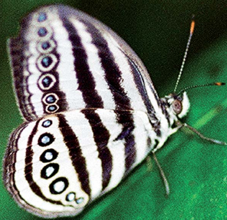
Ragadia makuta umbrata (The Striped Ringlet)

This species inhabits those sections of forests where there is little undergrowth. It flutters close to the ground and can be seen throughout the year.