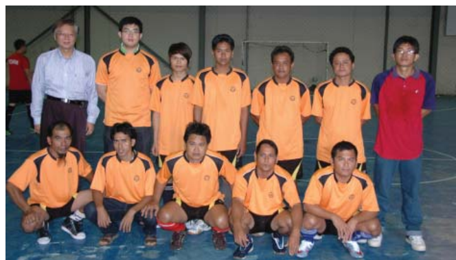
Photo: Futsal Tournament, 18 March 2012, Sib - organised by the Forest Department Sarawak (FDS)