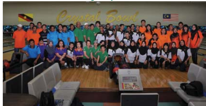
Photo: Bowling Tournament, 10 March 2012, Kuching - organised by the Sarawak Timber Industry Development Corporation (STIDC)