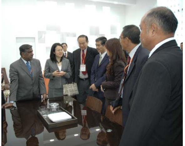
One of the Malaysian booths, HiNLiM, at the fair