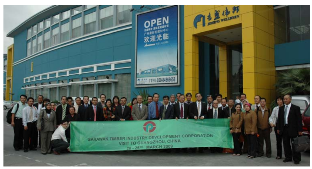
The Sarawak delegation's visit to Sunlink Furniture City, Shunde District