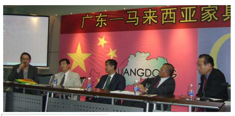
Meeting with the Guangzhou Furniture ` Association representatives

A dinner was hosted by STA for the delegation of the trip on 21 March 2009.