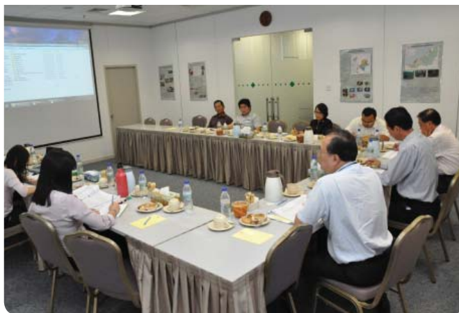
Photo: Meeting in Progress