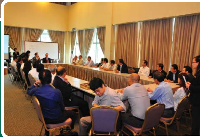
Photo: Council Meeting in Progress

The STA Council Meeting No 2/2014 was held immediately after the STA Annual General Meeting (AGM) on 28 March 2014 at Wisma STA, Kuching.