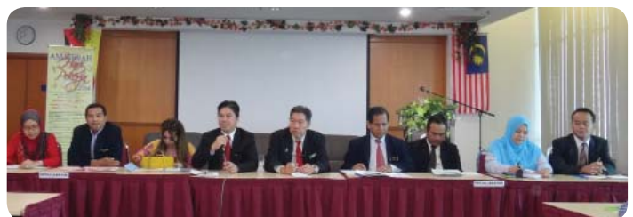
Photo: SOCSO State Director (4 th from Left) during the Q&A Session