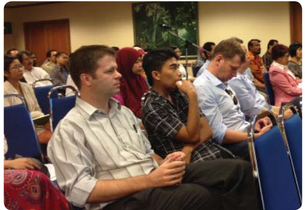
Photo: Participants at the Talk

CLT is fabricated using small sections of timber bonded together with permanent adhesives. Imperfections in the original timber, such as knots, are removed in the factory to reduce variability and enhance structural performance. CLT differs from glulam in that it is formed into panels rather than beams, hence the layers of timber (lamellas) are bonded perpendicularly to one another, resulting in structural strength across two dimensions, and improving structural integrity and dimensional stability. As an engineered timber product, with the cross-grain movement controlled by the cross-lamination, it is broadly dimensionally stable and shrinks less than standard solid timber construction. Its low weight means that a high degree of offsite manufacture is possible. Relatively large pre-manufactured panels can be transported to site for fast on-site, factory-quality construction. Offsite manufacture and speed of construction can reduce costs significantly.