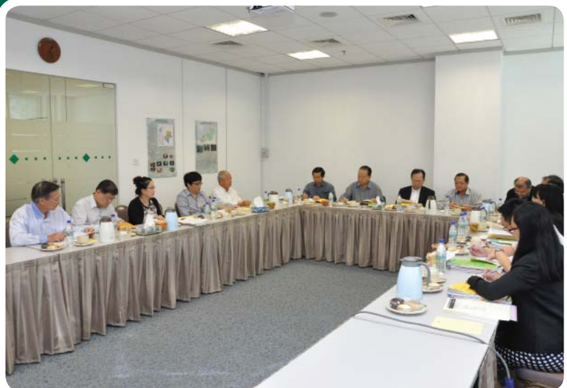
Photo: The Board of Honorary Advisers Meeting is in Progress

STA Mutual有限公司董事会名誉顾问（BHA）于2014年3月11日假古晋STA大厦召开本年度首次会议。会议通过推荐以下决议：-