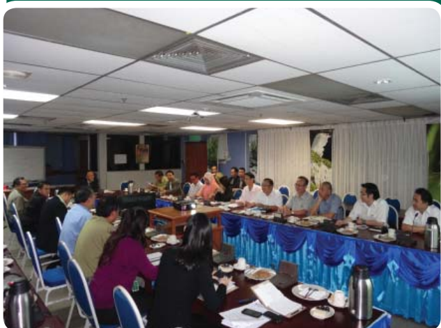
Photo: Briefing in Progress

A briefing on Sustainable Forest Management (SFM) and Certification in the Heart of Borneo (HoB), Sarawak was organised by Forest Department Sarawak (FDS) on 17 March 2014 at Wisma Sumber Alam, Kuching. The Briefing was attended by thirty seven (37) representatives from various government agencies such as FDS, Sarawak Forestry Corporation (SFC), Sarawak Timber Industry Development Corporation (STIDC), Harwood Timber Sdn Bhd (HTSB), Yayasan Sarawak, member companies of Sarawak Timber Association (STA), STA Secretariat, World Wide Fund for Nature (WWF) and a freelance consultant on certification.