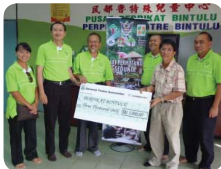
Photo: Visit to the Association for the Concerned Citizens and Parents of Handicapped Children (PERPIKAT) Bintulu

The state's World Forestry Day 2011 was commemorated on 22 March, with an official launch at Similajau National Park, Bintulu and the theme "Forest for Community". The World Forestry Day, which is celebrated internationally on 21 March annually, was jointly organised by the Ministry of Planning and Resource Management (MPRM), Forest Department Sarawak (FDS), Sarawak Forestry Corporation (SFC), Sarawak Timber Industry Development Corporation (STIDC), Harwood Timber Sdn Bhd, Sarawak Planted Forest Sdn Bhd (SPF) and Sarawak Timber Association (STA).