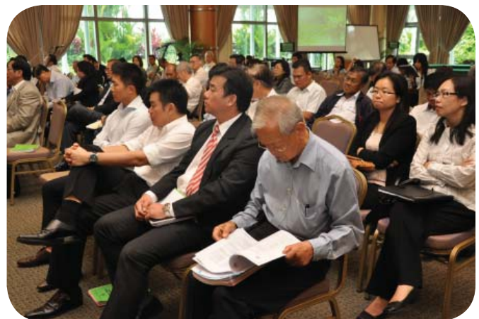
Photo: STA Members, observers and invited guests at the Meeting

The Meeting dealt with matters related to the Association and its wholly-owned companies, namely STA Enterprises Sdn Bhd, STA Training Sdn Bhd, STA Mutual Sdn Bhd and STA Ventures Sdn Bhd.