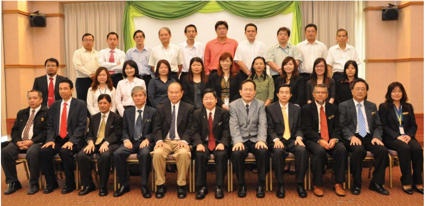
Photo: Group Photo