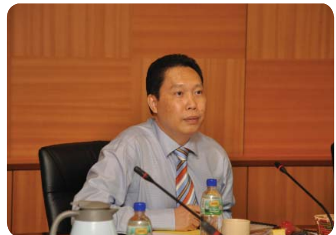
Photo: Bapak Rafail Walangitan, the Acting Consul General of The Republic of Indonesia

本會主席邦曼查拿督黃啓暉，榮譽財政朱光輝先生及本會9間會員公司代表于2011年3月16日假STA大廈會見駐古晉印尼領事館代領事，拉菲瓦林丹先生（譯音）及其領事館代表。