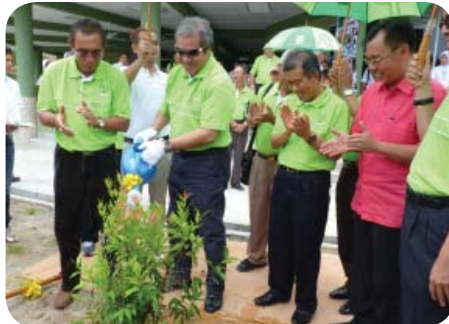
Photo: Tree Planting Ceremony