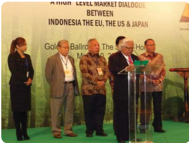
Photo: The Indonesian Associations' declaration to trade in legal wood products

SVLK was developed by the Indonesian Government through its Ministry of Forestry (MoF) as the only national wood legality system and standard to provide assurance to the global market that the wood products exported from the country use raw materials from sources that are legal in accordance with the Indonesia's rules and regulations.