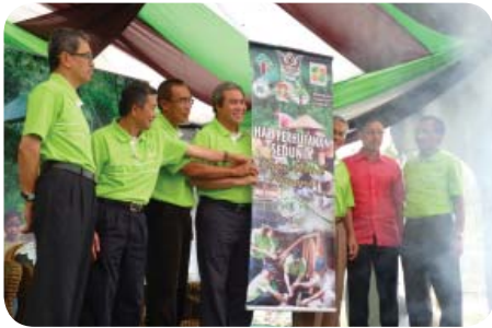
Photo: Launching of World Forestry Commemoration 2011 by the Minister