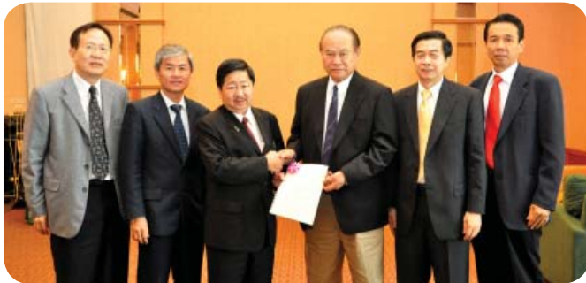
Photo: Presentation of STA's Proposal on Tax Incentives for Forest Plantation Development