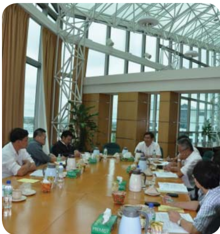
Photo: Meeting in progress