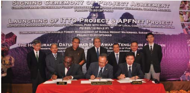
Photo: Signing of Project Agreement in Progress