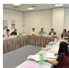
STA ANNUAL General Meeting