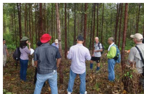
Photo: Discussion in Eucalyptus pellita plantation plot