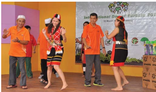
Photo: The residents participating in the traditional dance performance

本会于2016年3月16日拜访砂拉越盲人协会（SSB）和Rumah Seri Kenangan老人院（RSKK）。这是结合2016年森林日（IDF 2016）所举办的部分企业社会责任计划。