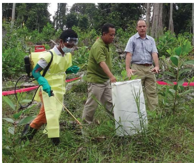
Photo: Chemical Weeding Demonstration

Satu mesyuarat teknikal mengenai Program Penyelidikan Ladang Hutan telah dianjurkan oleh SARAWAK FORESTRY Corporation Sdn Bhd (SFC) dari 16 hingga 17 Mac 2016 di Bintulu.