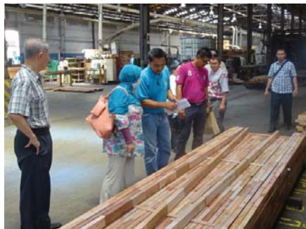
Photo: Visit to a door making factory

The delegation also visited the Philippines International furniture Show at the SMX Convention Centre Manila, SM Mall of Asia Complex, Pasay City to see first-hand the over 200 exhibitors of the locally-designed new and creative furniture and furnishings manufacturers.