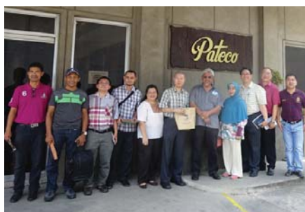
Photo: Visit to a door making factory