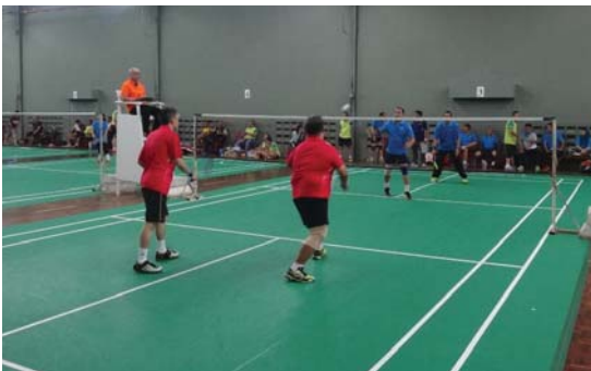
Photo: Players in action

基于配合2016年全国国际森林日 (IDF2016)，多个林业机构和组织举办了一系列体育赛事例如羽毛球、吹管、保龄球、室内足球和高尔夫球。这些比赛的目的是为了促进林业机构与组织之间的密切关系。