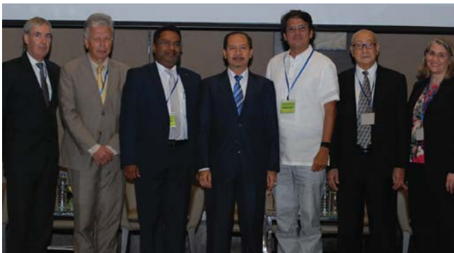
Photo: Group Photo of the Speakers

A total of 126 participants from the timber industry as well as the relevant ministries and departments attended the seminar. The following seven (7) papers were presented at the Seminar: