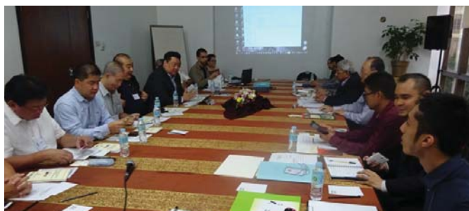
Photo: Discussion with PWPA