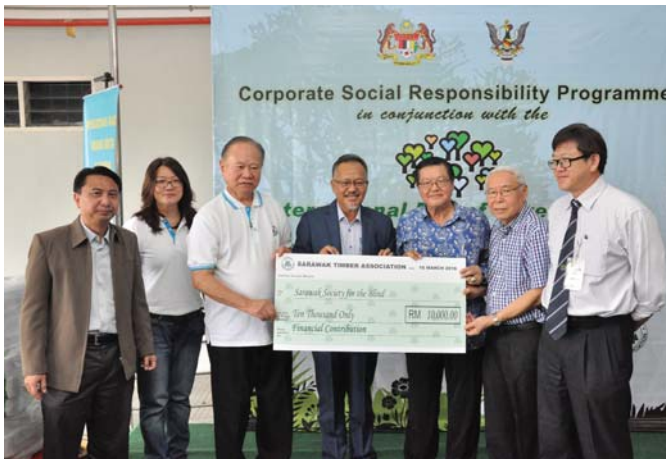
Photo: Cheque presentation to the Sarawak Society for the Blind Centre