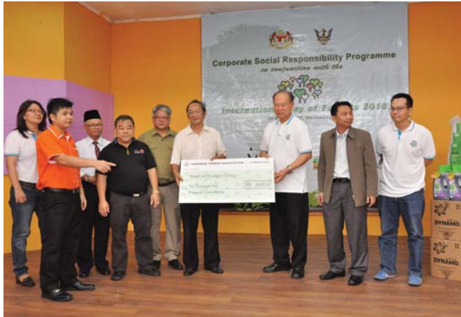
Photo: Cheque presentation to the Rumah Seri Kenangan Kuching

STA hoped that this Programme would provide some support to both Centres as well as to serve as a platform to engage and interact with members of the less fortunate communities.