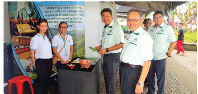
Photo: Visitors at STA exhibition booth

Sambutan Hari Hutan Antarabangsa 2016 (IDF 2016) Peringkat Kebangsaan telah diadakan di Kuching Waterfront, Kuching pada 26 Mac 2016. Objektif IDF 2016 adalah untuk meningkatkan kesedaran individu tentang kepentingan melindungi dan menghargai hutan dan sumber asli.