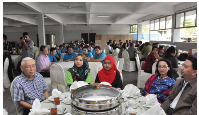
Photo: Guests and residents at the luncheon