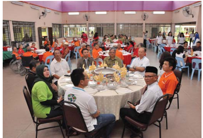
Photo: Guests and residents at the tea break

STA希望这项计划提供这两所中心一些支助，以及作为和不幸的社区成员进行互动一个平台。