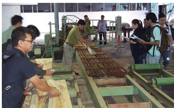
Photo: Students cutting logs into commercial sizes in TRTTC sawmill for log recovery calculation exercise

“Gred Balak dan Kualiti Kayu” merupakan subjek ketujuh bagi Cohort Keempat Kursus Diploma Lulusan Ijazah dalam Sains Gunaan ( Pengurusan Mampan Hutan Tropika / Pengurusan Mampan Hutan Ladang ) telah dijalankan dari 5 hingga 11 Mac 2016 di Wisma STA, Kuching.