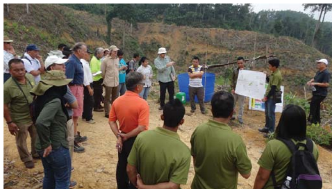
Photo: Briefing conducted in the field

The group visited the Borneo Tree Seeds & Seedlings Supplies Sdn Bhd (BTSSS) trial site, located in LPF 0002 on the second day of the Programme where they were briefed on the procedures on raising seedlings in the nursery, layout design of the trial sites as well as the seed source trials for E. pellita , Acacia mangium , Neolamarckia cadamba and Falcataria moluccana . Techniques on pitting, planting, fertiliser application and chemical weeding were also demonstrated during the field visit.