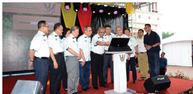
Photo: Launching of the IDF 2016 celebration