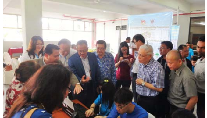
Photo: Demonstration on Braille

The entourage later took a closer look at how the visually-impaired residents use computer software i.e. Braille to communicate, use the computer, make baskets and chick boxes as well as play ping pong. The Event included light refreshments and entertainment by the Band formed by the residents of SSB.