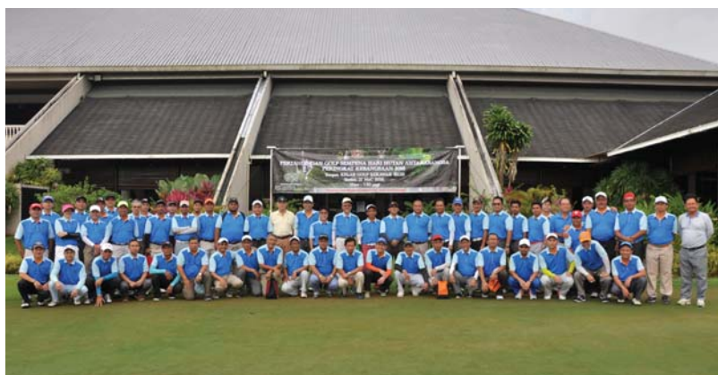
Photo: Golf tournament group photo