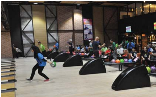
Photo: Bowlers in action