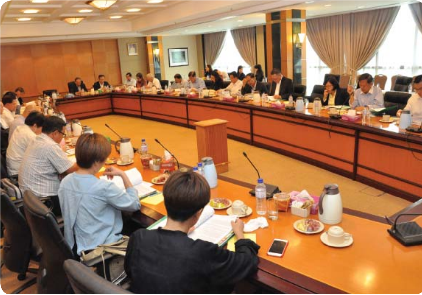
Photo: Meeting is in Progress