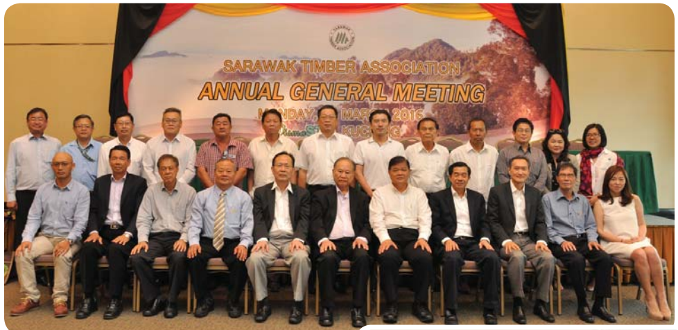
Photo: STA Council for 2016 and 2017 (with absentees) taken immediately after the AGM

Mesyuarat Majlis STA No 2/2016 telah diadakan sejeurus selepas Mesyuarat Agung Tahunan STA (AGM) pada 28 Mac 2016 di Wisma STA, Kuching.