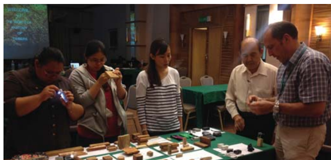
Photo: Students identifying wood specimens using the 10x hand lens and knife

The next subject, “Forest Engineering” will be held from 16 to 22 April 2016 in Bintulu.