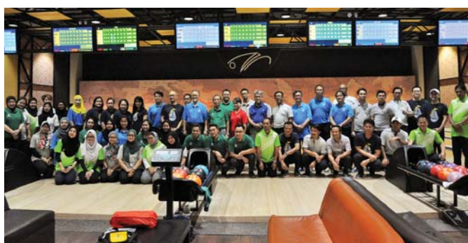
Photo: Bowling tournament group photo