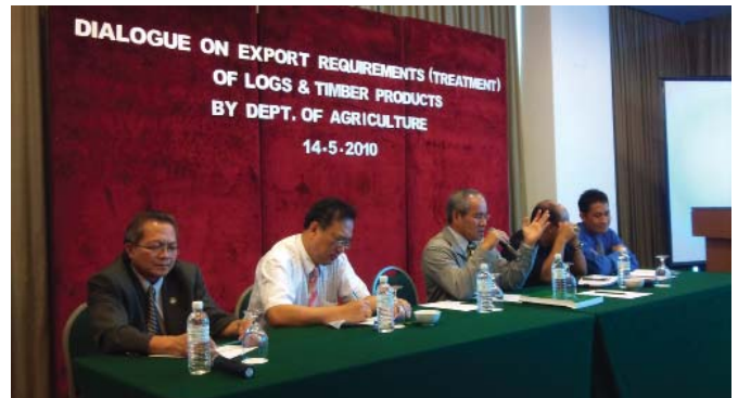
Photo: Dialogue in progress