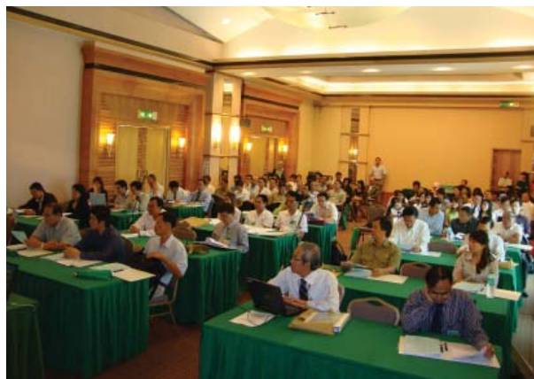
Photo : Workshop in progress

所发表的研究论文为SFC研究员, 马来西亚森林研究机构 (FRIM) 与工业界对三大树种, 即 Acacia mangium , Engkabang jantung 和 Kelampayan 所进行的研究成果。