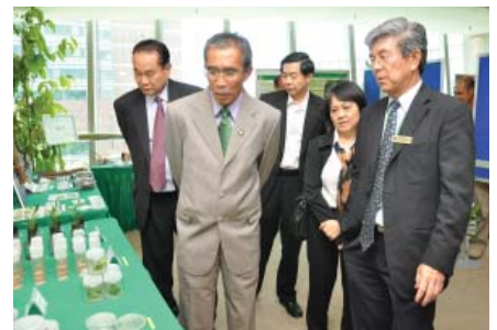
Photo: Tour of Exhibition