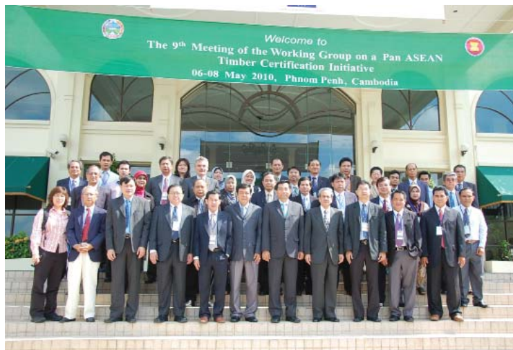
Photo: One for the album