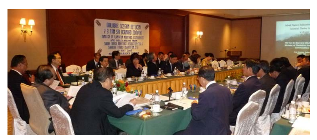
Presentation to the YB Minister