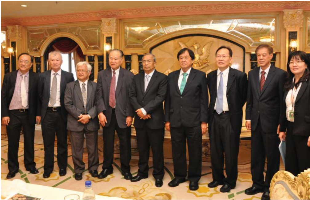
Photo: Group Photo