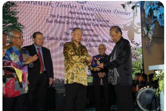
Photo: The Chairman of STA presenting a Golden Member Medal to the Chief Minister of Sarawak