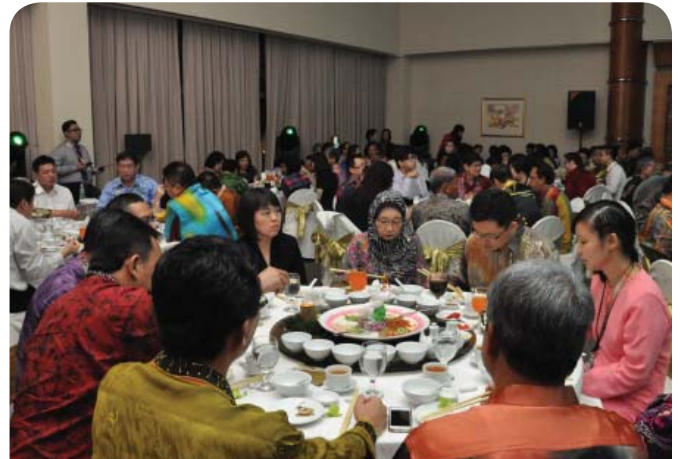
Photo: STA Members and Invited Guests during the dinner