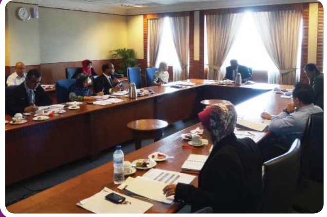
Photo: Meeting in Progress

A preparatory meeting for the Briefing to Timber Industry on Australia Illegal Logging Prohibition Act 2012 (AILPA 2012) was called by the Ministry of Plantation Industries and Commodities (MPIC) on 12 May 2014 in Putrajaya.