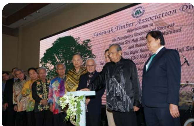
Photo: The launching of the STA's project on a book entitled "A Life in Sarawak Timber - Up Close and Personal" by the Chief Minister of Sarawak

Senior officers from the State Forestry Agencies were also invited to attend the dinner.