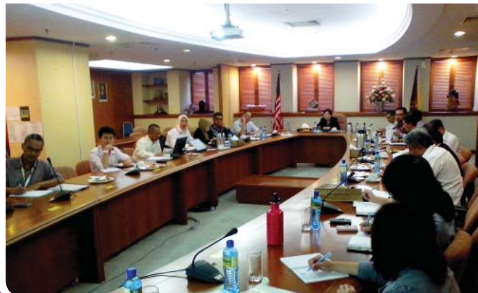
Photo: Briefing in Progress