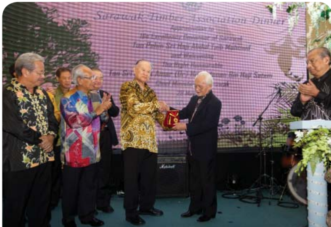
Photo: The Chairman of STA presenting a Golden Member Medal to his Excellency the Governor of Sarawak