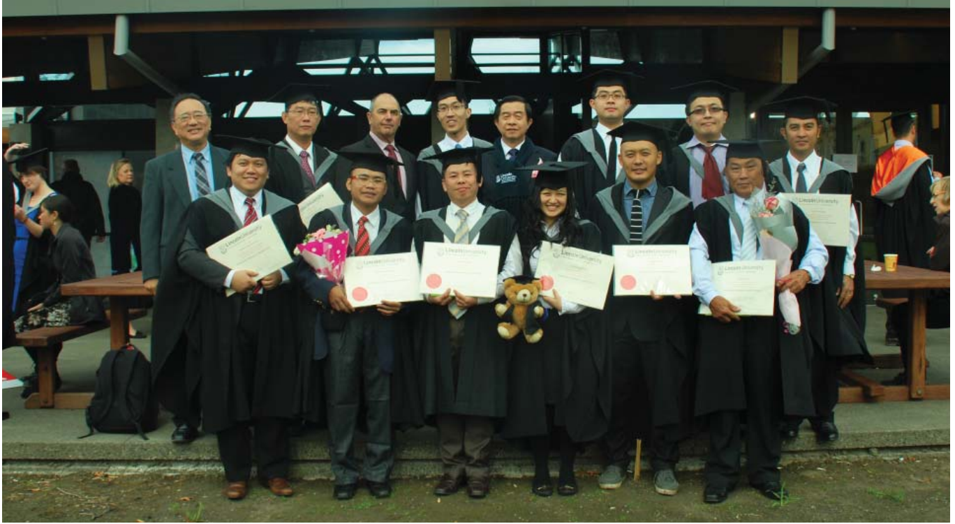
Photo: The graduates