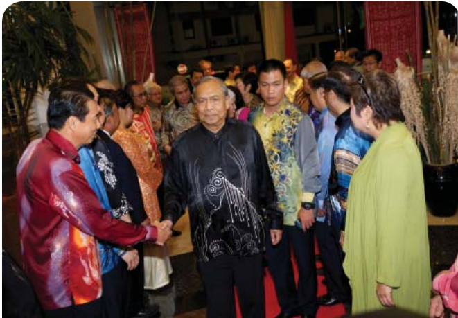
Photo: The arrival of the Chief Minister of Sarawak

The Sarawak Timber Association (STA) with great honour, hosted a dinner on 28 May 2014 at Wisma STA in Kuching to record its upmost appreciation to His Excellency the Governor of Sarawak, Tun Pehin Sri Haji Abdul Taib Mahmud, for his pioneering and profound contributions towards the timber industry in Sarawak during his tenure as the Chief Minister of Sarawak from 1981 to 2014; a total of 33 years of golden leadership. At the dinner, STA also welcomed the new Chief Minister of Sarawak, Tan Sri Datuk Amar (Dr) Haji Adenan Satem.