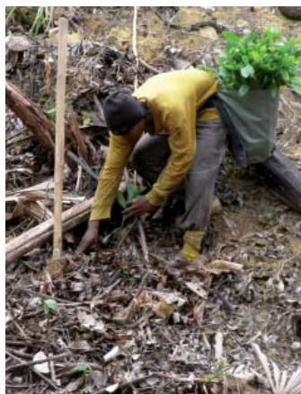
Hardened off seedlings are being planted at the planting site that was prepared in advance