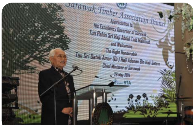
Photo: His Excellency the Governor of Sarawak giving his speech

In response to the Chairman's speech, the Chief Minister of Sarawak commented that he would try to continue the immeasurable efforts done by his predecessor, to bring the timber industry to even a greater height as well as to achieve a high profile not only in the state and country but also in the international arena. He also emphasised that STA should not be too dependent on the Government to tackle the anti tropical campaigns but instead should be more proactive in handling the issue. In addition, the Chief Minister reiterated that the industry should take more responsibilities in training as well as conducting research.