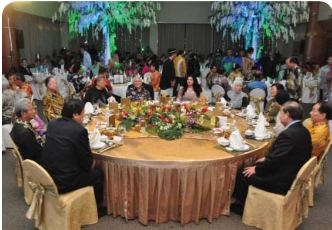
Photo: VVIP table with His Excellency the Governor of Sarawak and the Chief Minister of Sarawak