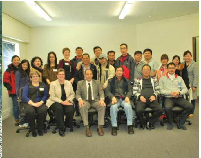
Photo: Group Photo with teaching and supporting staff to the Postgraduate Diploma Programme from Lincoln University

Sebelas (11) daripada dua puluh (20) orang pelajar kohort ketiga Diploma Pasca Siswazah dalam Sains Gunaan (Pengurusan Mampan Hutan Tropika) telah menghadiri Majlis Konvokesyen di Pusat Acara Lincoln di Christchurch, New Zealand pada 2 Mei 2014.