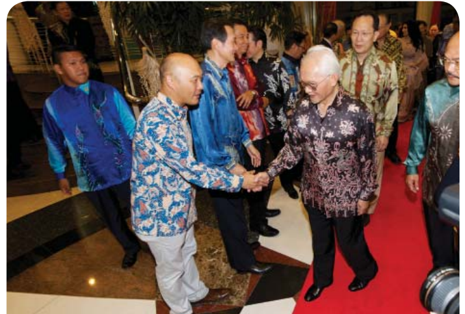
Photo: The arrival of His Excellency the Governor of Sarawak