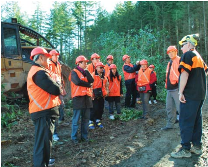
Photo: Visit to a FSC-certified forestry operation, owned and managed by Blakely Pacific Ltd near Geraldine, New Zealand