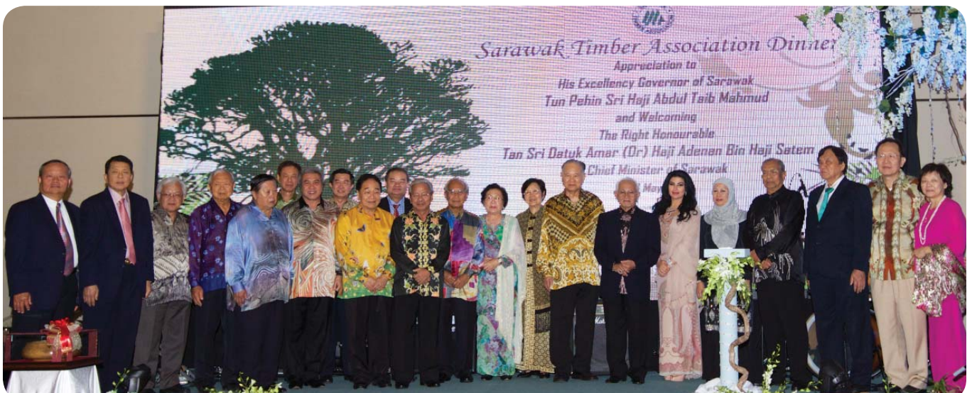
Photo: Group photo after the launching of the STA's project on a book entitled "A Life in Sarawak Timber - Up Close and Personal" by the Chief Minister of Sarawak