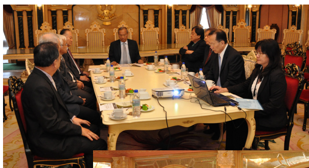
Photo (left): Discussion with the Right Honourable Chief Minister and (below) Group photo

The news bulletin is circulated to designated readers free of charge.