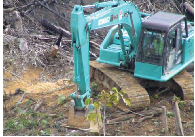
Photo: Mechanical Site Preparation

Untuk membayar kos latihan, STA akan menyediakan insentif kewangan kepada Syarikat Ahli STA bagi setiap pekerja yang dilatih dan dinilai kompeten dalam mana-mana lima (5) aktiviti perhutanan yang ditetapkan di atas.