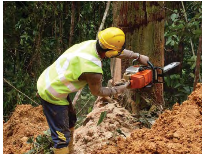
Photo: Tree Felling