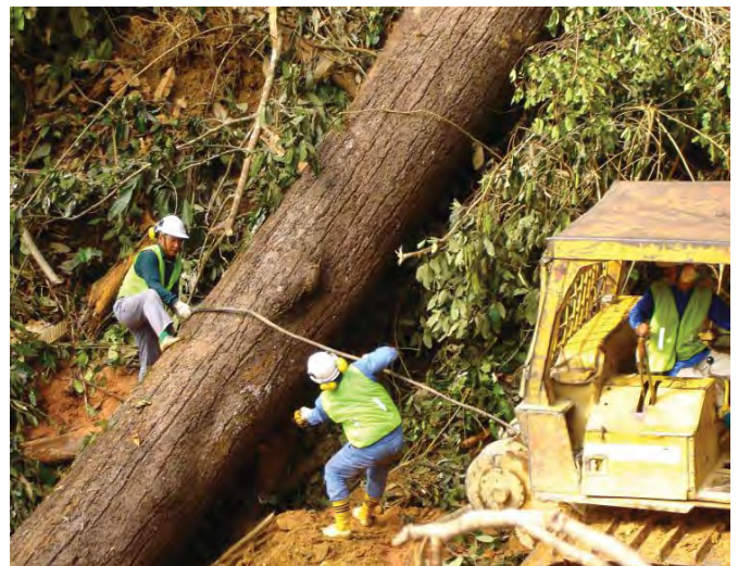
Photo: Strapping the log for extraction