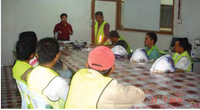
Photo: Classroom session for theory

Peraturan Hutan (Pekerja Terlatih), 2015 akan mula dikuatkuasakan pada 1 Julai 2015 bagi membantu pelaksanaan Seksyen 54B Ordinan Hutan (Cap 126).