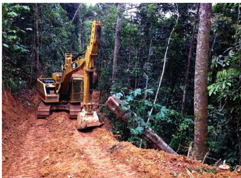
Photo: Excavator using cable to winch the log from the felling site to the terrace

The field visit started off with a presentation by the representatives of Ta Ann, explaining how Ta Ann implements the zebra-RIL in the FMU since the year 2013 and highlighted its concept including the comparison between zebra-RIL logging and conventional logging, based on seven (7) key aspects as well as the details of the post-harvest enrichment planting towards