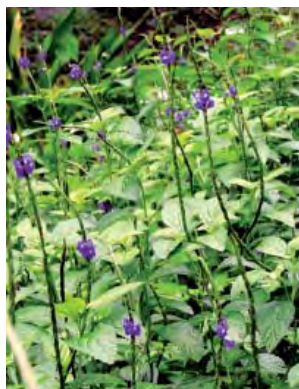
Stachytarpheta jamaicensis (Blue porterweed) Common Usage For treating urinary tract infection, "ulcerated stomachs" and remove kidney stones

Disclaimer: This content is for informational purposes only and does not render medical or psychological advice, opinion, diagnosis, or treatment. It should neither be used for diagnosing or treating a health problem or disease, nor meant to be a substitute for professional care. This information is provided only as an informational resource, and it should neither be implied that we recommend, endorse or approve of any of the content, nor are we responsible for their availability, accuracy or content, or shall in anyway be held responsible for any illness or sicknesses suffered after consuming the medicinal plants contained herein.