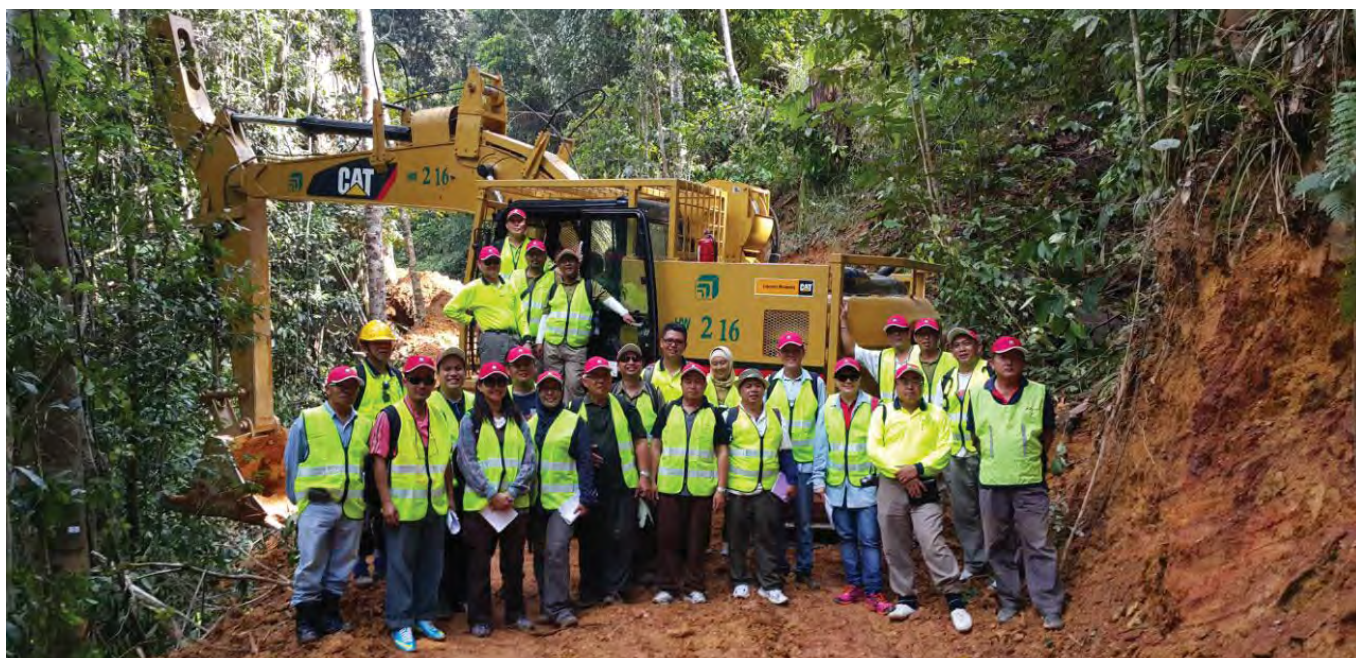
Photo: Group photo at the operation site

Forest Department Sarawak (FDS) in collaboration with Ta Ann Group of Companies (Ta Ann) organised a field visit to a Forest Management Unit (FMU) operated and managed by Ta Ann from 11 to 14 May 2015 in Kapit, Sarawak.