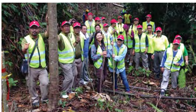
Photo: Post-harvest enrichment planting of Kelampayan under Zebra-RIL system

在闭幕晚宴上，参与者有机会与大安执行主席拿督阿玛哈芝阿杜哈米（译音）及大安集团董事与行政总裁拿督黄国惠进行一项开放和坦率的对话。对话内容包括实行“斑马”概念时所需克服的挑战。