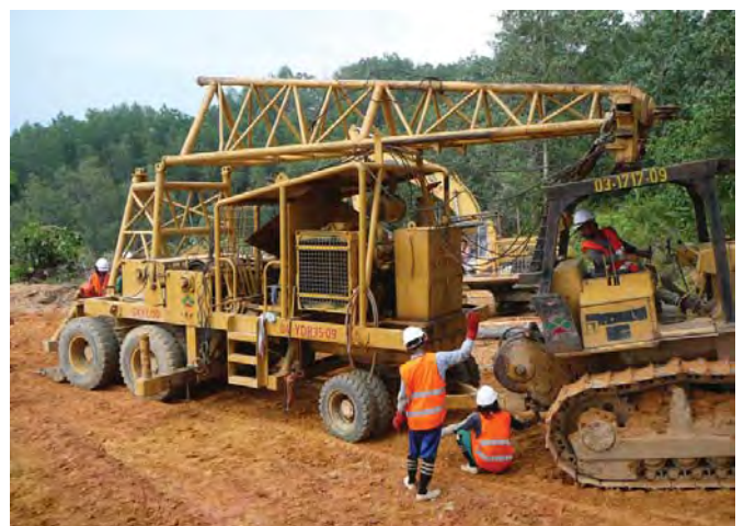
Photo: Log Extraction - Cable Hauler in Forest Plantation