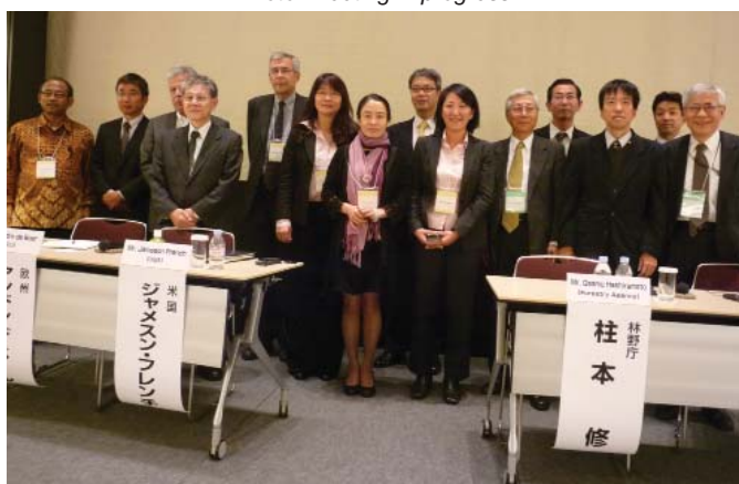
Photo: Seminar participants