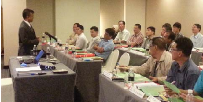
Photo: Workshop in progress

The Workshop on “Development Aspect of Occupational Safety and Health in the Forestry Sector”, organised by the National Institute of Occupational Safety and Health Malaysia (NIOSH) in collaboration with SOCSO and with support from Sarawak Timber Association (STA), was held from 5 to 7 November 2012 at Tanahmas Hotel in Sibu. Approximately thirty (30) participants from the member companies attended the workshop.