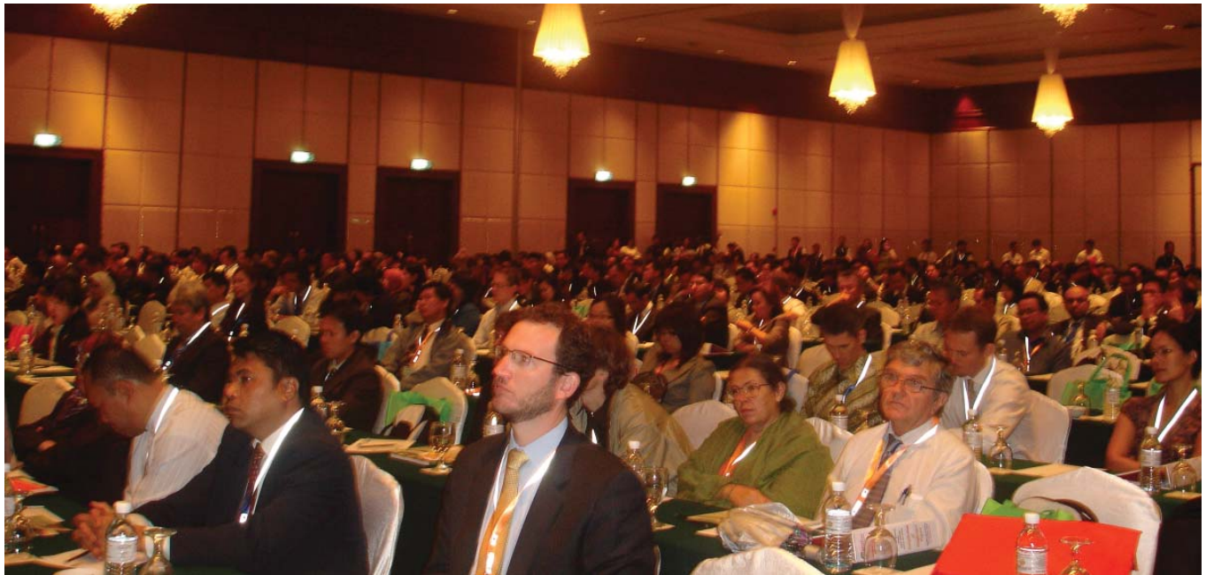
Photo: Conference in progress