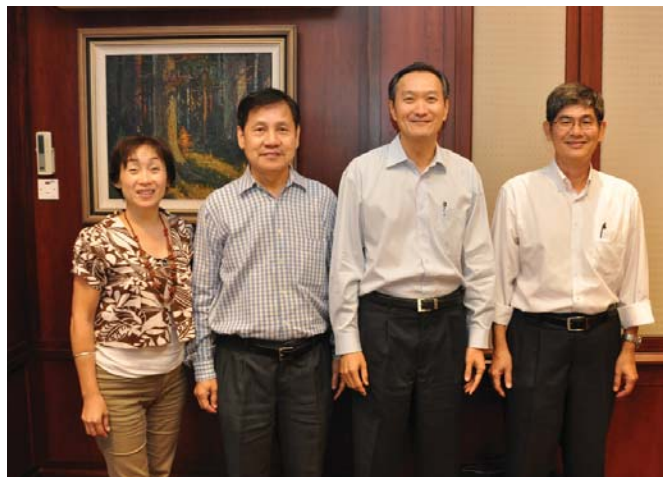
Photo: Group photo with some of the STA Furniture & Other Woodworking Committee for the term 2014 and 2015