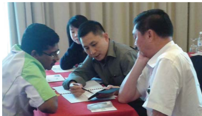
Photo: One-to-one consultation in progress

The second session covered the MyHIJAU Mark Clinic whereby participants of the Briefing were introduced to and familiarised with the application process for MyHIJAU Mark. A 'one-to-one' basis consultations and online pre-registration of green product(s) also were carried out during the clinic session.