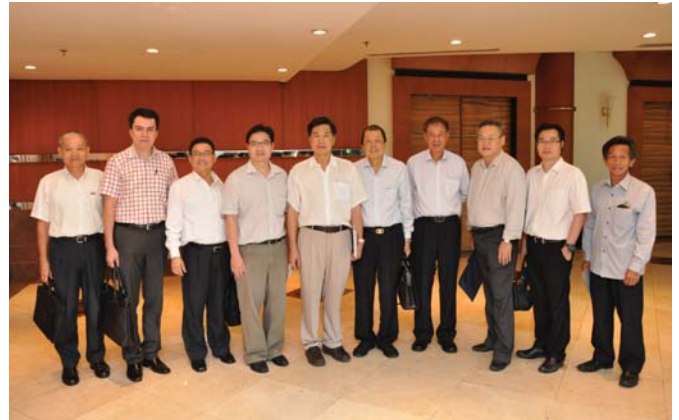
Photo: Group photo with some of the STA Log Marketing Committee for the term 2014 and 2015