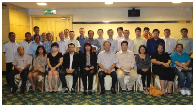
Photo: Participants of the Briefing in Miri