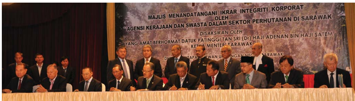
Photo: Signing in progress

The Malaysian Anti-Corruption Commission (MACC) together with the Sarawak Forestry Department organised the Corporate Integrity Pledge (CIP) signing ceremony which was participated by representatives from government agencies, timber licence holders and contractors on 17 November 2014 at the Sarawak Legislative Assembly Complex, Kuching. The signing of this pledge signified the seriousness of the Government agencies and timber industry in promoting transparency and eradicating corruption in the industry.