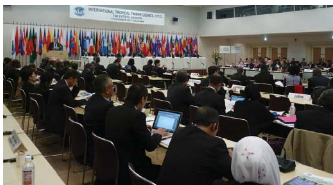
Photo: Meeting in progress

The 50 th Session of the International Tropical Timber Council (50 th Session of ITTC) and the Associated Sessions of its four Committees were held from 3 to 8 November 2014 in Yokohama, Japan. During the meeting, the Government of the Central African Republic acceded to the International Tropical Timber Agreement, 2006 (ITTA, 2006), bringing total membership of the International Tropical Timber Organization (ITTO) to 70.