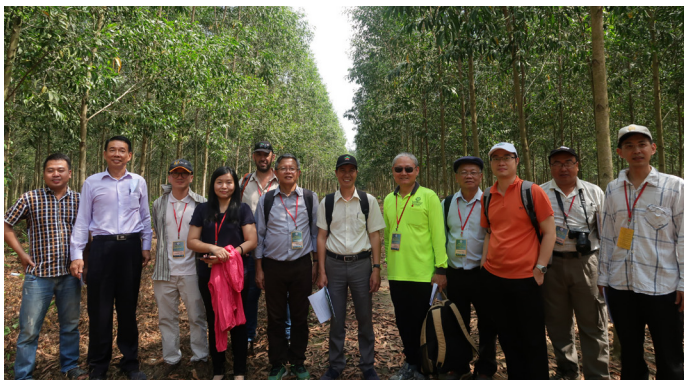
Group photo taken at the Tan Phu Forest Experimental Station