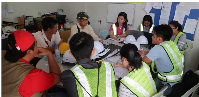
Participants conducting interviews during a site audit practical

由砂拉越木材公会与砂拉越天然资源与环境局(NREB)联合举办，第四届环境合规审计(ECA) 培训课程。培训分为两部分，分别在2018年10月15日至19日及11月12日至14日，并由张贺冠博士（译名）于本会大厦进行指导。这是STA为加强其会员公司在环境管理方面的能力建设以及为实施2008年自然资源和环境（审计）规则做好准备而采取的其一举措。