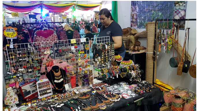
Handicraft display at NTFP Carnival 2018

'NTFP Kid's Colouring Contest 2018', 'NTFP Kid's Fashion Show Contest', 'NTFP Musical Night 2018', 'The Voice of NTFP 2018' and lucky draw were also organised to attract more visitors to the five-day Carnival.