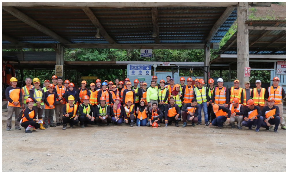
Group Photo taken during the Mock Audit at the Kapit FMU

The Trainers shared with participants of the Course the evidence gathered during the audit including its method, selection, number of samples and timing. They added that auditors should conduct Interview and stakeholder consultation sessions to collect information on the management system of a company.