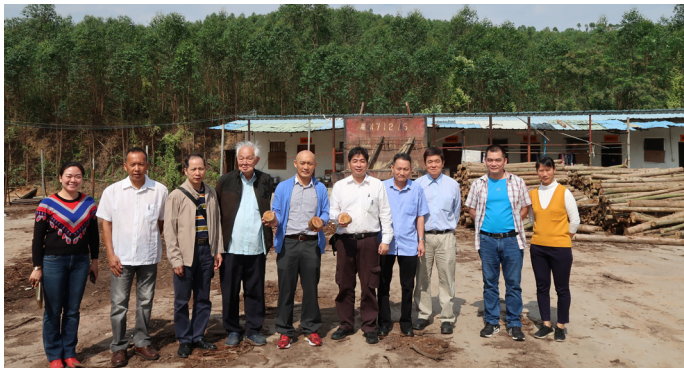
Group photo in front of the Eucalyptus plantation site and log pond

all the wood materials are imported directly from America, Africa, Europe, Indonesia and Viet Nam. The company is willing to consider the use of timber species from Sarawak such as Eucalyptus , Acacia , hardwood timbers and etc for their overseas markets if the species are found to be suitable for flooring production.