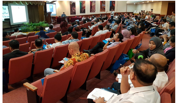
Briefing in progress

The speaker reminded the participants that it is compulsory for any person either managing or operating any plant, factory or premises carrying out any timber processing and trading activities to register with STIDC. He also mentioned the benefits to register with STIDC which included invitation to participate in timber selling missions, exhibitions, seminars, workshops, briefings and etc.