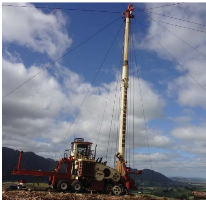
Photo: High Tower Yarder

Members of the delegation were taken to three sites belonging to Hancock Forest Management (NZ) Ltd, the largest planted forest owner/manager in NZ of 251,000 ha or 14.6% of the total forest stocked area, located at the outskirts of Dargaville and Whangarei in the North Island to see how 27 to 28 year old Radiata pine are harvested using different systems i.e. swing yarder, ground-based and high-tower yarder.