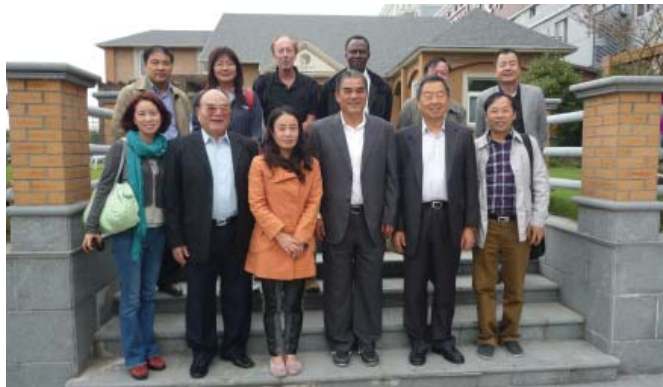
Photo: Group photo during the field trip