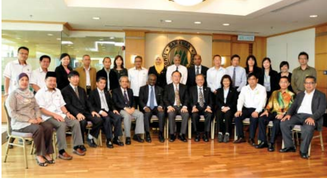
Photo: Group photo