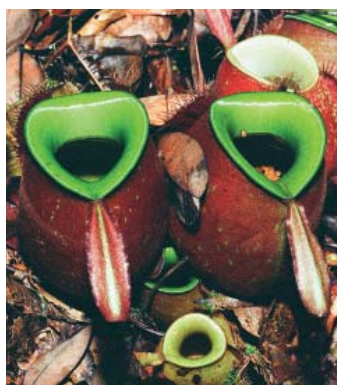
Nepenthes ampullaria Habitat: Peat swamp and Kerangas forests (in shady locations)