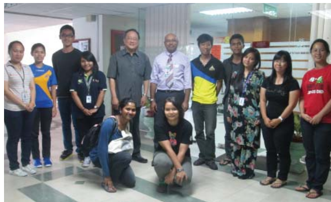
Photo: Group photo with the students from Sarawak studying Forestry in UPM

The students were encouraged to equip themselves with up-to-date knowledge as forestry graduates with skills in negotiating; managing forest resources through the use of new technologies; auditing, enforcing and implementing forestry laws to meet certification requirements are required; as well as in carrying out field research.