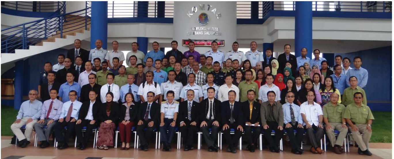
Photo: Group photo

The Convention on International Trade in Endangered Species of Wild Fauna and Flora (CITES) Inter-Government Agencies Consultation and Capacity Building Seminar 2013 was organised by the Forest Department Sarawak (FDS) on 30 October 2013 at Kompleks Maritim Tun Abang Salahuddin (KOMTAS), Jalan Bako, Muara Tebas, Kuching. The Seminar was attended by approximately one hundred (100) participants from various agencies such as the Ministry of Natural Resources and Environment (MNRE), the Royal Malaysia Customs Department, the Royal Malaysia Police, the Forest Department Sarawak, the Department of Fisheries, the Department of Agriculture, Agriculture Institute Sarawak, the Sarawak Industry Development Corporation (STIDC), Kuching Port Authority and Hardwood Timber Sdn Bhd, Sarawak Timber Association (STA) and Sarawak Forestry Corporation.