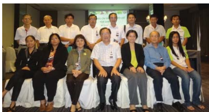
Photo: Participants in Sibu

The Sarawak Forestry Corporation (SFC) and Sarawak Timber Association (STA) jointly organised a series of briefings on the results of a Re-assessment of the conservation status of three genera of Dipterocarpaceae ( Dipterocarpus , Dryobalanops and Shorea ) in Sarawak on 22 October 2013 and 24 October 2013 in Wisma STA, Kuching and Tanahmas Hotel, Sibu respectively. The re-assessment was done on three genera i.e. Dipterocarpus , Dryobalanops and Shorea based on the International Union of Conservation for Nature (IUCN) categories and criteria. The research project which commenced in 2008 was funded by STA.