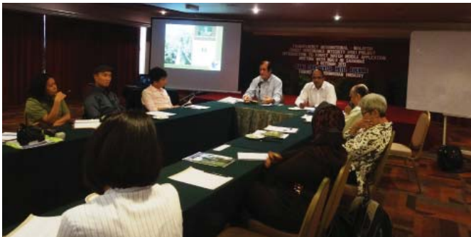
Photo: Meeting in progress

A meeting on the Forest Watch Project with Non-Governmental Organizations (NGOs) was conducted by Transparency International – Malaysia (TIM) on 9 October 2013 at the Grand Continental Hotel, Kuching. Approximately sixteen (16) participants attended the meeting.