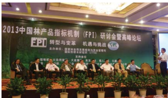
Photo: From left; representative from nine (9) local lending timber enterprises namely Anxin Floors, Treessun Flooring, Kangda Floor Wood, Dare Wood Based Panel Group Co., Ltd., Layo Wood, Lin Floor, Senlian Timber, Furen Market, Yihuang Wood

Representatives from nine (9) local lending timber enterprises shared their views and experiences on how they have adapted and made changes in their business strategies accordingly to meet the challenges faced by the Chinese market. They recognised that the international timber trade is getting very challenging and felt that the domestic market should not be neglected.