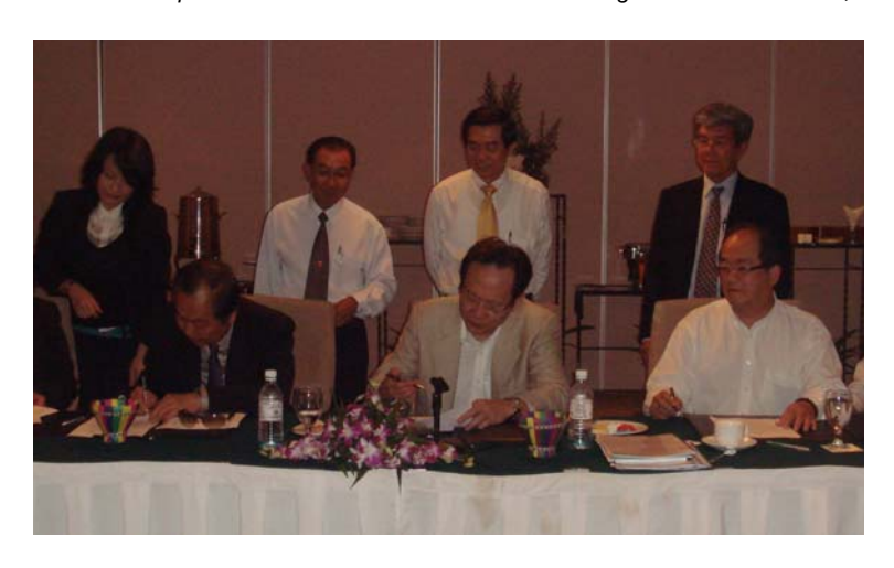
Left:: Signing of the Joint Statement by STIA, TAS and STA