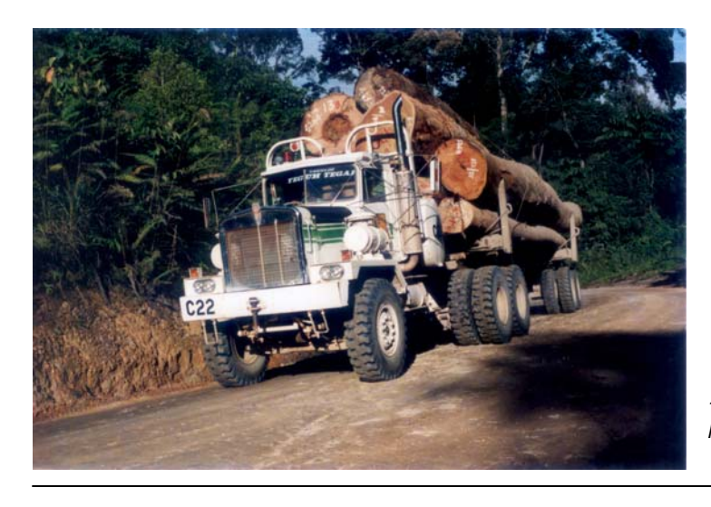
Truck transporting loas

STA telah menerima surat dari Harwood Timber Sdn Bhd (Harwood) bertarikh 29 Oktober 2009 yang memberitahu bahawa tarikh pelaksanaan pengeluaran Pas Pengangkutan Harwood adalah 1 Januari 2010 .