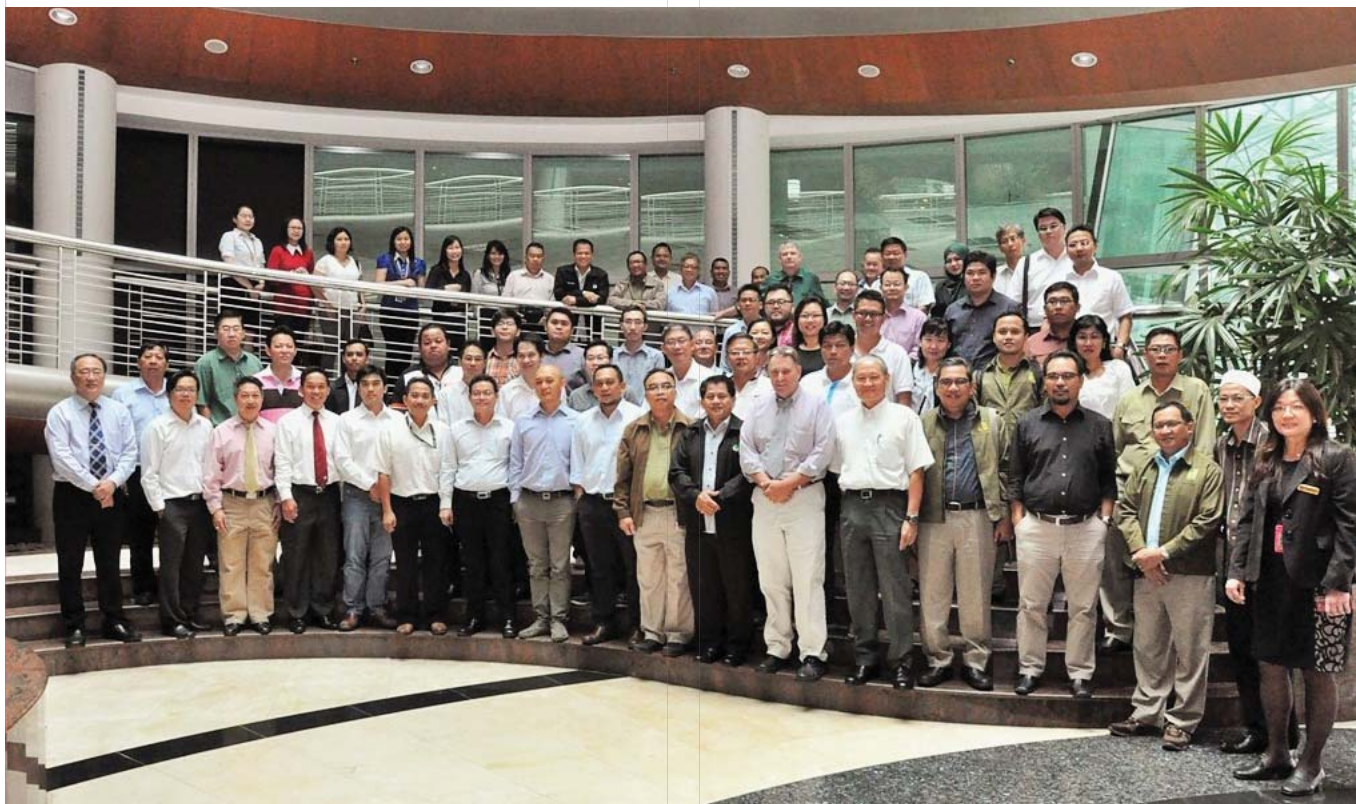
Photo: Group photo of the participants of the Workshop

Persatuan Kayu Kayan Sarawak (STA), bersama-sama dengan Perkhidmatan Perhutanan Global (GFS) menganjurkan Bengkel dua hari mengenai GFS' Legal Verification Services (LVS) dan Wood Tracking Programme (WTP) dari 26 hingga 27 Oktober 2015 di Wisma STA, Kuching.