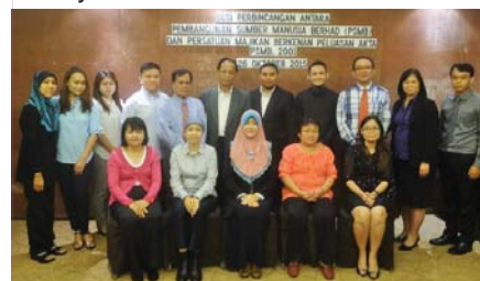
Photo: Group photo

to the PSMB Act 2001 and (ii) SMEs, usually with a small workforce have difficulties in sending their employees for training and as a result the 1% levy will be forfeited from their HRDF account if this fund remains unutilised for 5 years.