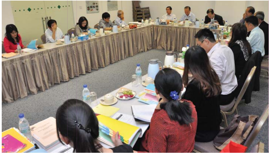
Photo: Meeting in progress

Lembaga Penasihat Kehormat (BHA) STA telah bermesyuarat pada 23 Oktober 2015 di Wisma STA, Kuching. Ahli-ahli BHA memutuskan untuk mengesyorkan keputusan berikut kepada Lembaga Pengarah Syarikat untuk kelulusan: