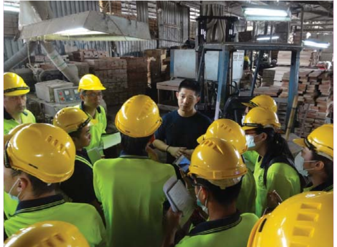
Photo: Students being given a tour and briefing at Koh Ying Industrial Sdn Bhd, Sibu

除了以课堂方式进行教学，学生也参观了8家制造厂。接下来的课堂“木桐等级和木材质量”将在明年3月5日至11日假古晋STA大厦进行。