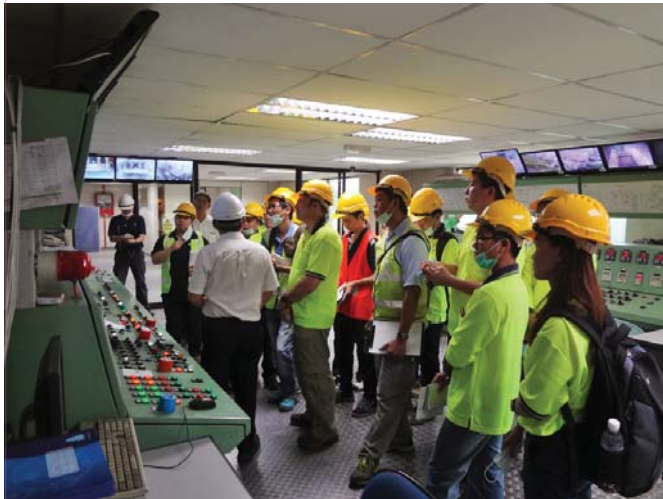
Photo: Visit to the operation room at Subur Tiasa Particleboard Sdn Bhd, Sibu

The next subject, “Log Grades and Wood Quality” will be held next year from 5 to 11 March 2016 at Wisma STA, Kuching.