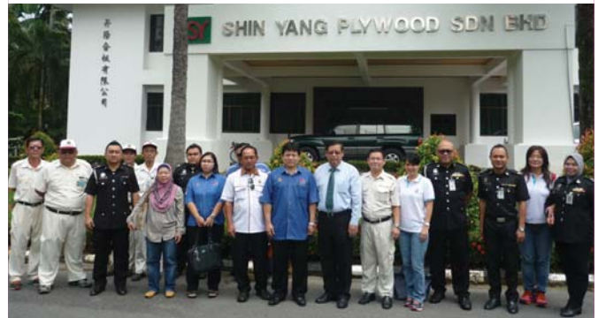
Photo: Mill visit to Shin Yang Plywood Sdn Bhd

代表团在单板和胶合板生产线所需的工人数量，本会会员招募AP矩阵上达成共识。这矩阵将被推荐至相关州机构以供批准。