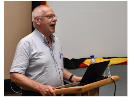
The speaker delivering his presentation

砂拉越会木材工会 (STA) 连同砂拉越森林企业机构有限公司 (SFCSEB) 于2018年10月27日假古晋 STA大厦举办专题为“藤 - 自然历史和民族植物学”的教育讲座会。