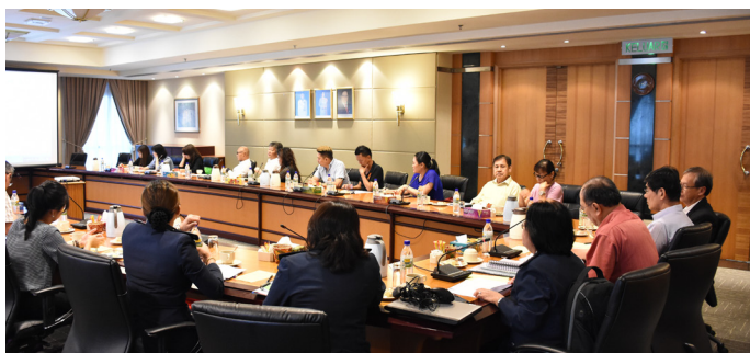
Meeting/ Dialogue in progress

STA Furniture & Other Woodworking (F&WW) Committee with the assistance of the SST Working Group organised a Meeting/ Dialogue with the Royal Malaysian Customs Department (RMCD) on SST on 11 October 2018 at Wisma STA, Kuching.