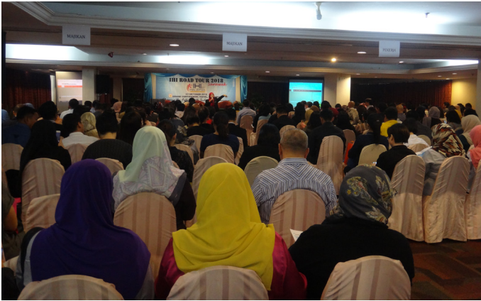
Participants at the Programme

The Department of Industrial Relations Malaysia (DIRM) held an “Industrial Harmony Programme: Employer and Employee's Rights under the Industrial Relations Act 1967 Required To Safeguard Industrial Harmony in the Workplace” on 3 October 2018 at Grand Continental Hotel, Kuching. Approximately 220 participants attended this Programme.