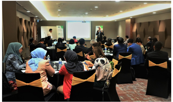
Workshop in progress

It was agreed that EFI will circulate the final draft Code of Conduct, incorporating all inputs received from participants at the Workshop, to all participants for comments in mid November 2018.