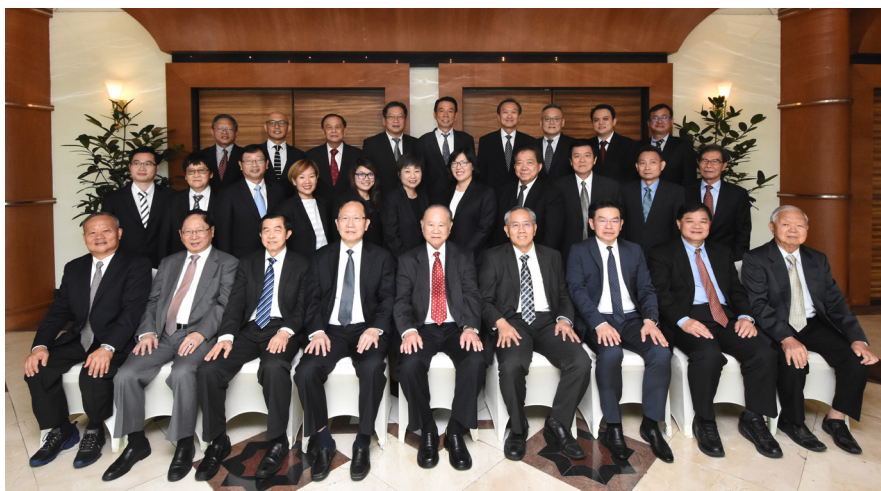
Group Photo of STA Council Members with Pemanca Datuk Wong Kie Yik (Seated in the middle)

Over the years, the timber industry has made significant contribution towards the economy and development of the State. Currently, the timber industry is facing many significant challenges and STA would like to call upon the Government to facilitate by implementing conducive policies for the benefit of both the people and the State of Sarawak. The STA Council promises to lead STA for future growth in line with the objectives of the timber industry of Sarawak.