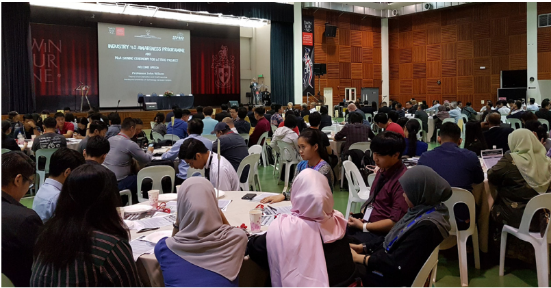
Participants at the Industry 4.0 Awareness Programme

Swinburne Innovation Malaysia (SWIM) Sdn Bhd and Swinburne's School of Information and Communication Technologies, Faculty of Engineering Computing and Science, the Swinburne University of Technology Sarawak Campus (SUTS) with the support by the Ministry of Industrial & Entrepreneur Development (MIED) Sarawak, organised an Industry 4.0 Awareness Programme: Manufacturing 4.0 Workshop and MOA Signing Ceremony for Joint Internet of Things (IoT) R&D Project on 16 October 2018 at the Multi-Purpose Hall of SUTS, Kuching.