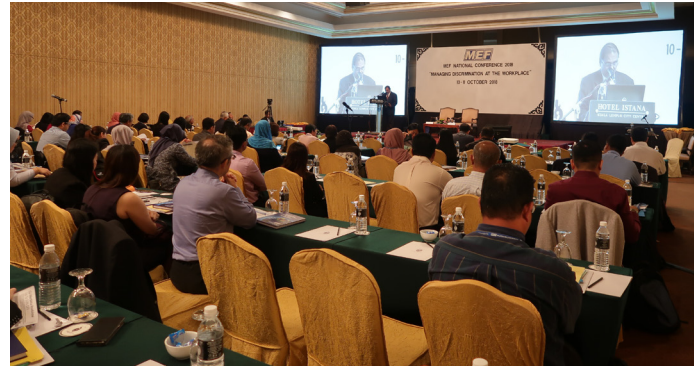
Conference in progress