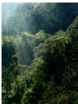
Location: Padawan, Kuching