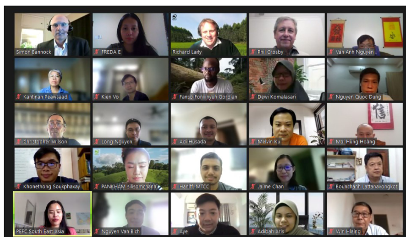
Face to screen learning in progress

The Training Programme also offers training on two (2) accreditation standards, namely ISO/IEC 17065 for product certification and ISO/IEC 17021-1 for management system certification, jointly carried out with Joint Accreditation System of Australia and New Zealand (JAS-ANZ). STA Secretariat joined as observer to the JAS-ANZ webinar courses which received participation from representatives from certification body, accreditation body, national governing body and government organisation from across ASEAN.