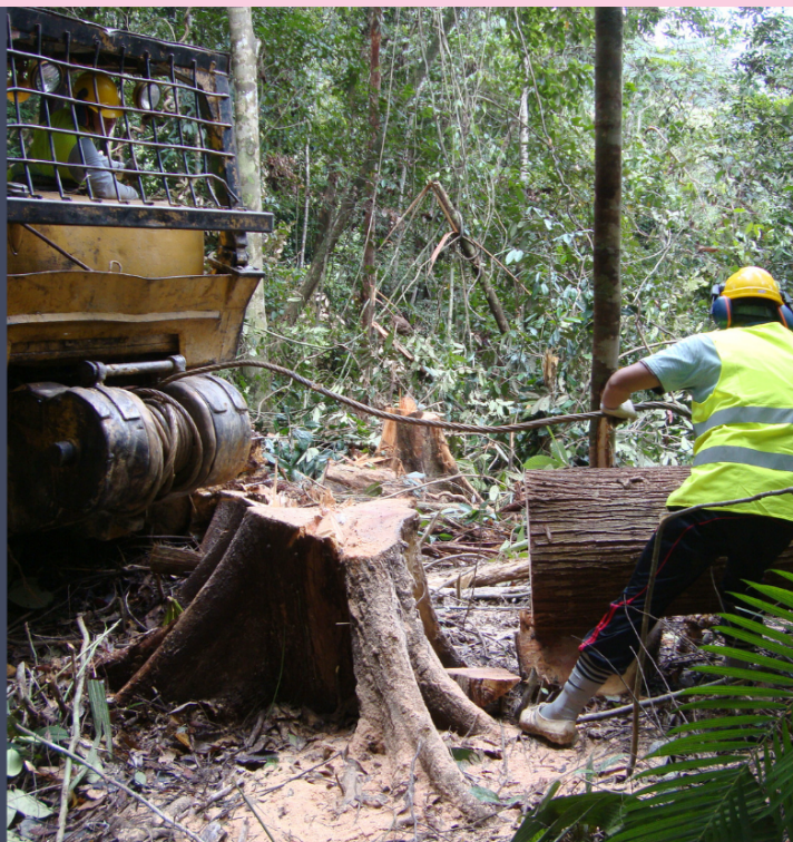
Log Extraction - attaching wire rope to a log

Targeting existing (Refresher Course) or potential (Training Course) in-house trainers who will be training their operators on forestry activities such as tree felling, log extraction, log loading, etc.