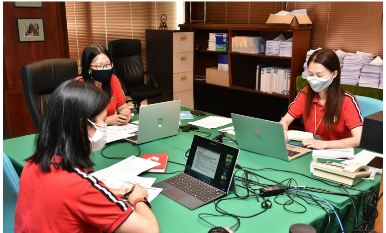
STAT conducted an online engagement session on 26 August to discuss the industry's training needs

With the imposition of containment measures as well as restrictions on movement and gathering to curb the spread of the virus, this initiative by STAT is especially important to support continuous capacity building in the timber industry and to comply with DF Circular No 6/2020: The Directive On Trained Workmen issued by Forest Department Sarawak (FDS).