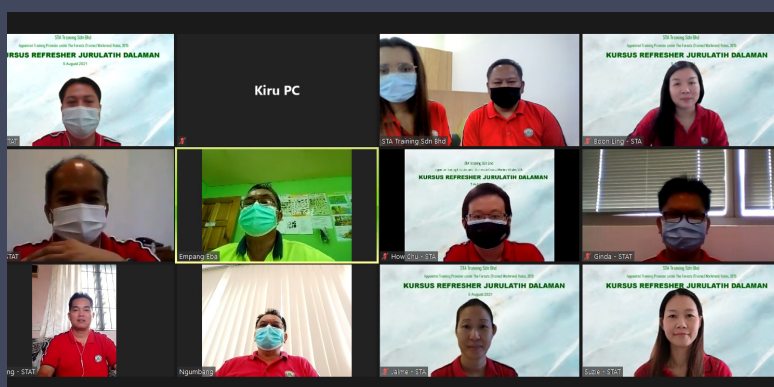
Refresher course on 5 August