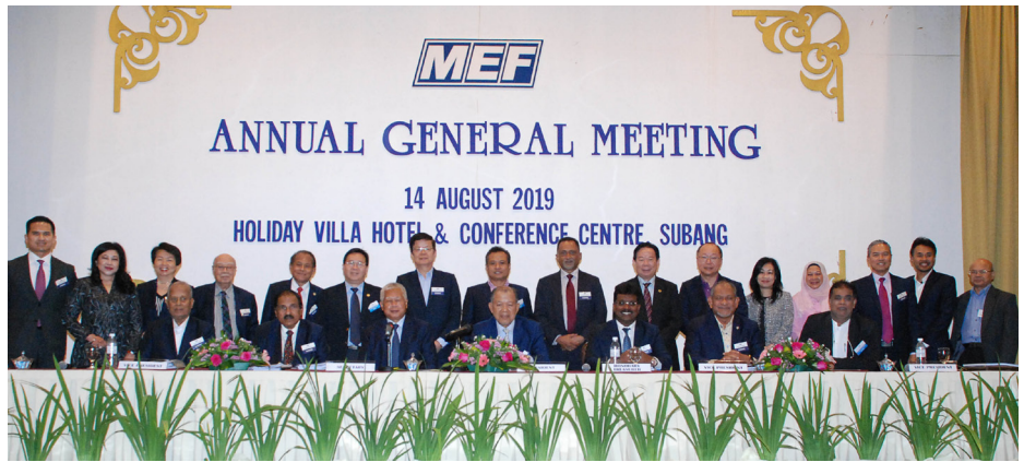
Council Members of MEF

With that, MEF wrote in and requested the Minister of Human Resources to simplify the Department of Labour's approval process to not take more than 48 hours and the requirement should be based on verification of existence of business operations without assessment. MEF is pushing for this simplified scheme which could provide an immediate solution to employers who are facing critical shortage of foreign workers.