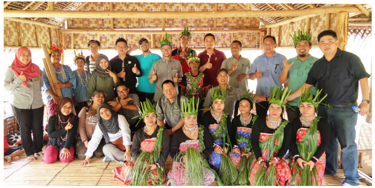
Visit to Orang Asli Village at Kampung Bersah, Pos Kuala Mu, Sungai Siput

2019年8月21日,该参访团前往武吉近打生产林区。PSFD也带领砂拉越参访团前往位于Kledang Saiong永久森林保护区内名为Eko Rimba Kledang Saiong Park的休闲公园。