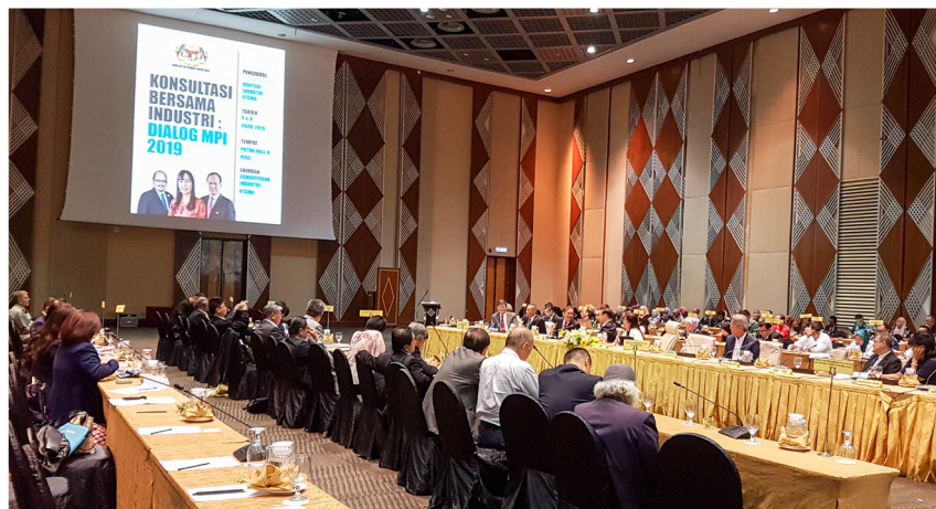
Dialogue in progress

The Dialogue 2019: Ministry of Primary Industries (MPI) Consultation with Industries was held on 6 and 8 August 2019 at Putrajaya International Convention Centre, Putrajaya. The Dialogue is part of MPI's ongoing public engagement with the industries to obtain feedback and suggestions from each of the plantation and commodities sector, namely (i) cocoa, kenaf and tobacco industry; (ii) rubber industry; (iii) oil palm and biofuel industry; and (iv) timber industry. The Dialogue with the timber industry was held on 8 August 2019.