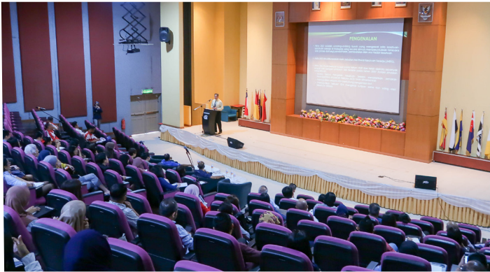
Briefing in progress

The Department of Industrial Relations Sarawak (DIRS), and Trade Union Affairs Department Sarawak (TUADS) under the Ministry of Human Resources (MoHR), held a Briefing on the proposed amendments to Industrial Relations Act 1967 [Act 177] (IR Act) and Trade Union Act 1959 [Act 262] (TU Act) at Industrial Training Institute, Kota Samarahan, on 21 August 2019. The objective of this Briefing was to obtain inputs and views from participants on the amendments of both Acts. About eighty (80) representatives from trade unions and employers attended the event.