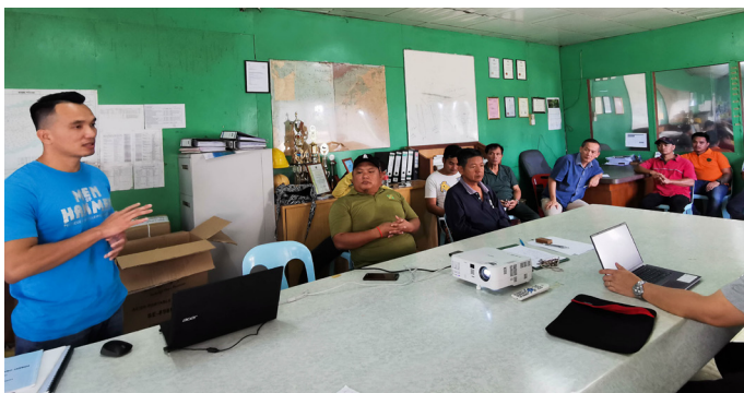
The speaker delivering his presentation

An Awareness Programme on Sustainable Forest Management (SFM) and Forest Management Certification (FMC) for the local communities and camp workers at Kastima Forest Management Unit (FMU) was conducted by the Forest Department Sarawak (FDS) from 20 to 21 August 2019.