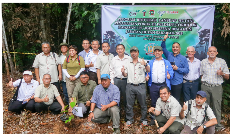
Participants of the symbolic tree planting ceremony

The Forest Department Sarawak (FDS) embarked on a series of follow-up activities after the launching of the forest landscape restoration (FLR) programme by the Chief Minister of Sarawak on 15 June 2019 at Sabal Agroforestry Centre, Simunjan.