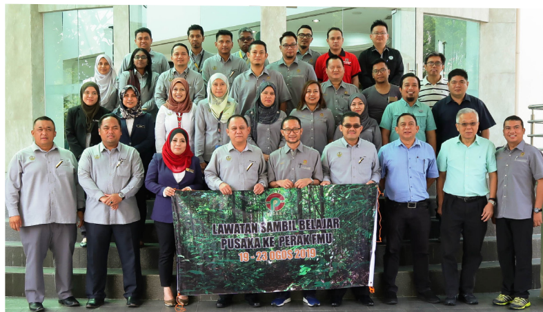
Visit to Perak State Forestry Department Headquarters in Ipoh