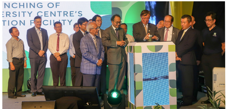
Launching of ACF by the Chief Minister

The Sarawak Biodiversity Centre (SBC), in collaboration with Mitsubishi Corporation (MC) and with technical support from Chitose Group, formed a strategic partnership in setting up an Algae Cultivation Facility (ACF) at SBC, Semengoh, Kuching for large scale production of local microalgal strains. This facility is one of the largest outdoor ACF in Southeast Asia covering an area of 1,000 m 2 , and was launched by the Chief Minister of Sarawak, Datuk Patinggi (Dr) Abang Haji Abdul Rahman Zohari Bin Tun Datuk Abang Haji Openg, on 27 August 2019.