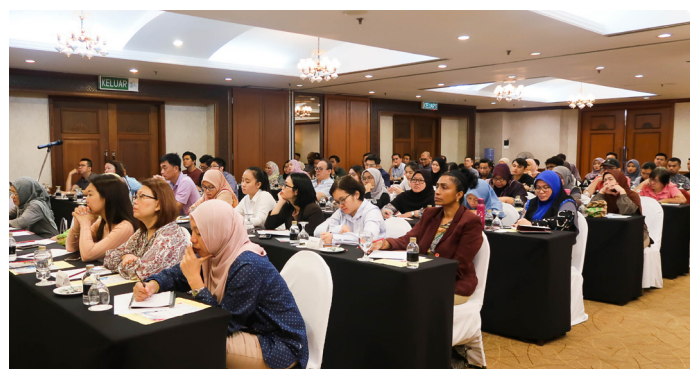
Seminar in progress

On top of that, with collaboration between DDEC and Malaysia Airports Holdings Berhad, a platform was created for small and medium-sized enterprises (SMEs) to sell their products such as food and beverages, handicraft, as well as health and beauty, at the airports in Malaysia. The issues of lab testing, certification and custom declaration of exporting products to foreign markets were also raised during the Session.