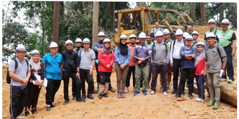
Visit to production forest area at Bukit Kinta

Perbadanan Kemajuan Perusahaan Kayu Sarawak (STIDC) bersama-sama dengan kontraktor pembalakkannya telah mengadakan Lawatan Sambil Belajar ke Negeri Perak dari 19 hingga 23 Ogos 2019 untuk memahami secara lebih mendalam mengenai pelaksanaan pensijilan pengurusan hutan (FMC) oleh Jabatan Perhutanan Negeri Perak (PSFD).