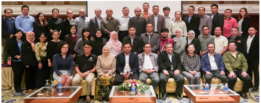
Stakeholders participating in the Consultation Session

However, due to setbacks such as topography and lack of funding, the Project had to be carried out in phases with priority given to the HoB Sarawak areas. With grant of RM3 million from the Ministry of Water, Land and Natural Resources, Phase 1 of the Project was successfully carried out and the Forest Resource Inventory Report is currently being reviewed by the Project Technical Committee. He added that with continued funding from the Ministry, FDS was able to extend the Project to cover HoB Sarawak's extension area which stretches from Batang Ai to Tanjung Datu, aptly called Phase 2 of the Project.