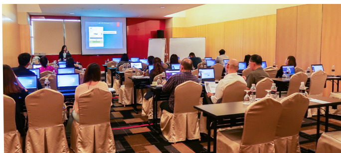
SWIS briefing in progress

SWIS. Similar sessions were also conducted in Bintulu and Sibul previously.