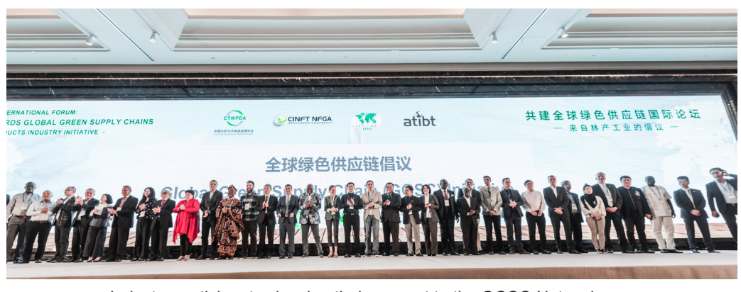
Industry participants showing their support to the GGSC Network

The Forum was co-organised by the International Tropical Timber Organisation (ITTO), China Timber & Wood Products Distribution Association (CTWPDA), Centre for International