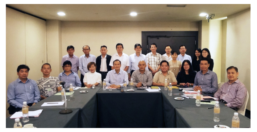
Members attending the Joint Meeting

During the Joint Meeting, members deliberated and agreed to organise a trip to Beijing, China from 9 to 12 March 2020 to participate as