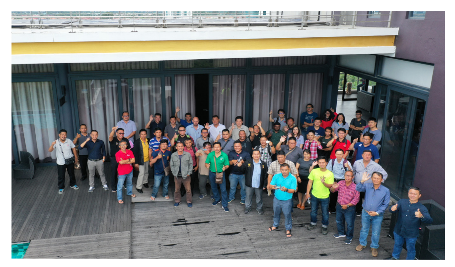
A drone was flown to take a photo of the participants

A Workshop on Drone Application in Managing Licences for Planted Forests (LPF) was jointly organised by Forest Department Sarawak (FDS) and Sarawak Timber Association (STA) from 2 to 4 October 2019 in Bintulu. The Workshop was attended by about seventy (70) participants from the public and private sectors including FDS, LPF Holders, Poladrone Solutions Sdn Bhd (Poladrone), Hurricane Geo Inspection Survey Sdn Bhd (HGIS) and STA Secretariat. The objective of this Workshop was to provide demonstration and practical experience of using an aerial drone in inspecting and monitoring the development of LPF.