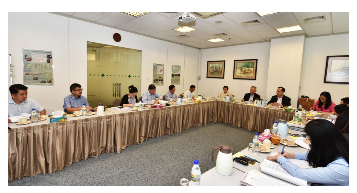
STAM BOD Meeting in progress

The Meeting also approved the Financial Incentive Scheme for Training of Forestry Workmen to all workmen assessed to be competent from 1 February to 24 September 2019 in the 5 PFA.