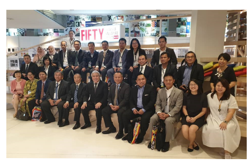
Deputy Chief Minister of Sarawak (front row, 6th from left) with the Sarawak delegation at the National Design Centre

The Mission, organised by the Sarawak Timber Industry Development Corporation, was represented by a total of sixty-seven (67) delegates from the public and private sectors. The private sector comprised members from the Sarawak Furniture Industry Association and Sarawak Timber Association (STA).