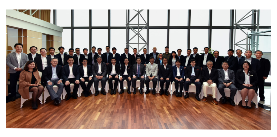
Participants of the 22<sup>nd</sup> Tri-Nation Joint Meeting

JPMA reported that the demand and supply of plywood in the country remains stable. As for housing demand, it is so far steady and will remain so until the end of this year. However, the hike in Japan's consumption tax from 8% to 10% effective 1 October 2019 will affect housing demand beginning next year.