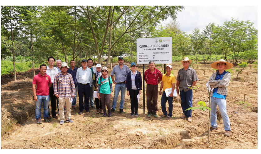
Participants at the Clonal Hedge Garden at LPF0043, Samarakan

A Field Inspection to the research area located at Licence for Planted Forests (LPF) 0043, Samarakan, Bintulu, was conducted