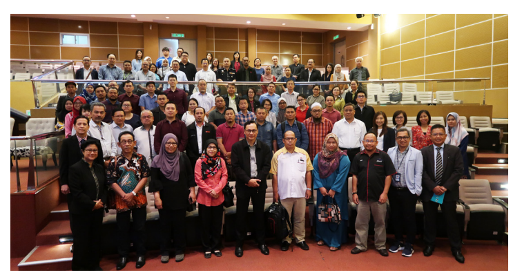
Participants of the Town Hall Session

Beberapa isu yang telah dikemukakan oleh para peserta semasa sesi tersebut adalah seperti yang disenaraikan dalam artikel ini.