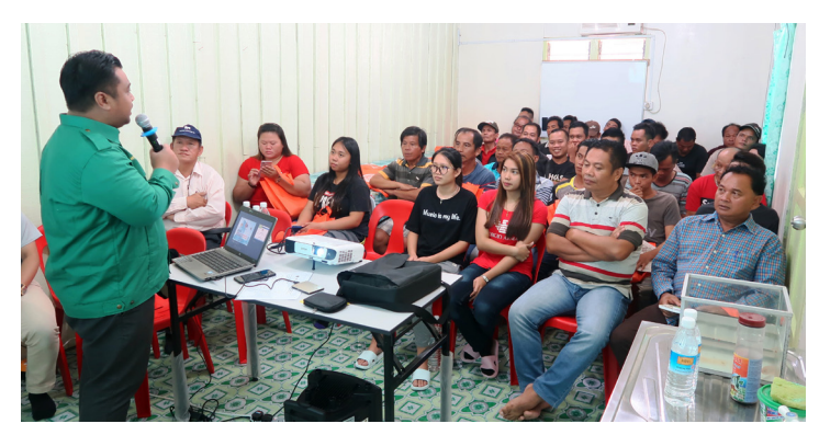
Briefing in progress

The use of simple HIRARC technique and process to identify various hazards at the workplace such as health