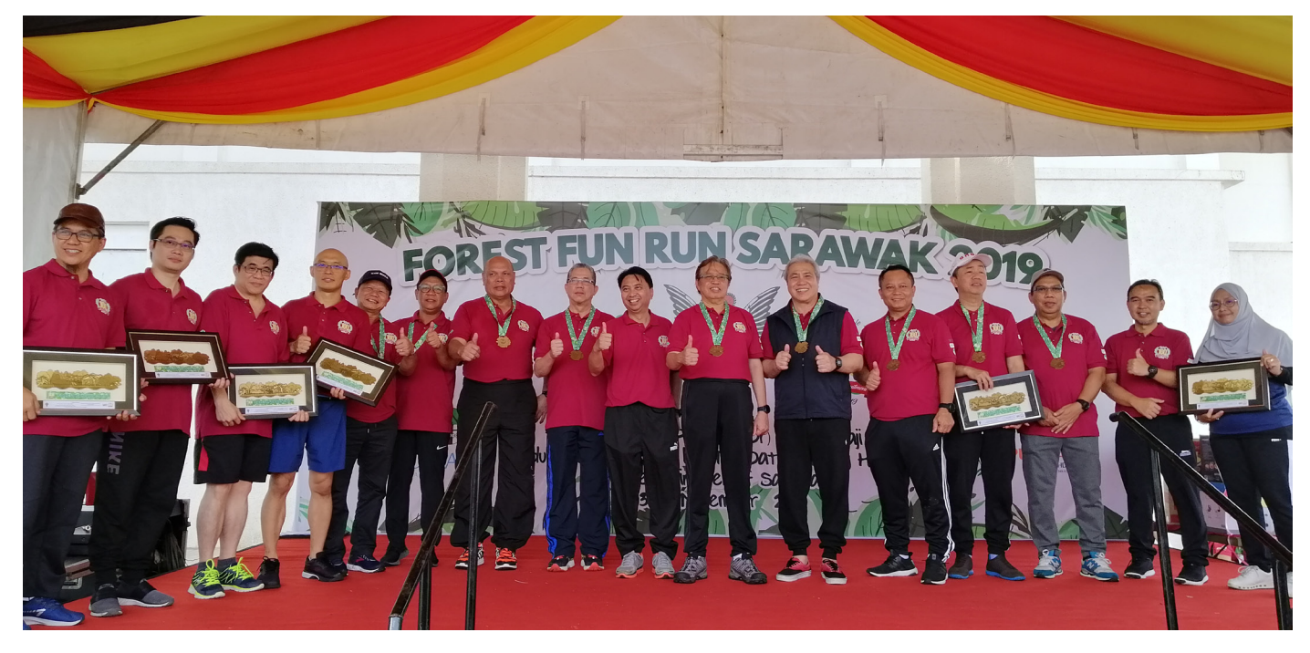
The finisher medal collection was presented to the co-organisers as a token of appreciation during the Forest Run